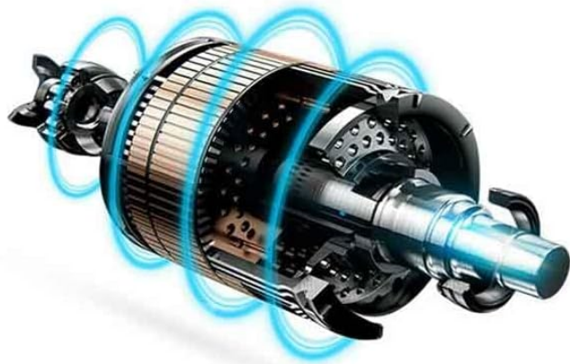
Image 7.1: An X-ray view of the trimmer highlighting its powerful motor, indicating high speed, low noise, and stable, efficient performance suitable for various hair types.