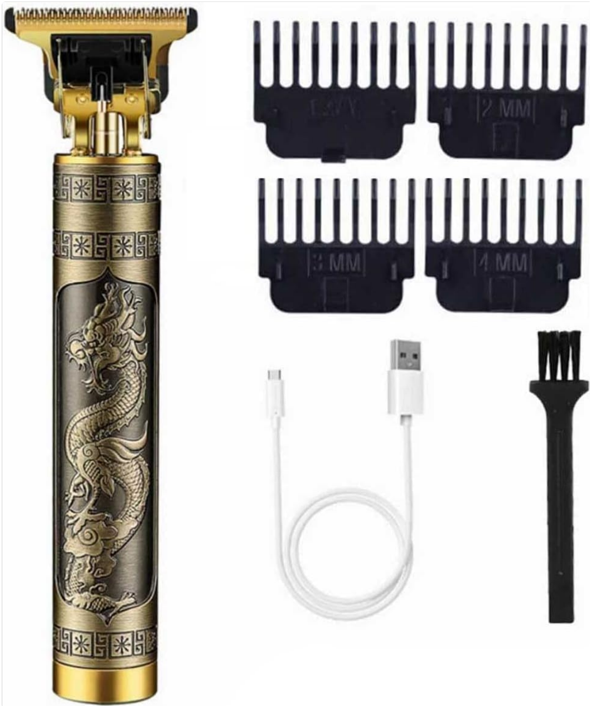
Image 1.1: The Vintage T9 Hair Clipper Trimmer shown with its included accessories: USB charging cable, cleaning brush, and four limit combs (1.5mm, 2mm, 3mm, 4mm). The clipper features a bronze finish with an engraved dragon pattern.