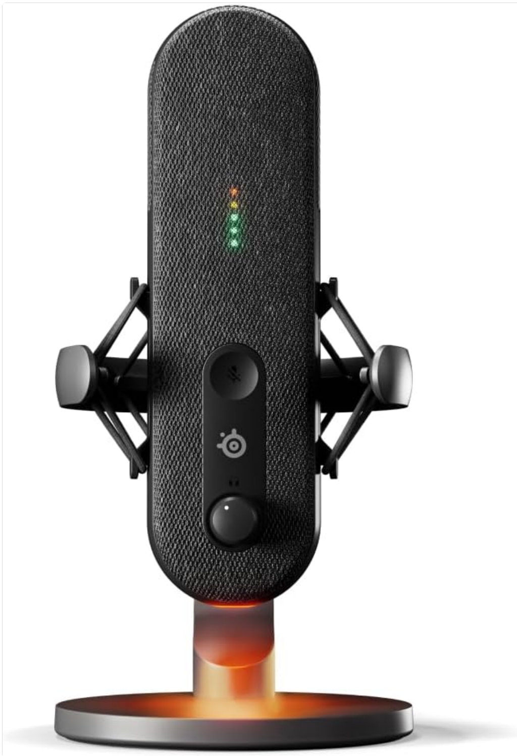
Figure 1: SteelSeries Alias USB Microphone with desktop stand.