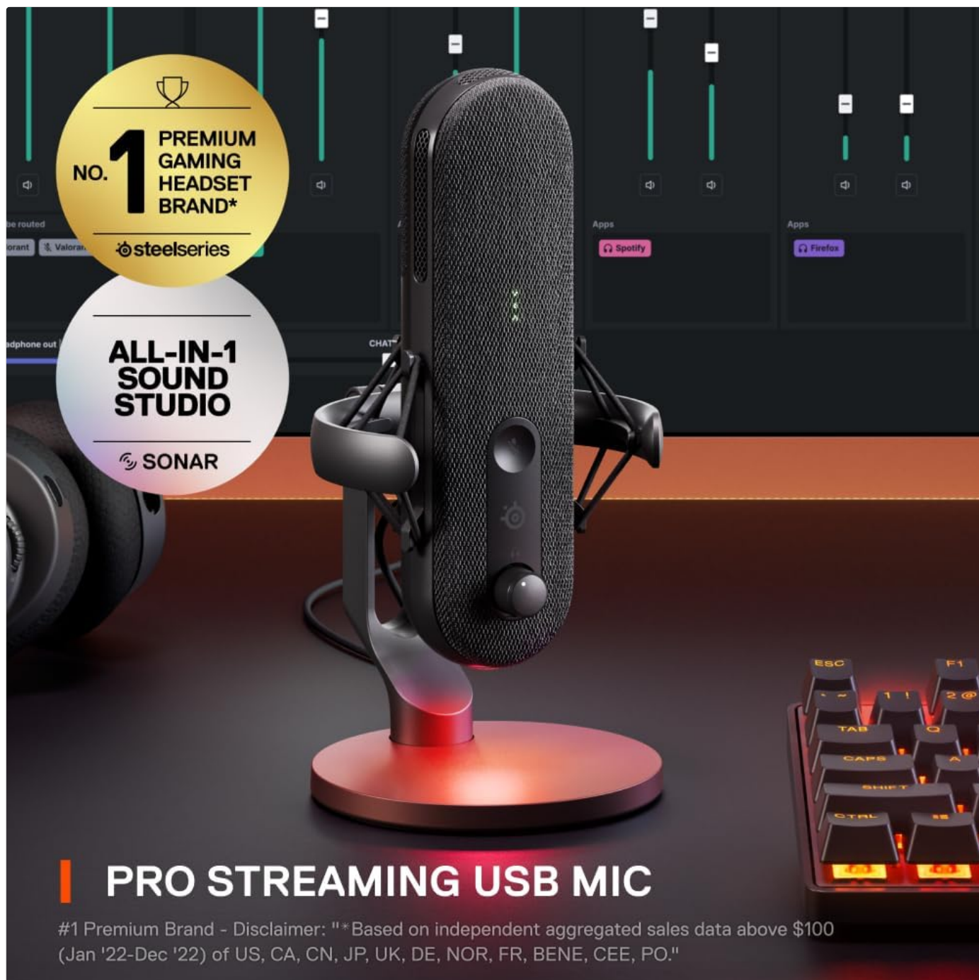
Figure 7: Voice capture capabilities of the Alias microphone.