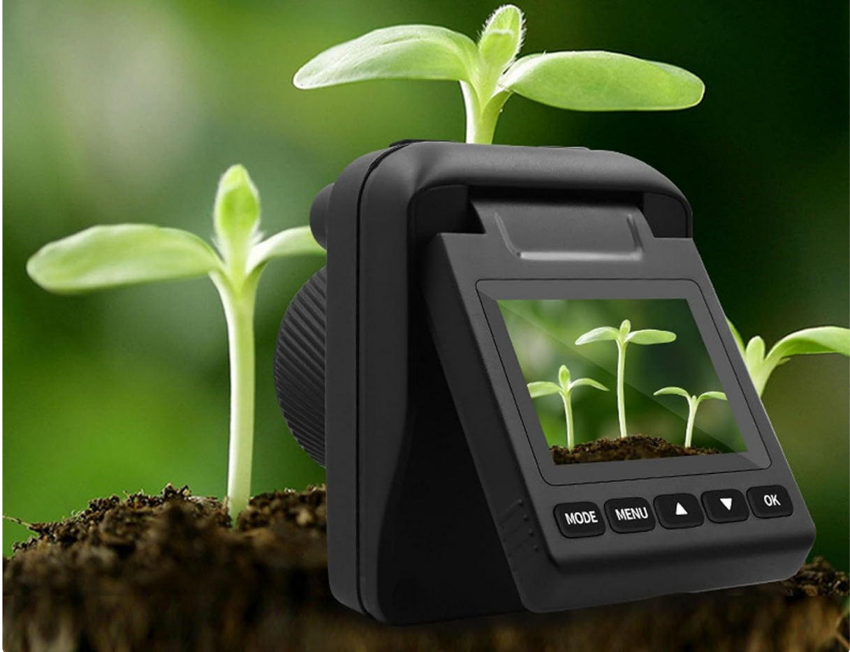
Image 6.1: The camera displaying a macro shot of young plants on its screen, illustrating its capability for detailed close-up time-lapse photography.

FULL COLOR MACRO SHOOTING TIME LAPSE CAMERA MANUAL MACRO FOCUSING LOW LIGHT FULL COLOR 4K VIDEO RECORDING SCREEN ROTATES 90 DEGREE