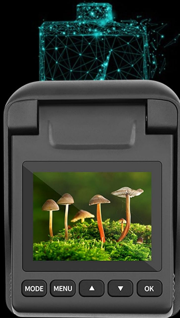
Image 5.1: Illustration of the camera's 3000mAh Lithium-Ion battery, highlighting its capacity for extended operation.