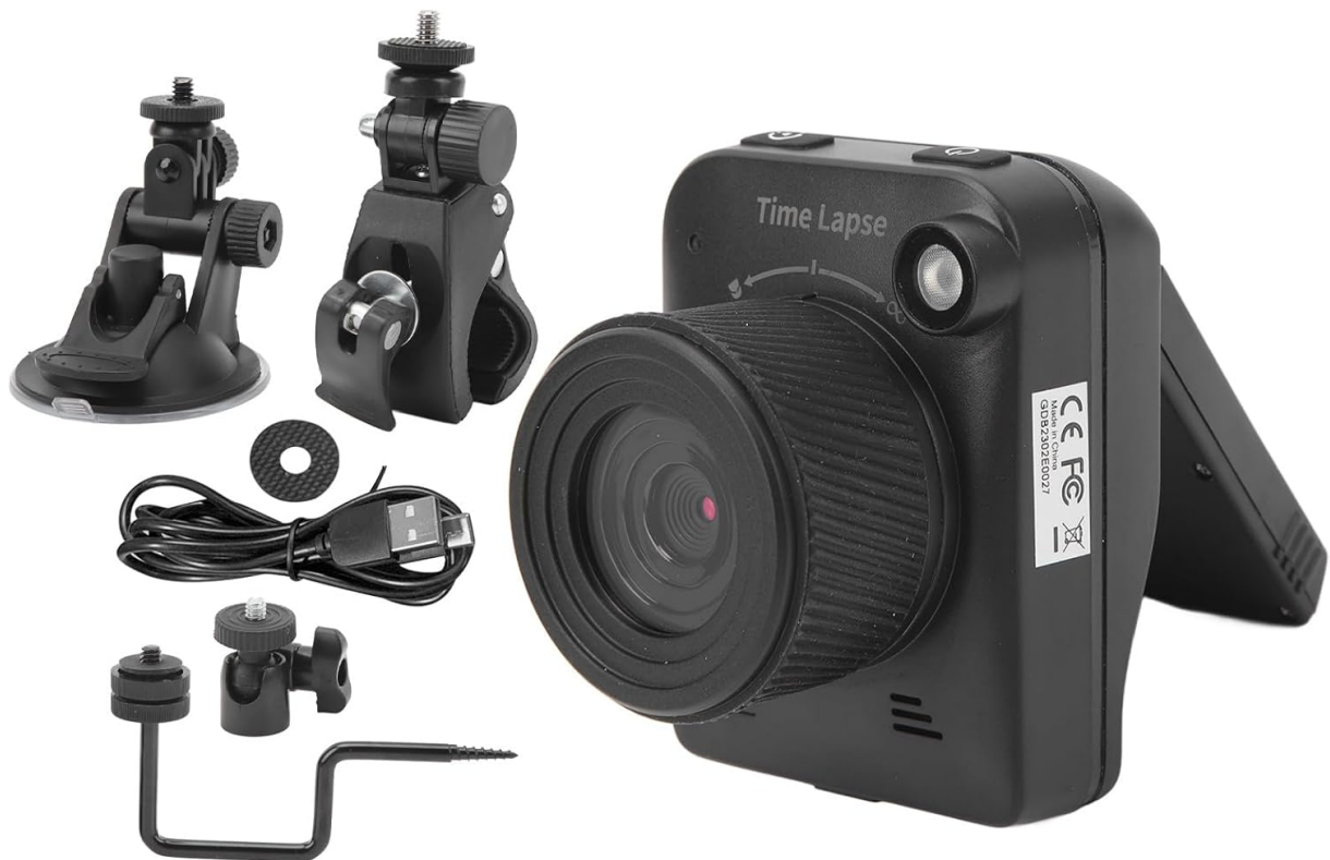
Image 3.1: All components included in the Bewinner Time Lapse Camera package, showing the camera body, various mounting accessories, and the USB cable.