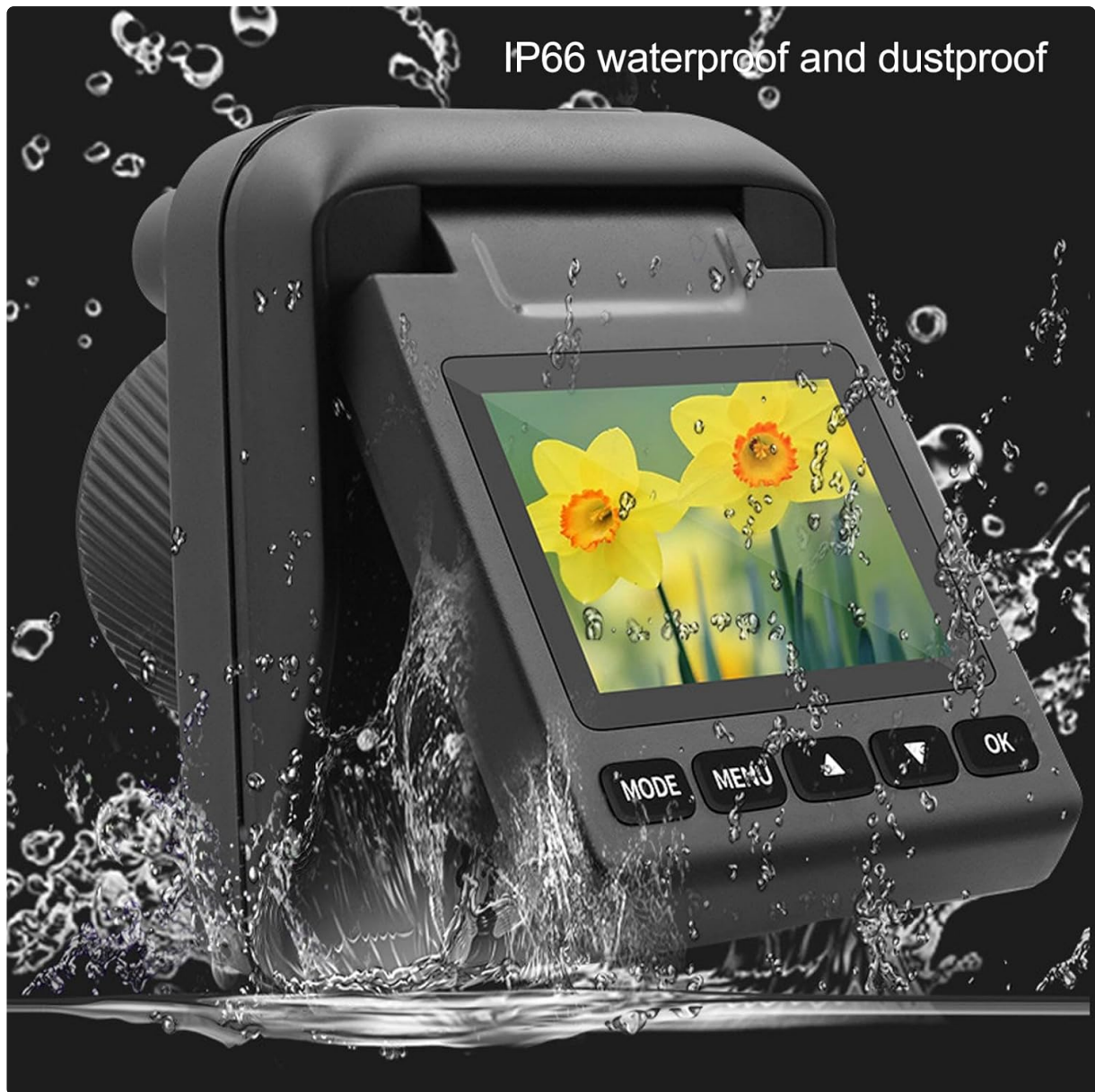
Image 7.1: The Bewinner Time Lapse Camera being splashed with water, visually confirming its IP66 waterproof and dustproof capabilities for outdoor use.