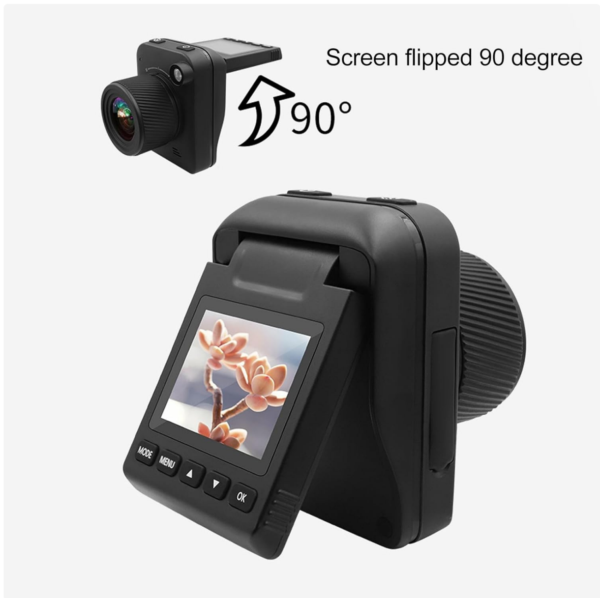
Image 4.1: The Bewinner Time Lapse Camera demonstrating its 2.0-inch LCD screen, which can be flipped 90 degrees for flexible viewing and operation.