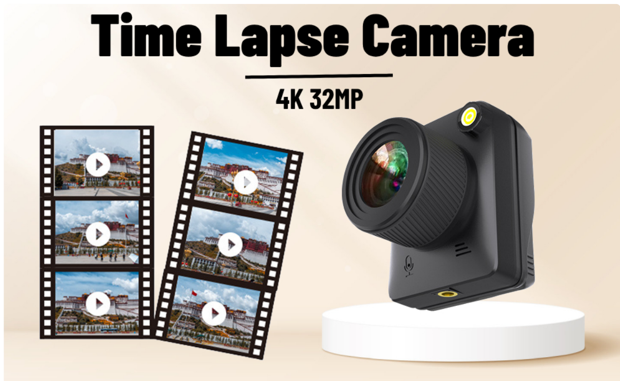
Image 1.1: Overview of the Bewinner Time Lapse Camera's key features, including 32MP resolution, 4K video, 6-month standby, low light full color, real-time time-lapse, LED fill light, IP66 waterproof, and manual macro focusing.

Thank you for choosing the Bewinner 4K 32MP Time Lapse Camera. This camera is designed for capturing high-quality time-lapse videos and photos, suitable for various outdoor and indoor applications such as monitoring construction projects, plant growth, weather changes, and more. Featuring 4K video recording, 32MP photo resolution, a 2.0-inch LCD screen, IP66 waterproof rating, and a long battery life, this device offers versatile functionality for your creative and monitoring needs.