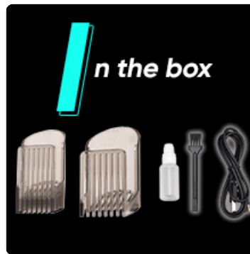
Image: Illustration showing the contents included in the product box: two comb attachments, a small bottle of lubricating oil, a cleaning brush, and a USB charging cable.