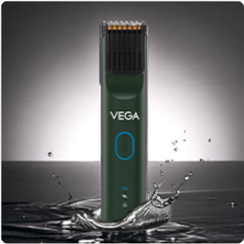
Image: An icon indicating the product's waterproof capability, suitable for rinsing.

blade head under running water. Ensure the trimmer is turned off before rinsing.