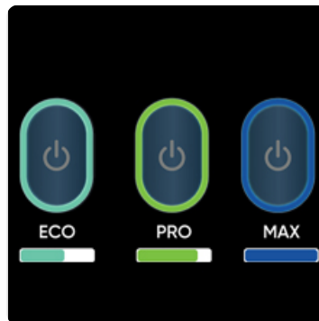
Image: Individual icons representing the Eco, Pro, and Max speed settings, each with a distinct color indicator.