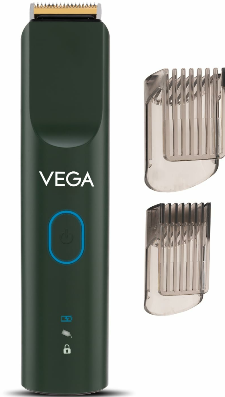
Image: The VEGA SmartOne S3 Beard Trimmer in green, shown with its two transparent comb attachments. The trimmer features a power button with a blue ring and indicator lights for battery and travel lock.