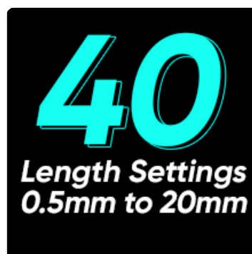
Image: A graphic highlighting the 40 length settings available, ranging from 0.5mm to 20mm, for precise trimming.