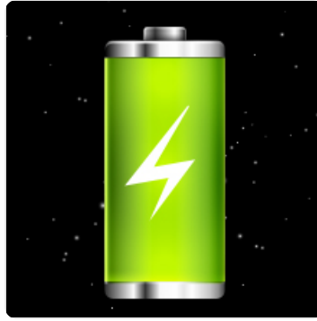
Image: A green battery icon with a lightning bolt, symbolizing the charging process.