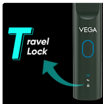
Image: A graphic depicting a lock icon with an arrow pointing to the trimmer, indicating the travel lock feature.