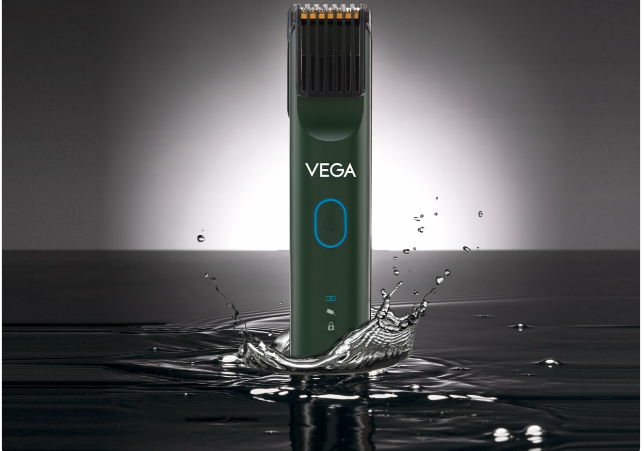
Image: The trimmer partially submerged in water with splashes, visually representing its IPX7 waterproof rating.