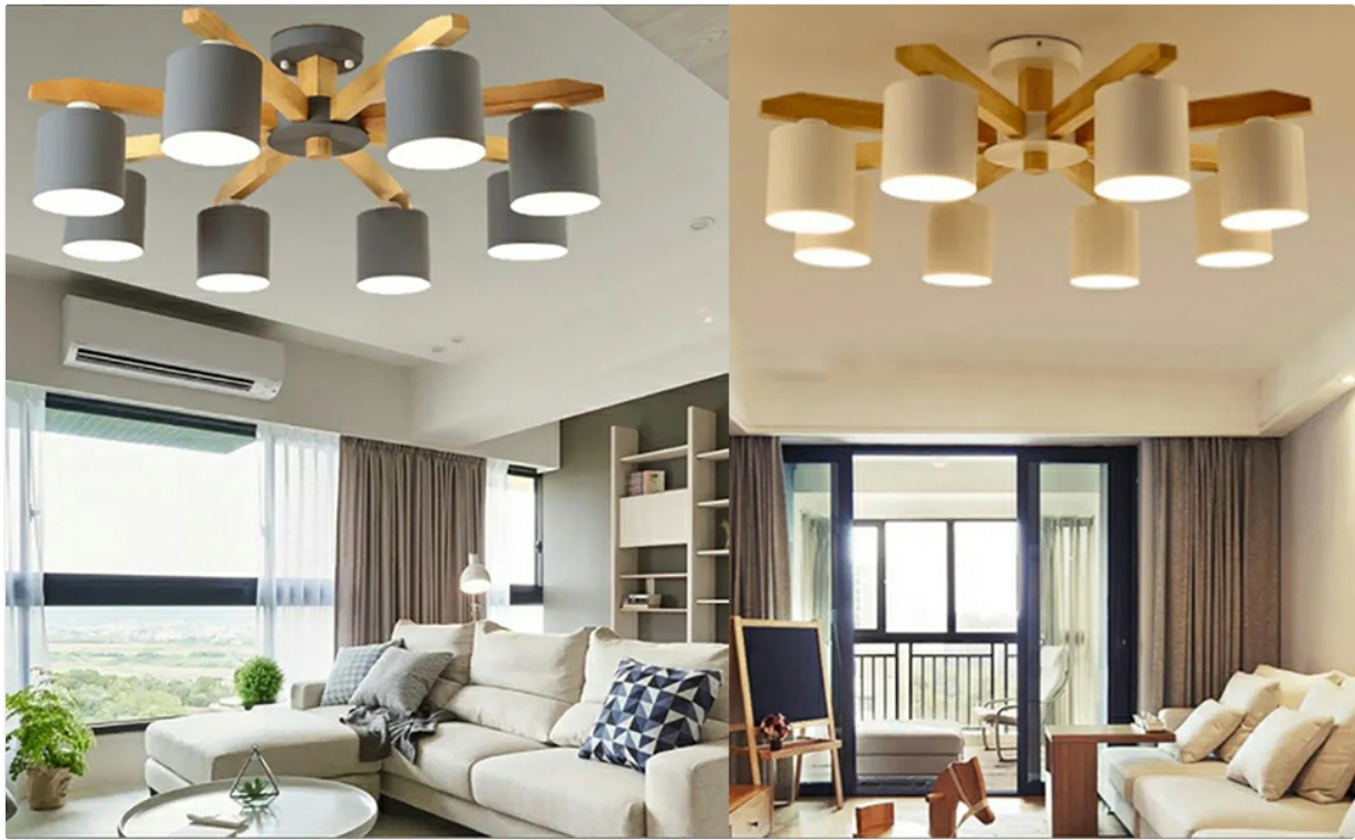
Image: Details of the solid wood and metal construction.