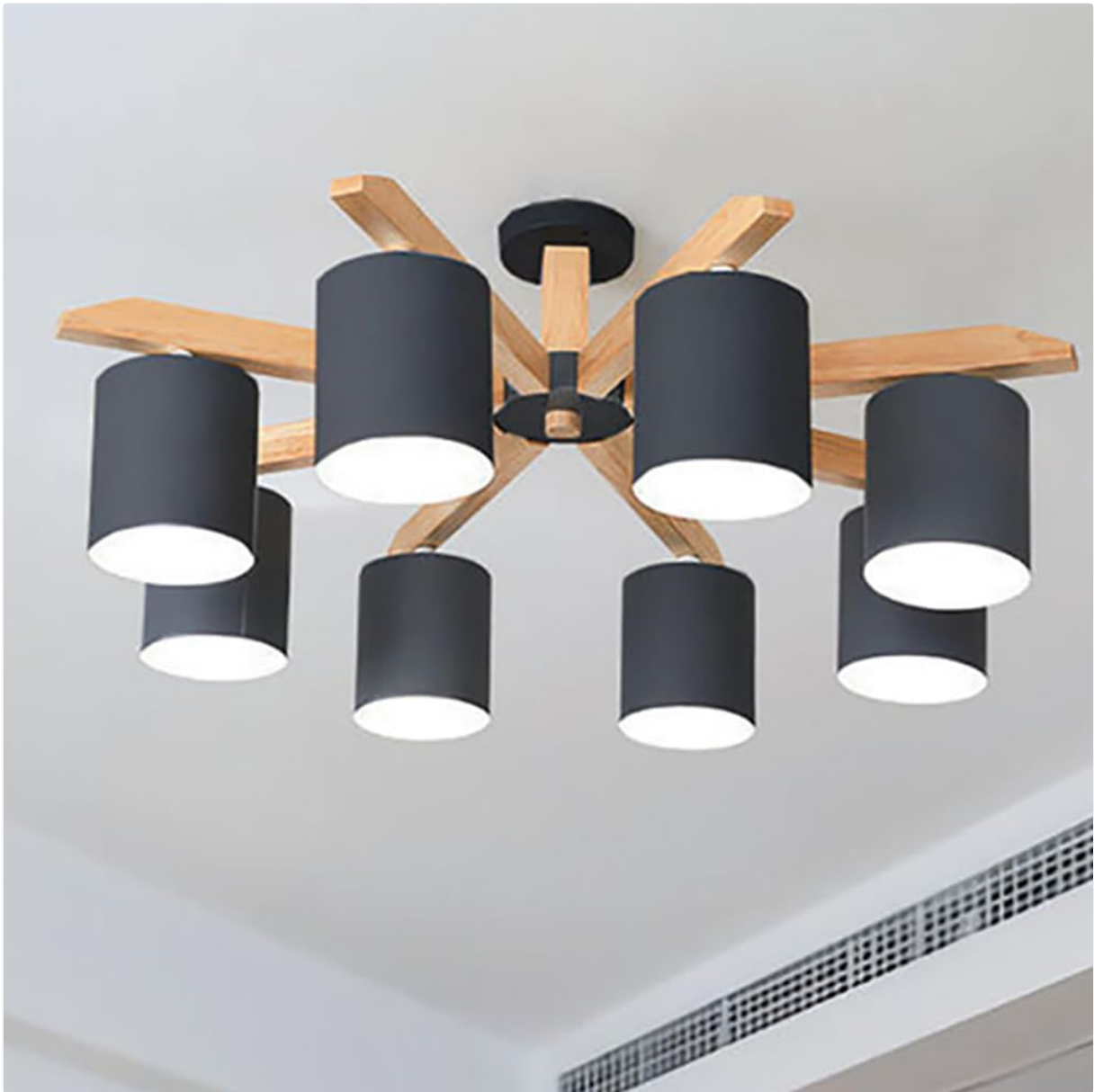
Image: The Liudefa 8-Light Modern Wood Recessed LED Ceiling Light installed.