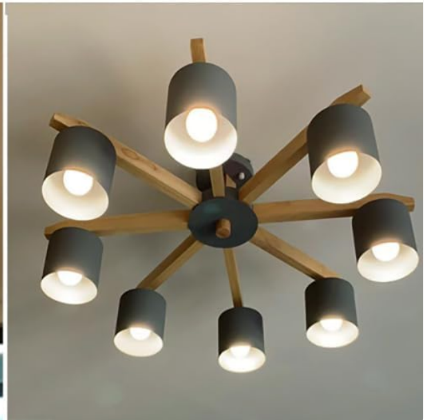
Image: The ceiling light fixture in a bedroom.