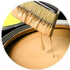
Environmental protection paint

Non-polluting, environmentally friendly paint, good decorative performance, smooth and delicate