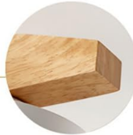
Beautiful and translucent

Image: The ceiling light fixture showcasing its design.