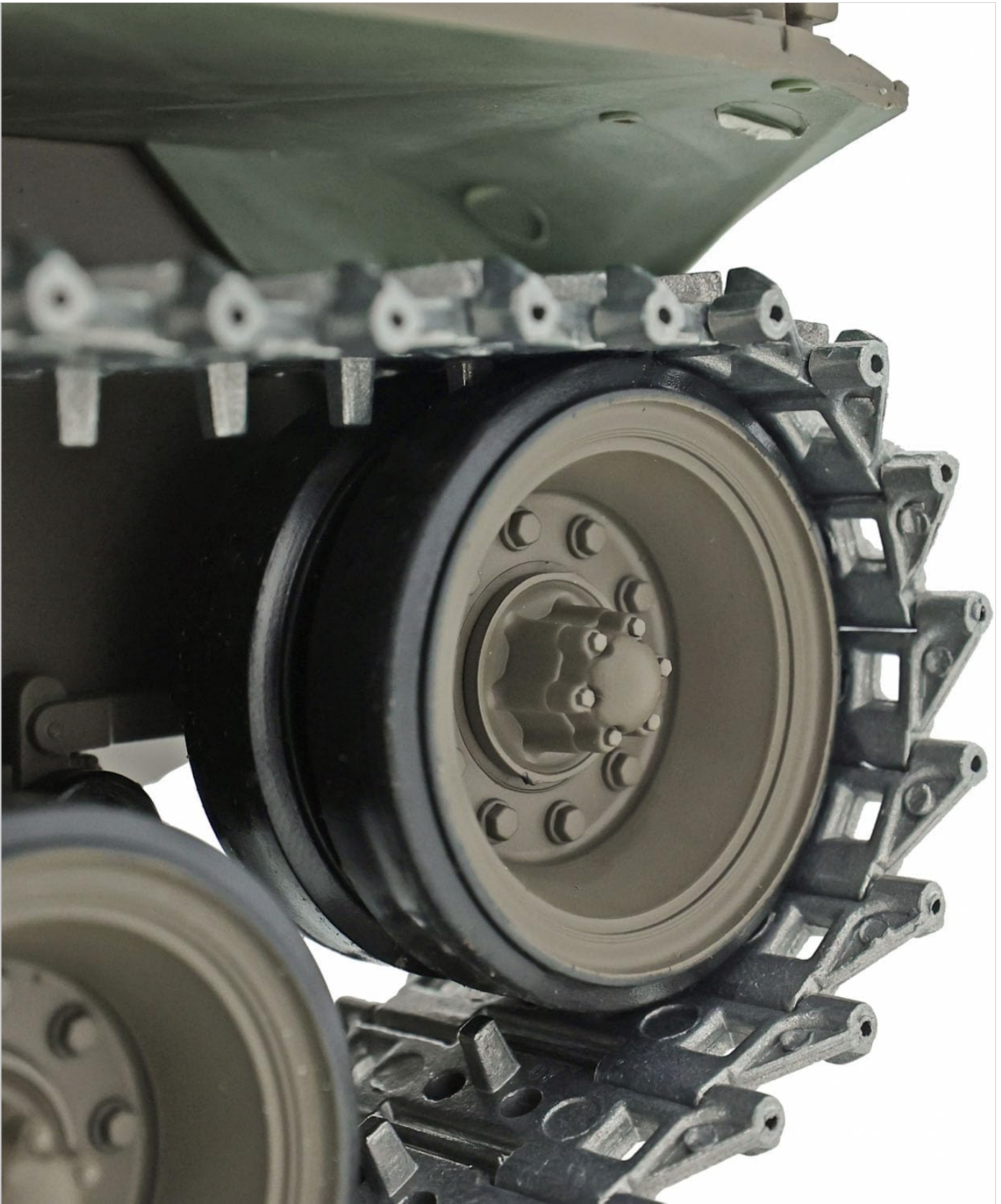
Image: A close-up view of the durable metal tracks, emphasizing their construction.