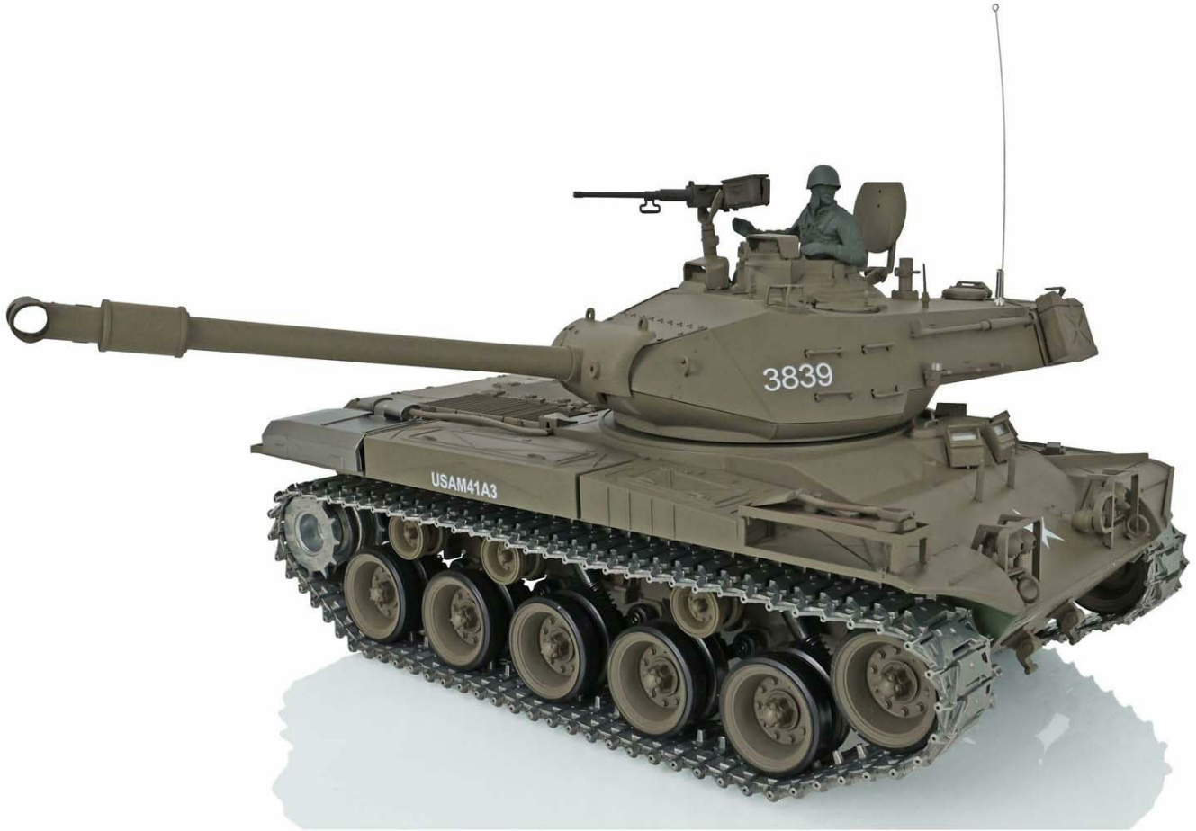
Image: The Heng Long Walker Bulldog 1/16 Scale RC Tank, showcasing its detailed design and metal tracks.