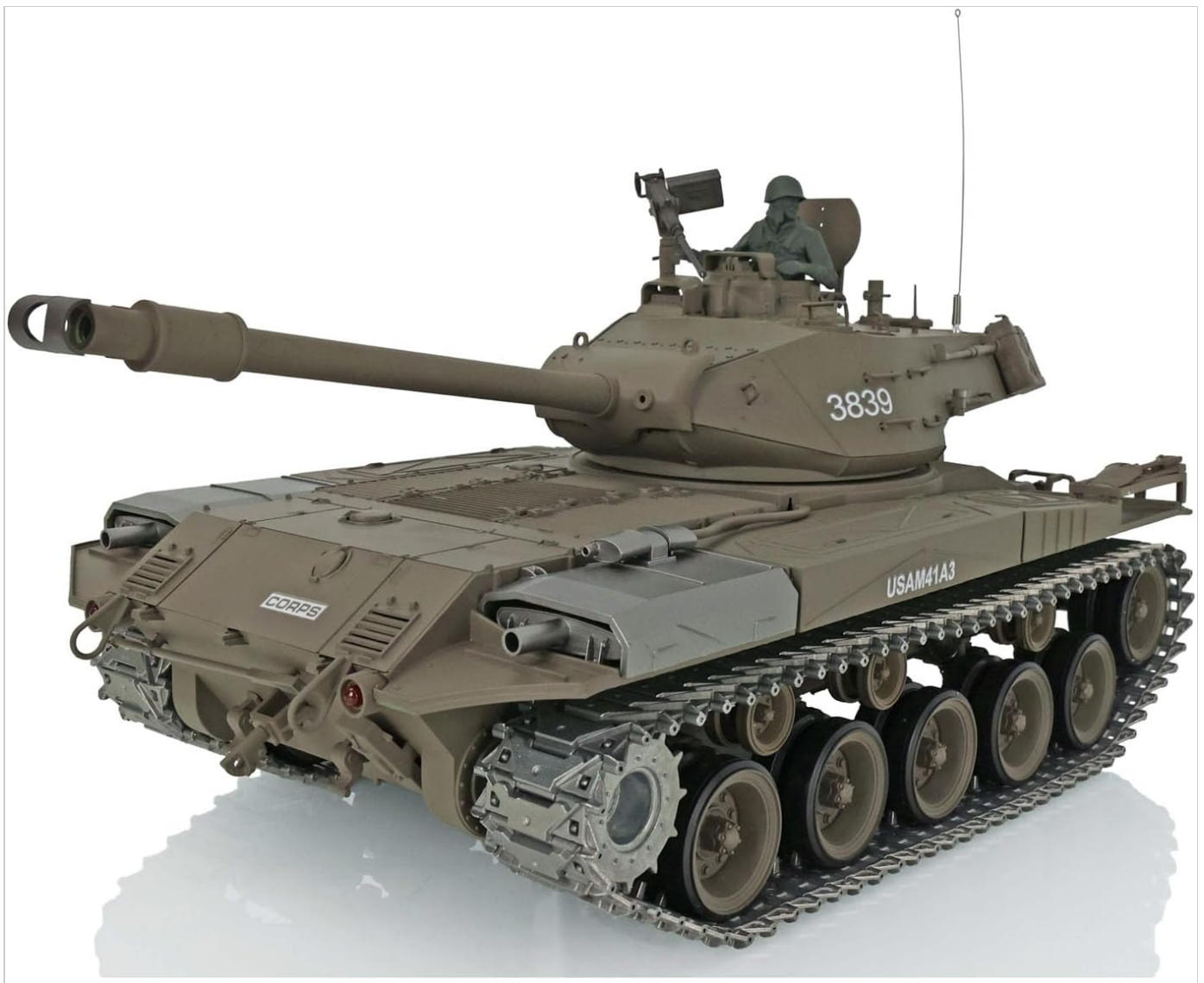
Image: Front view of the tank, showing the main gun and front details.