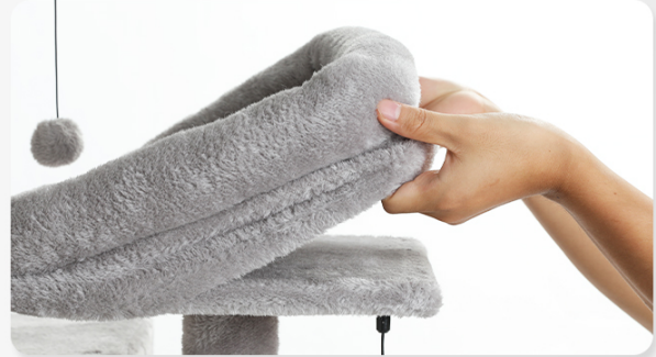
Machine-Washable Detachable Perch

Image: A cat actively scratching a sisal-covered post, illustrating the multiple scratching areas available.