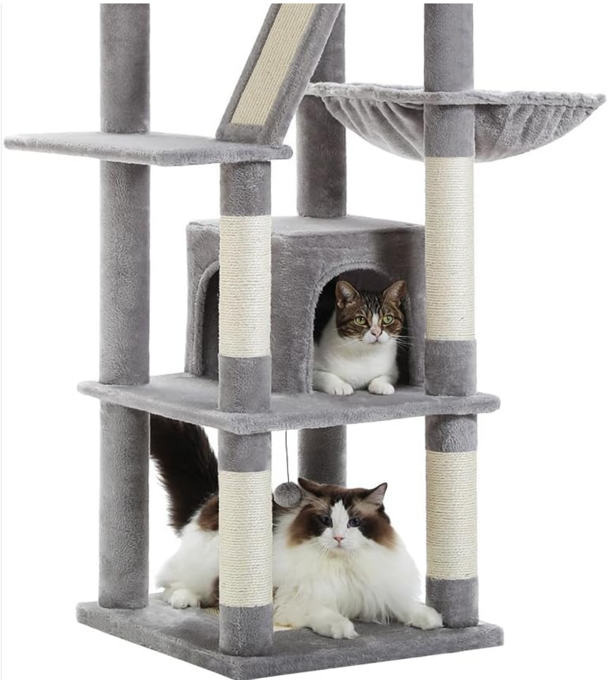
Image: The fully assembled PEQUITI Large Cat Tree, showcasing its multi-level design and various features, with several cats enjoying different sections.