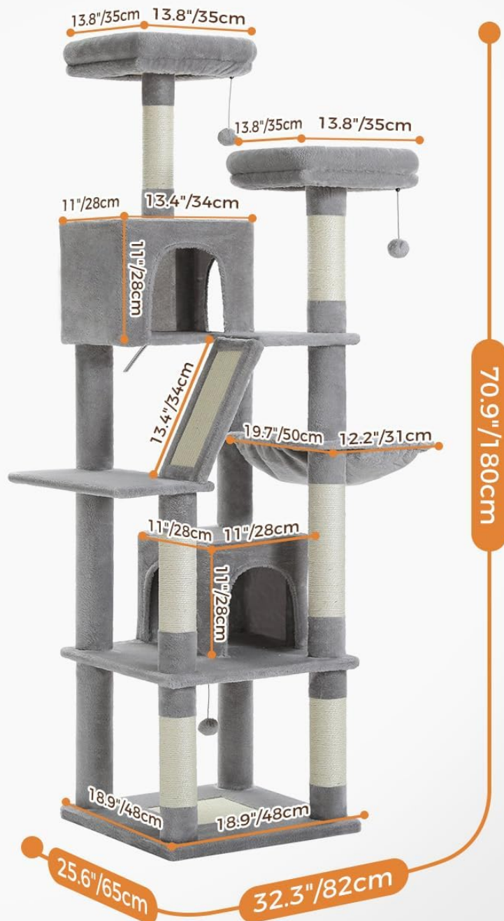
Image: A detailed diagram illustrating the various dimensions of the cat tree, including height, width, and platform sizes.