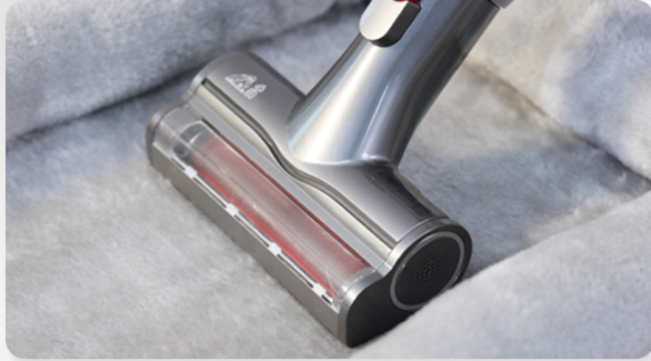
Easily Cleaned Surface