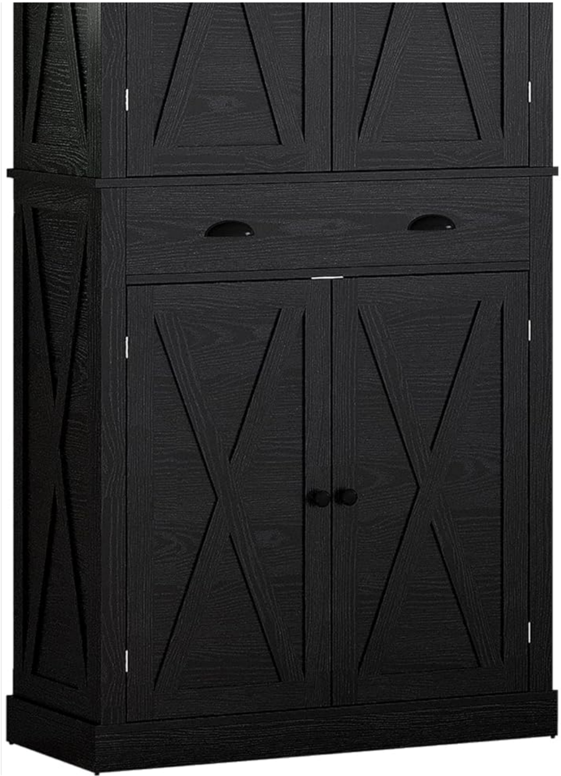
Figure 1: Front view of the IRONCK Kitchen Pantry Storage Cabinet (Model HK-PA-01) in black, with barn doors closed.