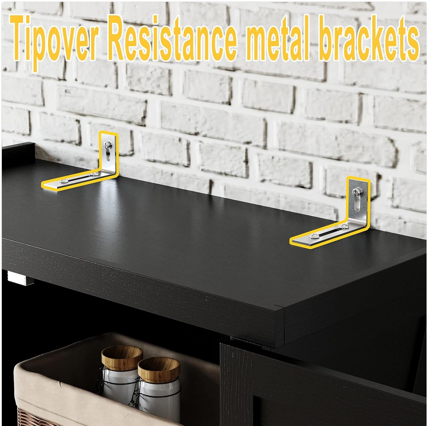
Figure 2: Illustration of the anti-topple metal brackets for wall attachment, enhancing cabinet stability.