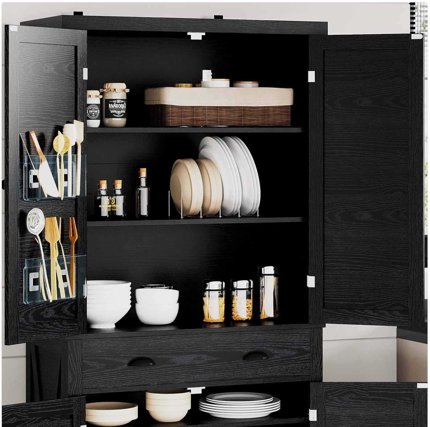
Figure 6: Interior organization with adjustable shelves, door-hung bins, and a plate divider.