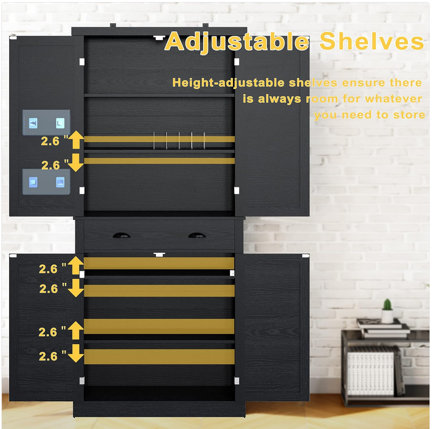
Figure 4: Visual guide for adjusting shelf heights within the cabinet.

4. Place the shelf onto the new pins, ensuring it is stable before loading items.