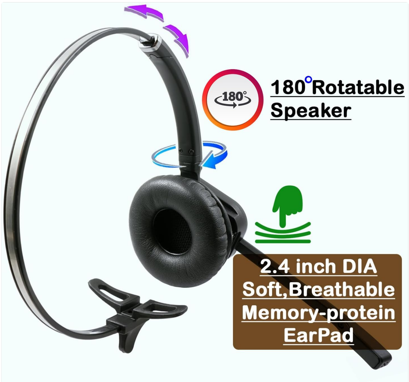
Image: Headset with 180° rotatable speaker and comfortable ear pad.