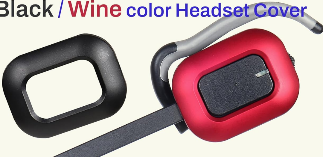
Image: Digital noise-canceling microphone and changeable headset covers.

FREE Earhook & Changeable Black / Wine color Headset Cover