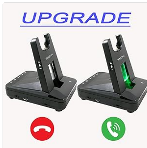
Image: Headset controls for call management.