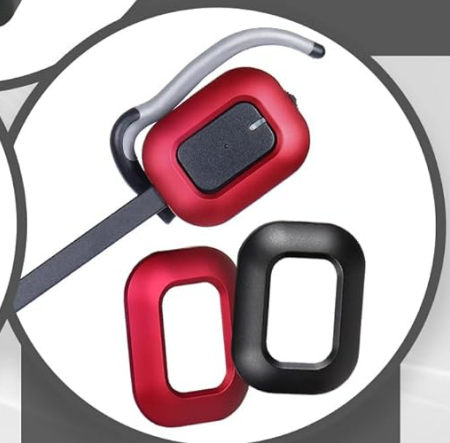
Image: Components included in the INNOTALK Wireless Headset package.

Earhook, Black & Wine Color Headset Cover