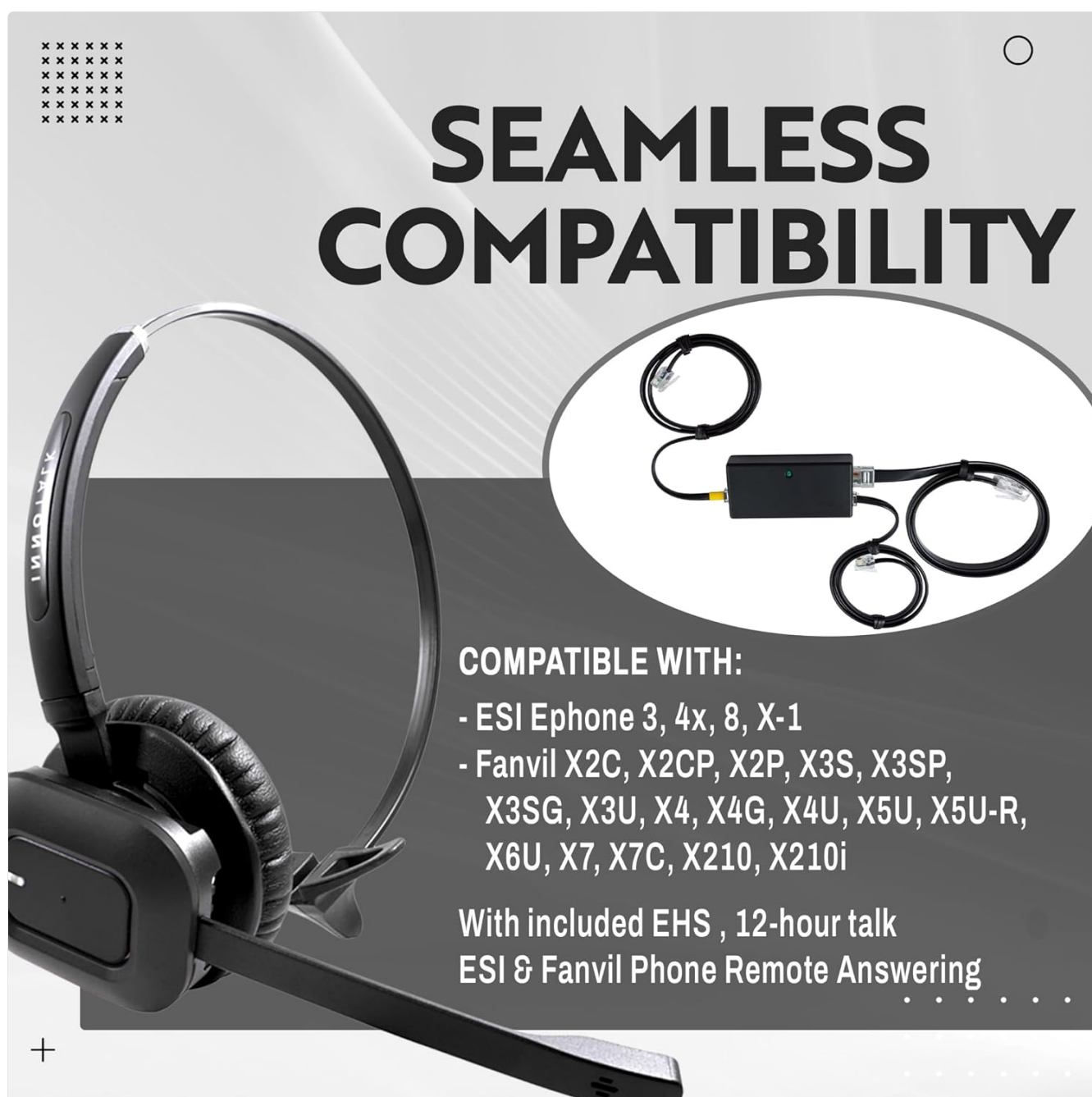
Image: Connection diagram for the INNOTALK Wireless Headset with a Fanvil phone using the EHS cable.

6. Configure Phone Settings: Ensure your desk phone's settings are configured to use a headset and EHS functionality. Consult your phone's manual for specific instructions on enabling EHS.