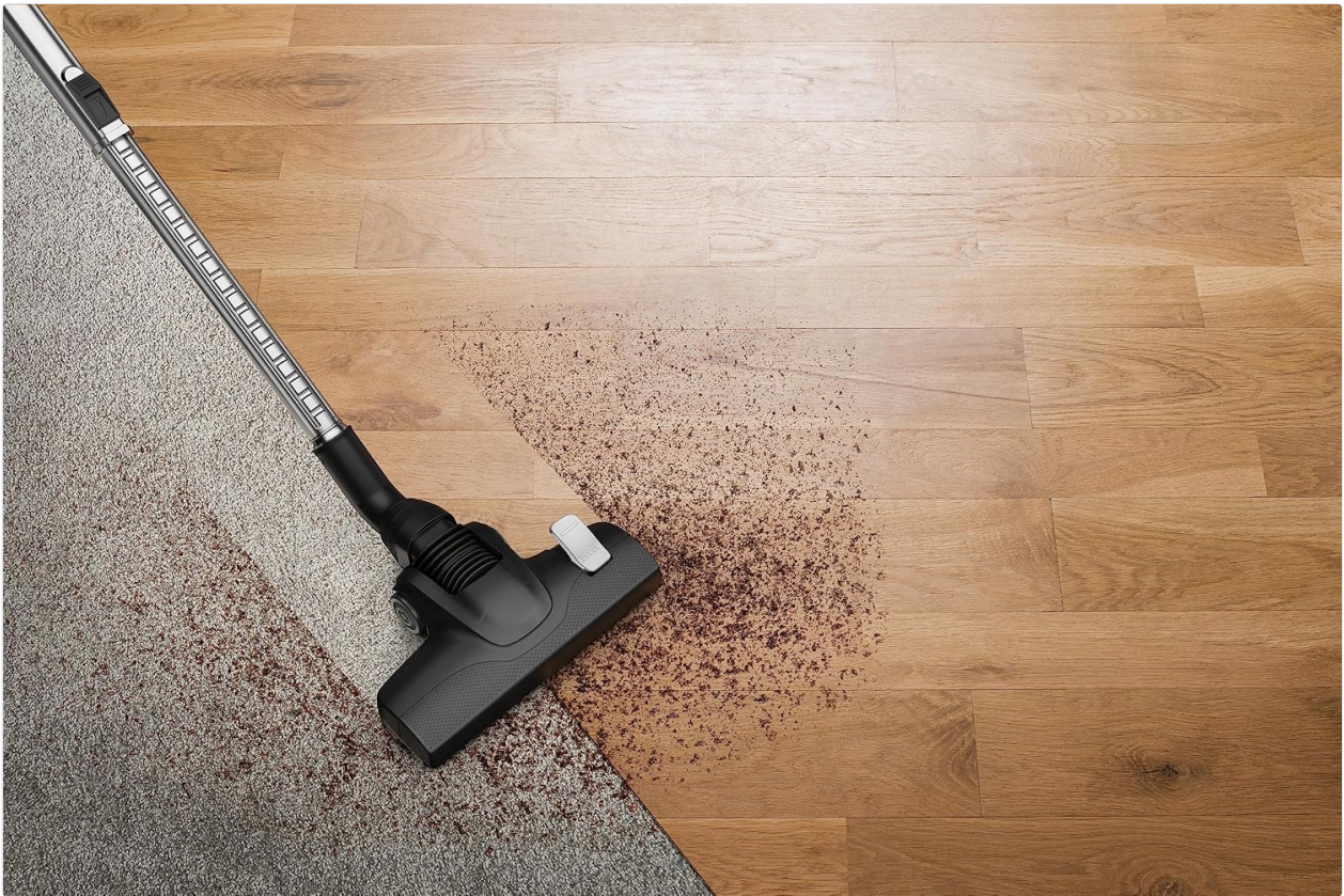
Image: The vacuum nozzle moving from a carpeted area to a hard floor, illustrating its multi-surface capability.