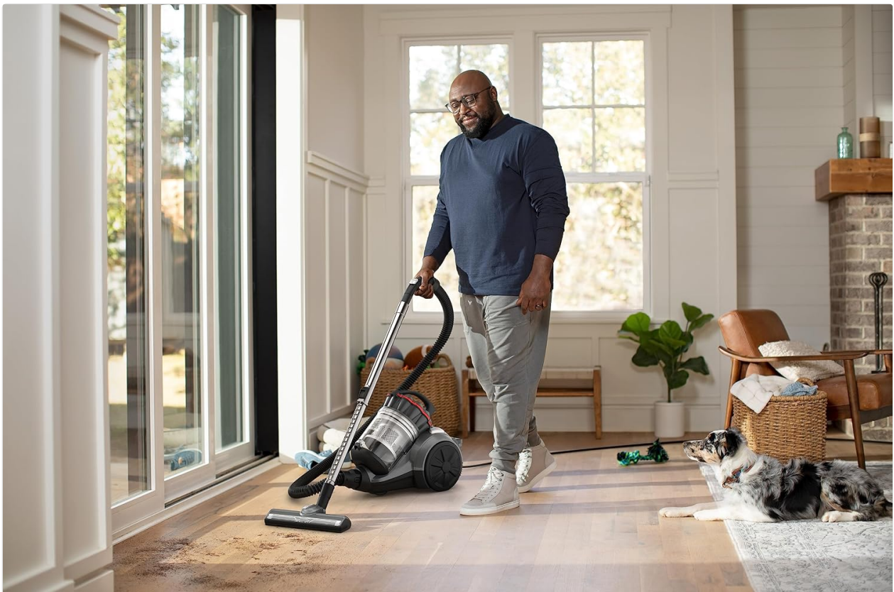
Image: The vacuum nozzle effectively cleaning a hard floor, demonstrating debris collection.