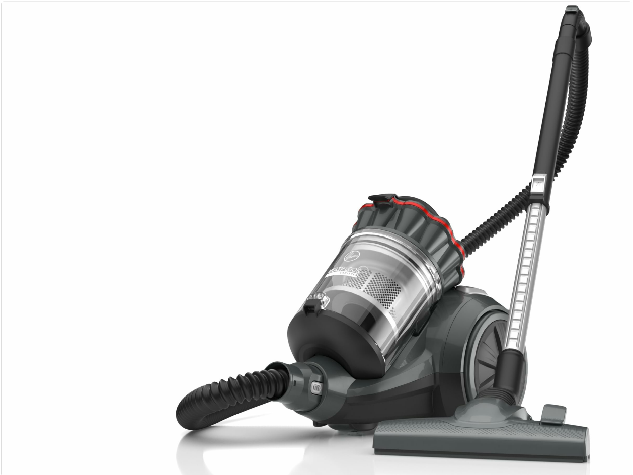
Image: The Hoover MultiFloor Bagless Canister Vacuum Cleaner SH40210CA, showing the main unit, hose, wand, and floor nozzle.