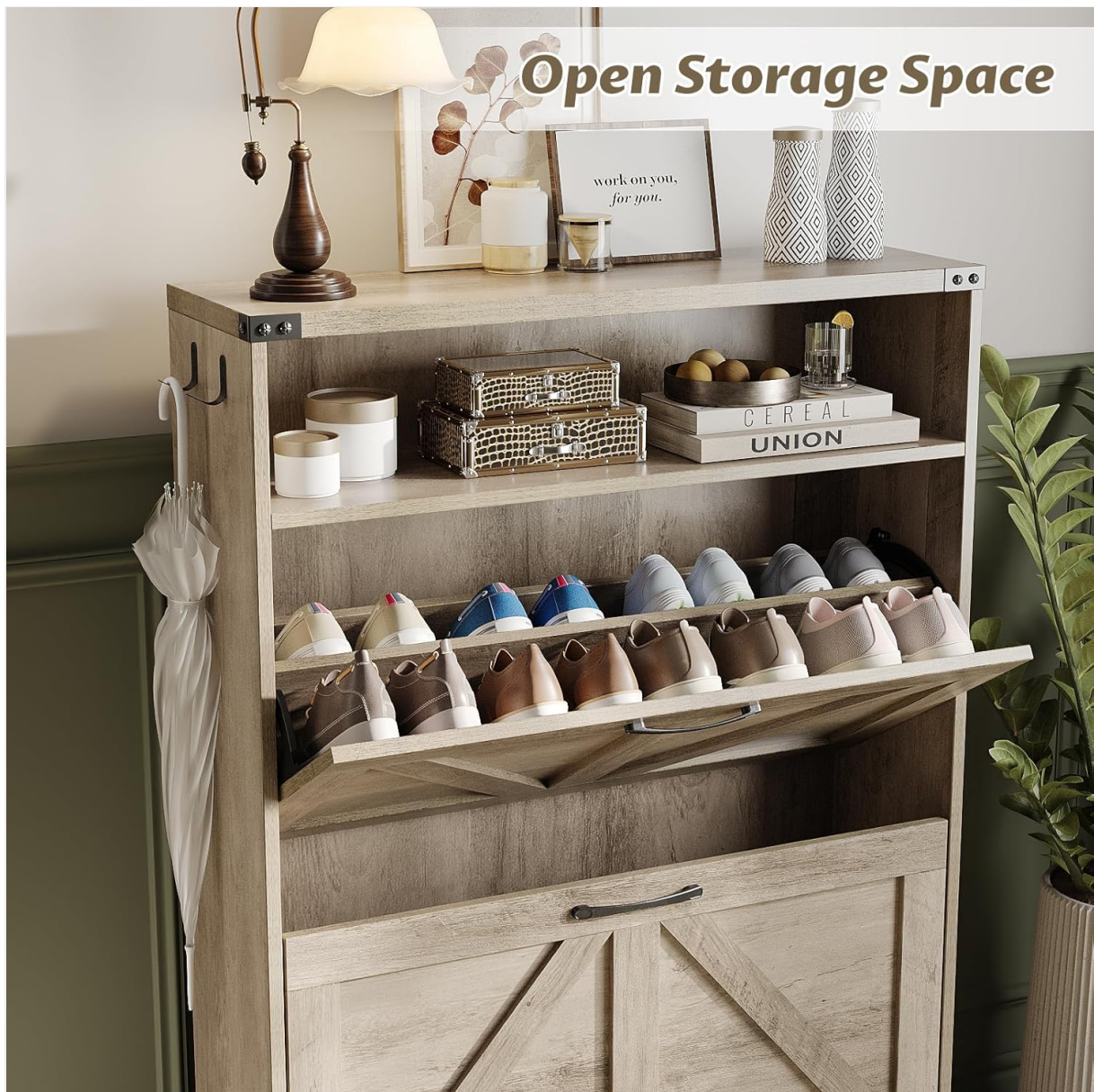
Image 5.3: The open top shelf and surface of the cabinet, used for displaying decor or storing small items.