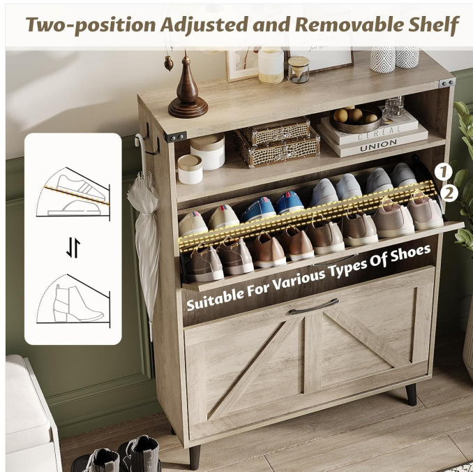
Image 5.2: An illustration demonstrating how the internal shelf can be adjusted to two positions or removed to fit different shoe types.