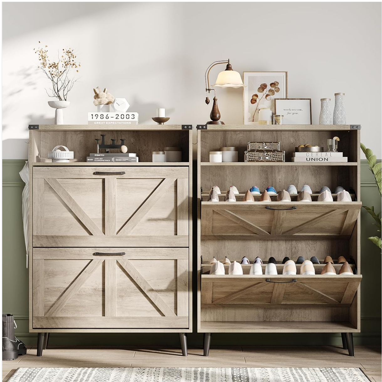
Image 5.1: A view of the shoe cabinet with its flip drawers open, showcasing the internal storage capacity for shoes.