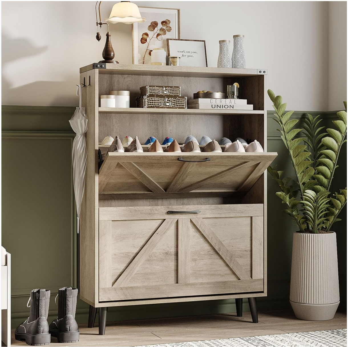
Image 1.1: Fully assembled Halitaa Grey Shoe Cabinet in an entryway setting.