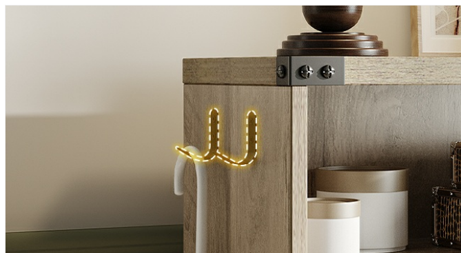
Image 5.4: A detailed view of the side hook, demonstrating its use for hanging an umbrella.

The cabinet includes a side hook for hanging items such as umbrellas or small bags, enhancing its functionality in an entryway.