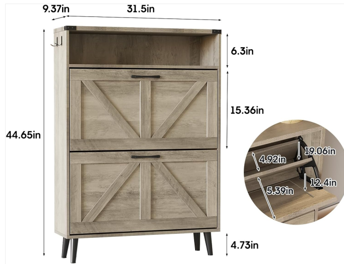
Image 4.1: Detailed dimensions of the shoe cabinet, including overall height, width, depth, and internal drawer measurements.