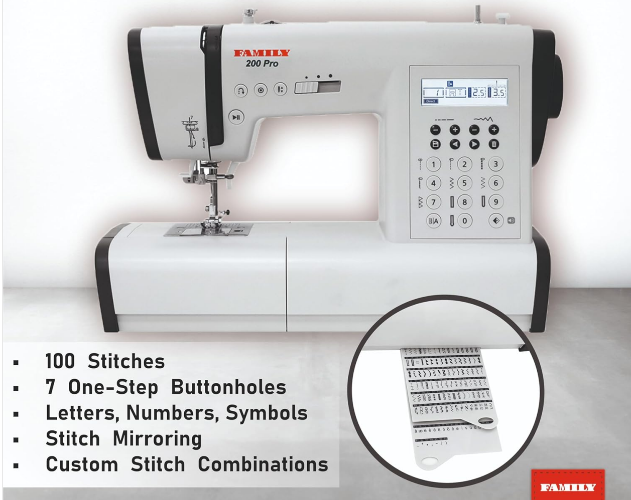
Image 5.3: Overview of the creative options available on the FAMILY 200 PRO, including stitch types and customization features.