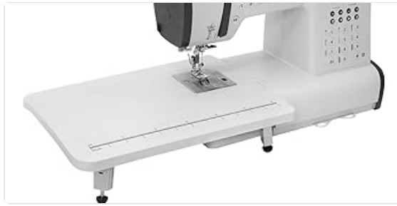
Image 3.3: The FAMILY 200 PRO sewing machine with the extension table attached, providing a larger work surface.