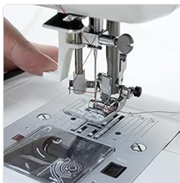
Image 5.2: Demonstrating the use of the automatic needle threader for effortless threading.