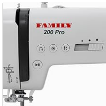
Image 5.6: The Start/Stop and speed adjustment buttons for controlling sewing operation.