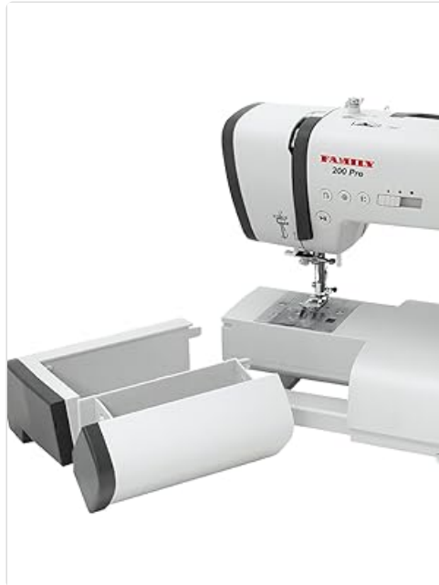
Image 3.4: The free arm feature of the FAMILY 200 PRO, revealing accessory storage.