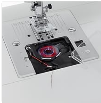
Image 5.1: Correct insertion of the top-loading bobbin into the bobbin case.