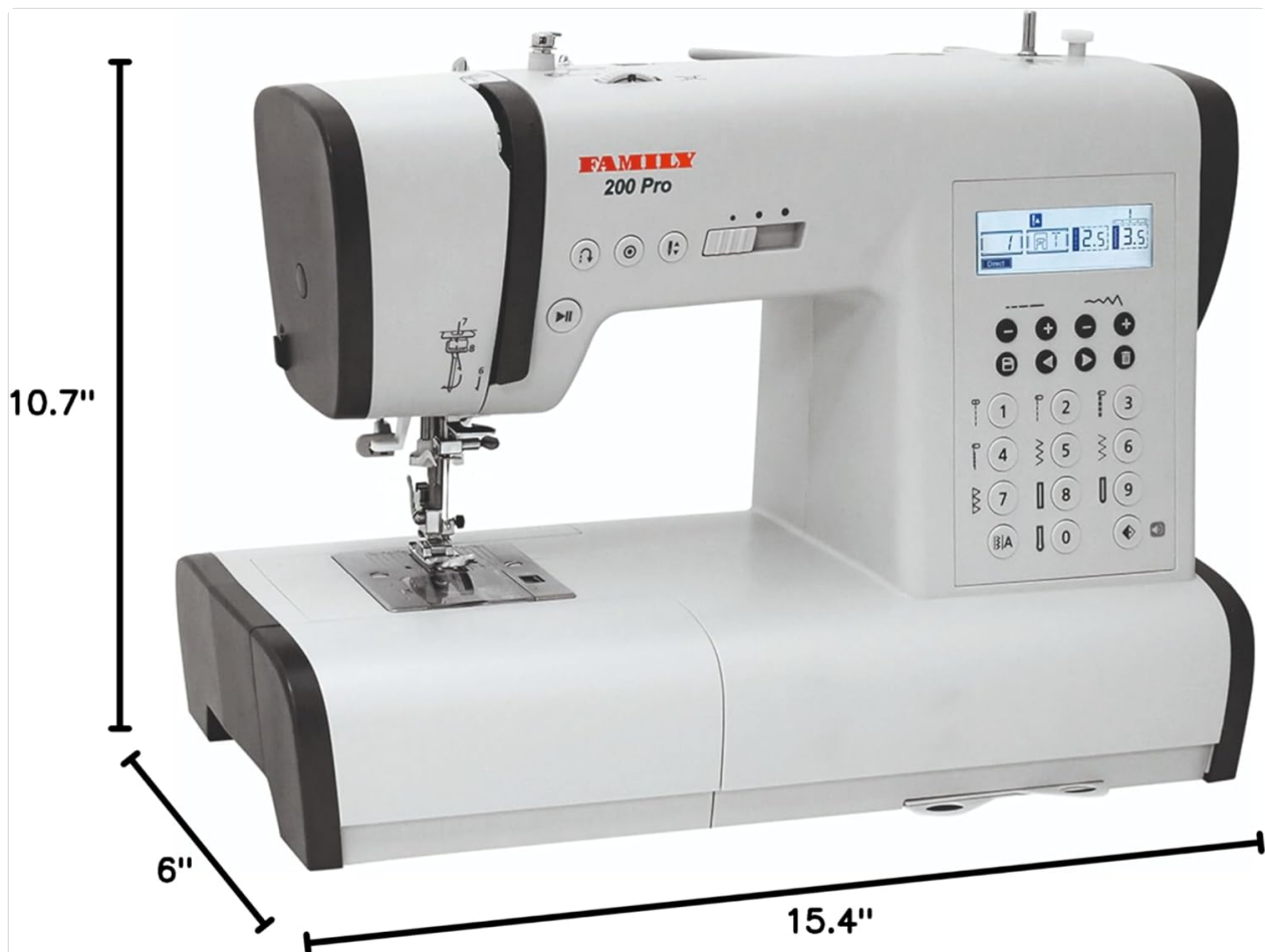
Image 8.1: Dimensions of the FAMILY 200 PRO Computerized Sewing Machine.