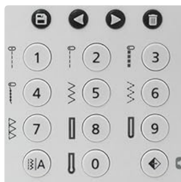
Image 5.4: Close-up of the control panel for selecting stitch styles by number.