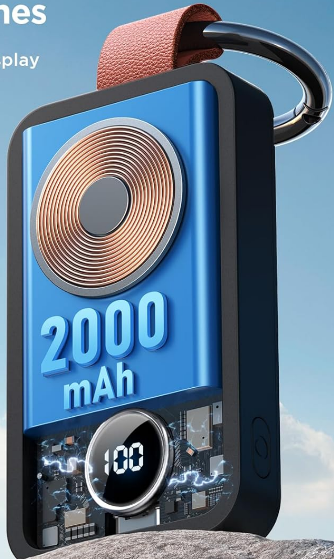
Image: An internal view diagram of the charger highlighting its 2000mAh battery and indicating the number of full charges it provides for different Apple Watch models.