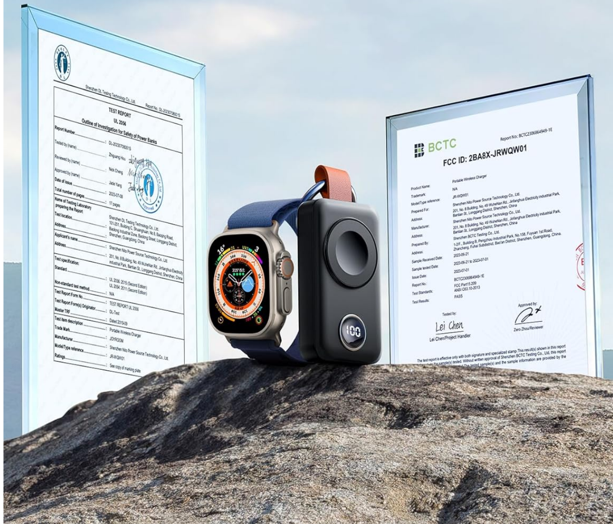
Image: Visual representation of the charger's safety certifications and protective features, including over-voltage, over-current, short-circuit, and over-temperature protection.