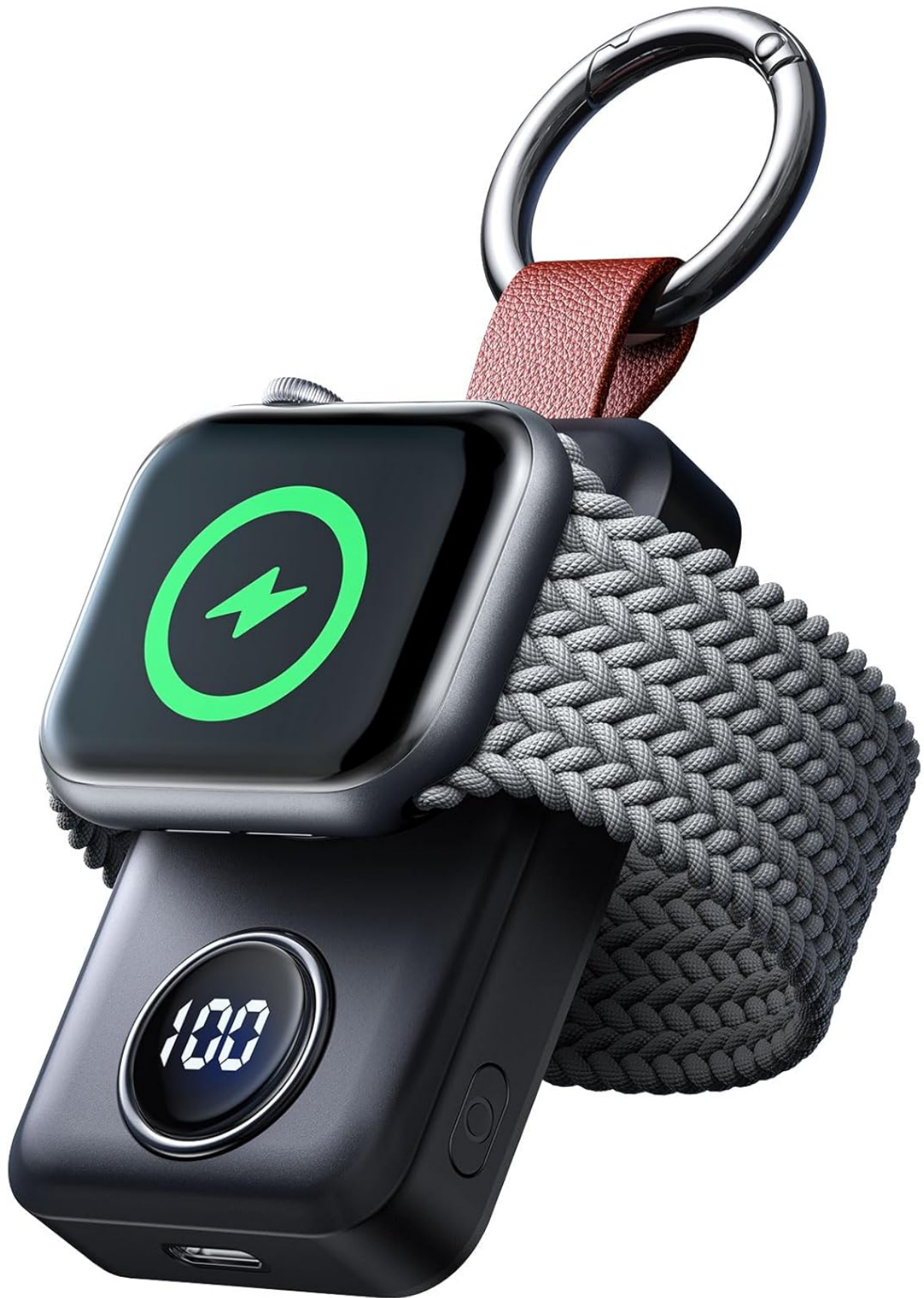
Image: The JOYROOM portable charger with an Apple Watch placed on its magnetic charging pad, indicating active charging.