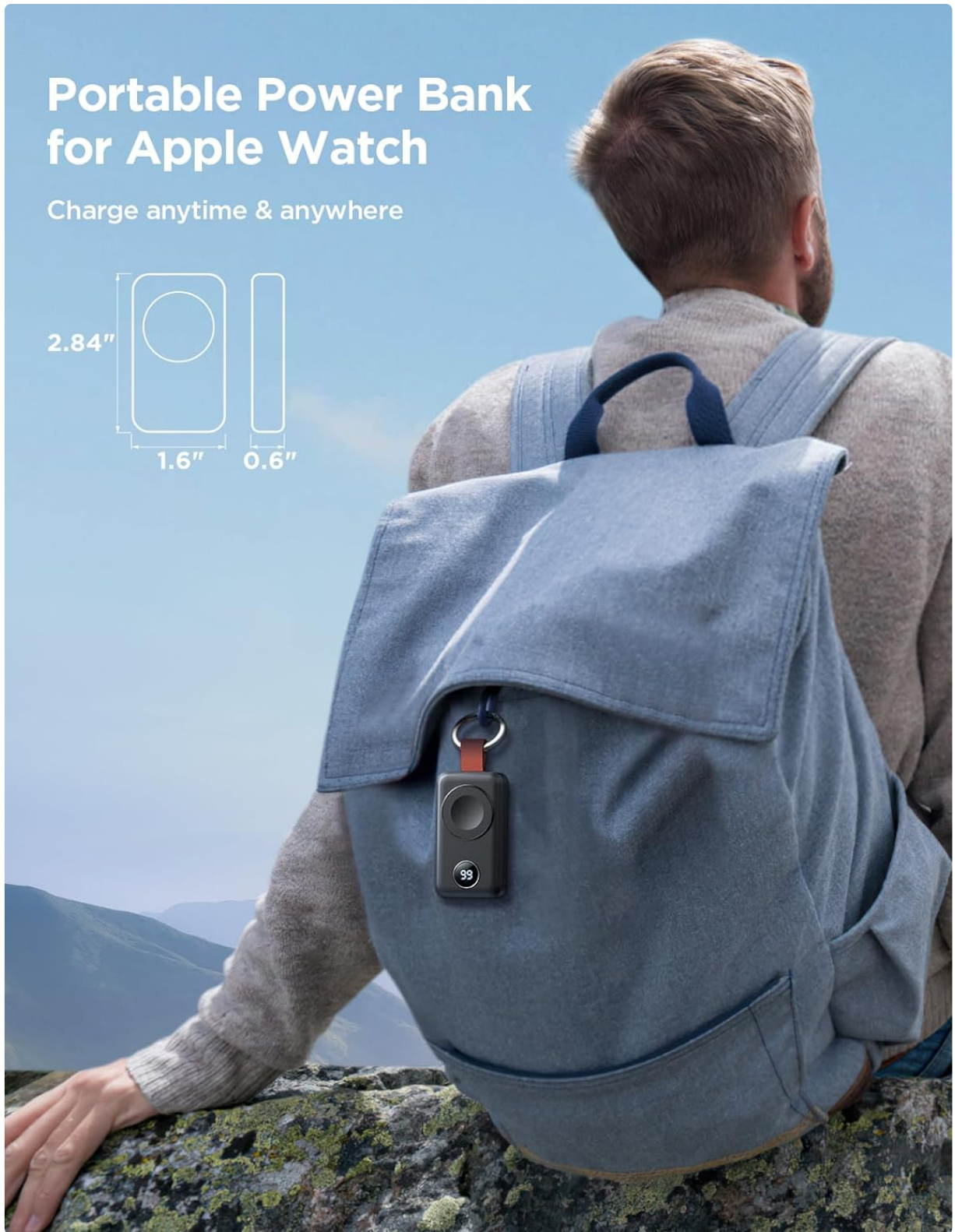
Image: The portable charger attached to a backpack via its keychain, demonstrating its convenience for travel and outdoor use.