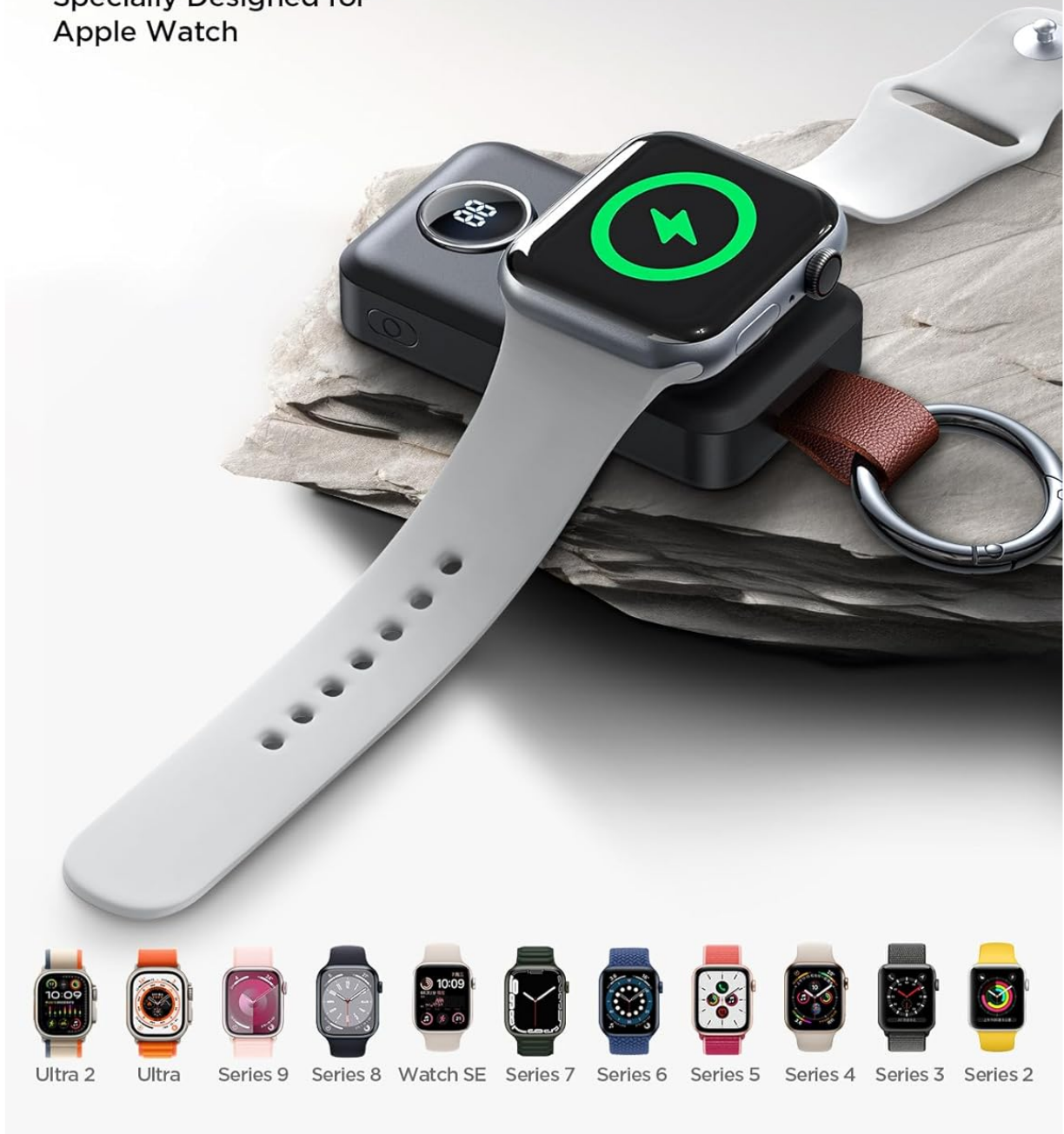
Image: A visual guide showing the wide range of Apple Watch models compatible with the charger.