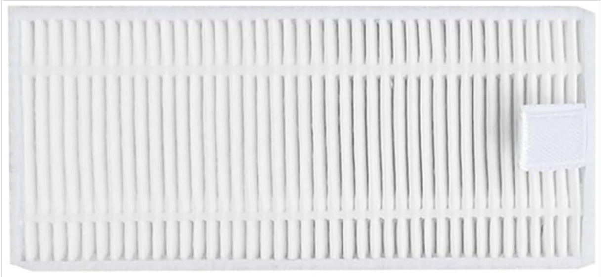
Figure 2: A single EtiliN Hepa filter, ready for installation.