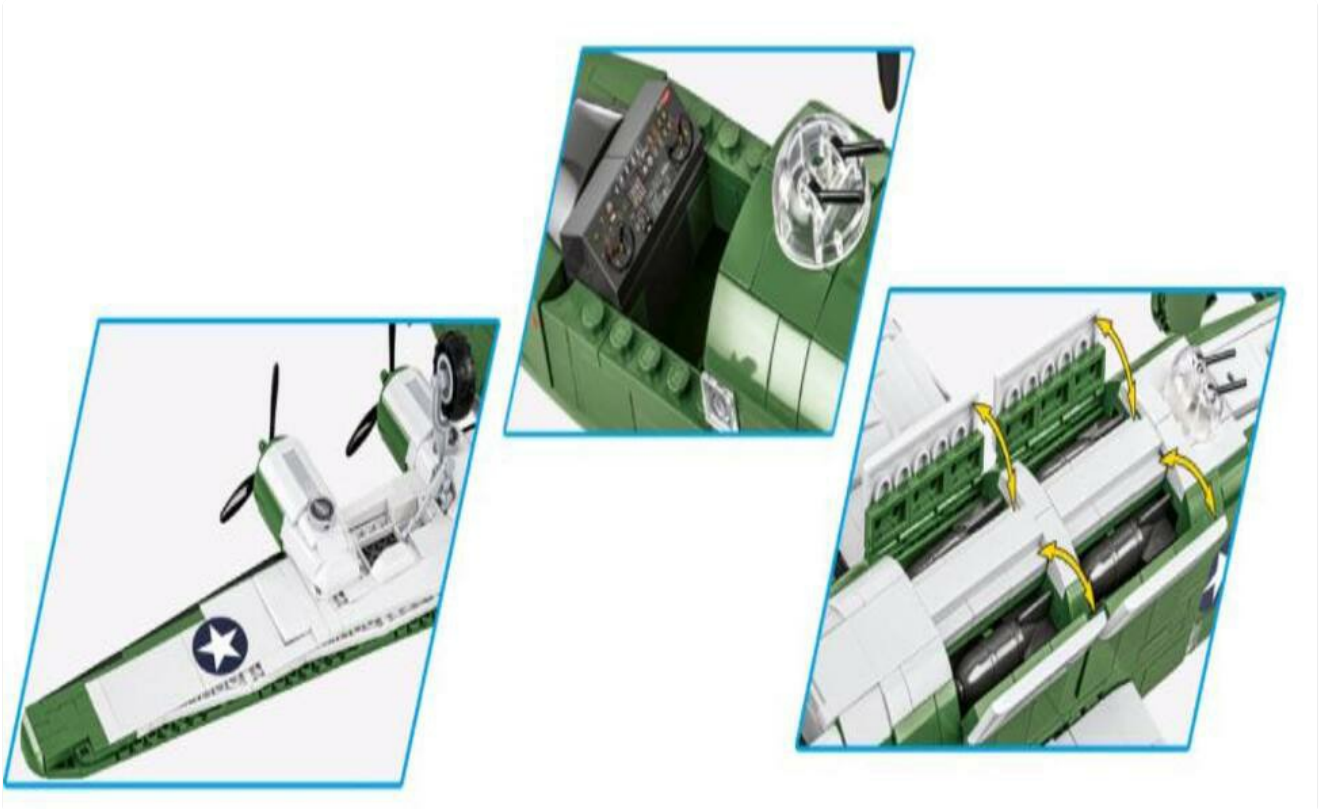
Image 4.1: Close-up views highlighting the detailed cockpit, functional bomb bay, and retractable landing gear of the model.