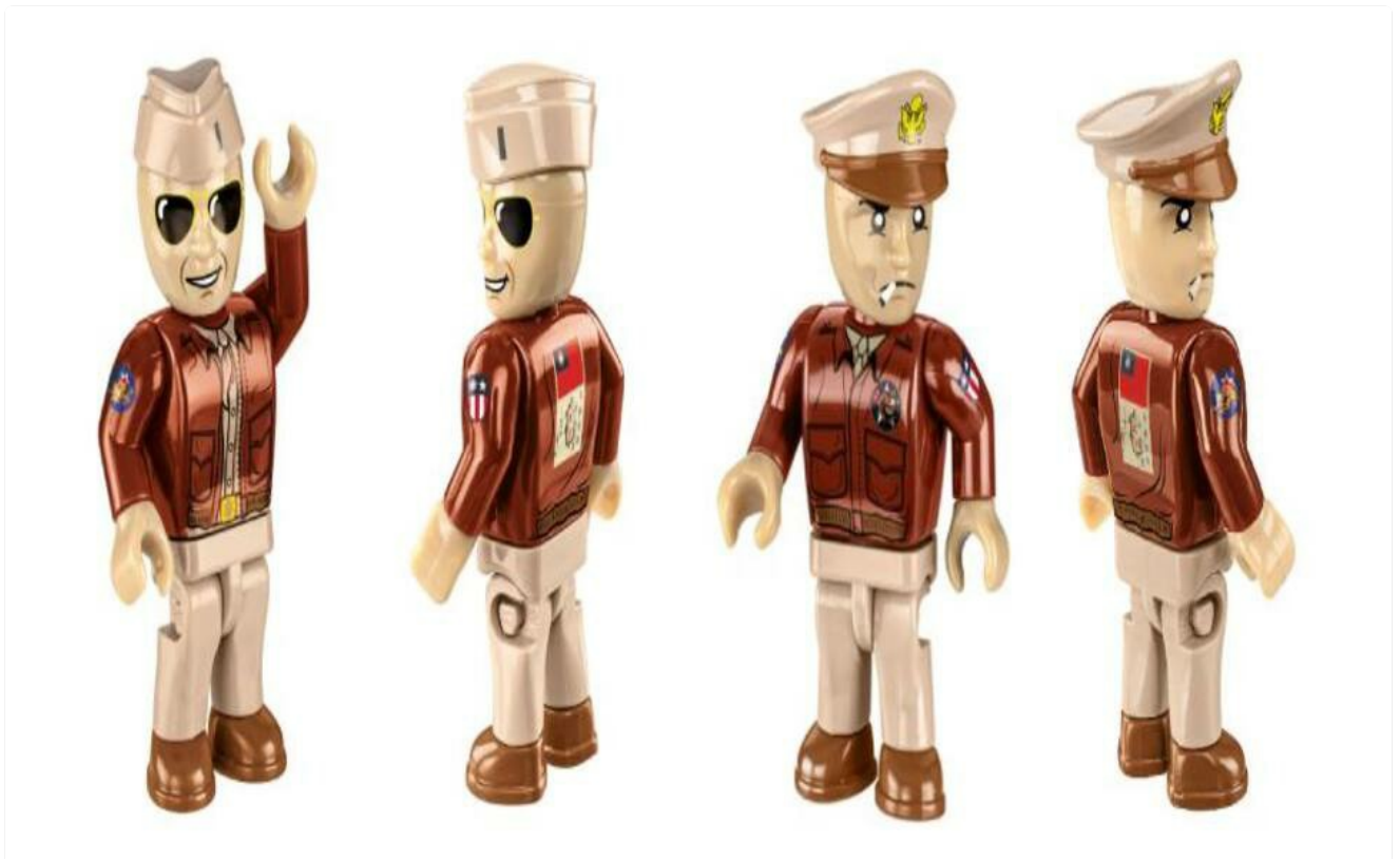
Image 5.2: The two detailed pilot figures included with the set, shown in different dynamic poses.