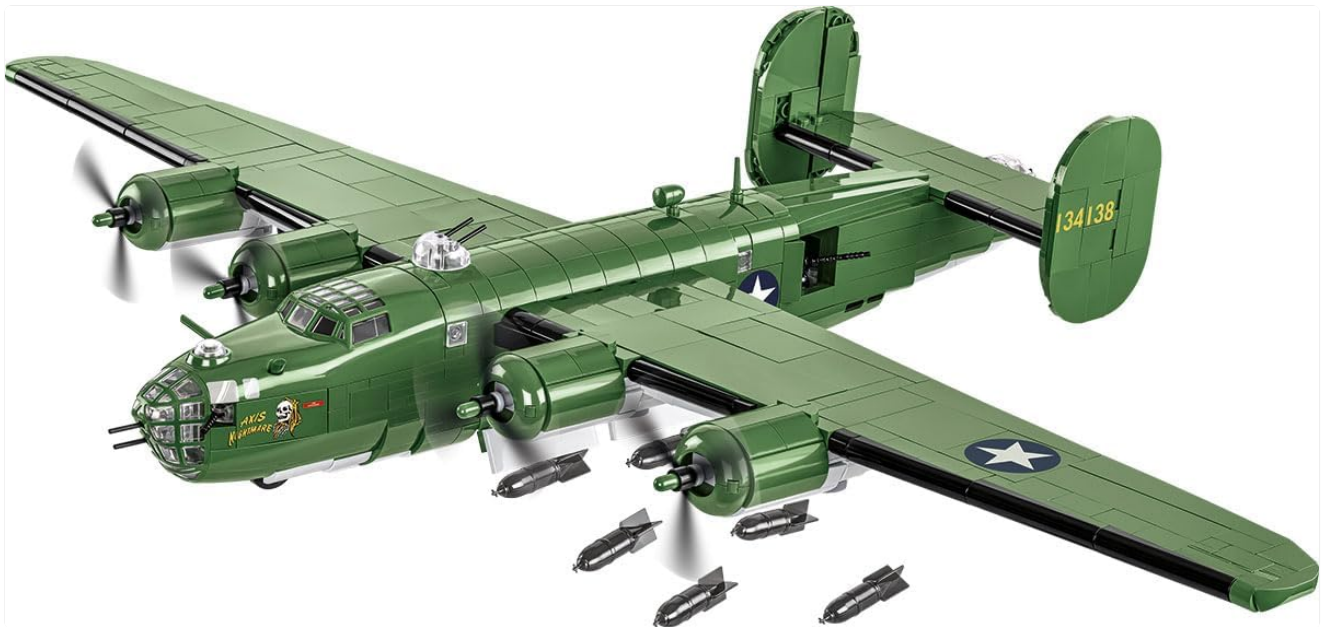
Image 5.1: The COBI B-24D Liberator model showcasing its bomb release feature, with several bomb replicas falling from the open bomb bay.