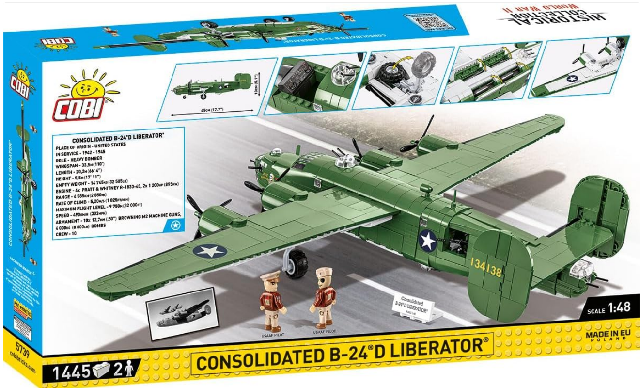
Image 1.2: The fully assembled COBI Consolidated B-24D Liberator model, presented with two accompanying pilot figures.