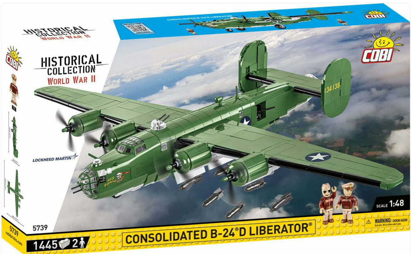
Image 1.1: Packaging of the COBI 5739 Consolidated B-24D Liberator building block set, showing the completed model and key

Thank you for choosing the COBI 5739 Consolidated B-24D Liberator building block set. This set allows you to construct a detailed 1:48 scale model of the iconic B-24D Liberator heavy bomber, consisting of 1445 high-quality building blocks and 2 figures. This manual provides essential information for assembly, operation, maintenance, and safety to ensure a rewarding building experience.