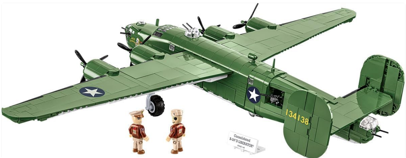
Image 8.1: Top-down view of the assembled model, indicating a wingspan of 68.5 cm (27 inches) and a length of 45 cm (17.7 inches).