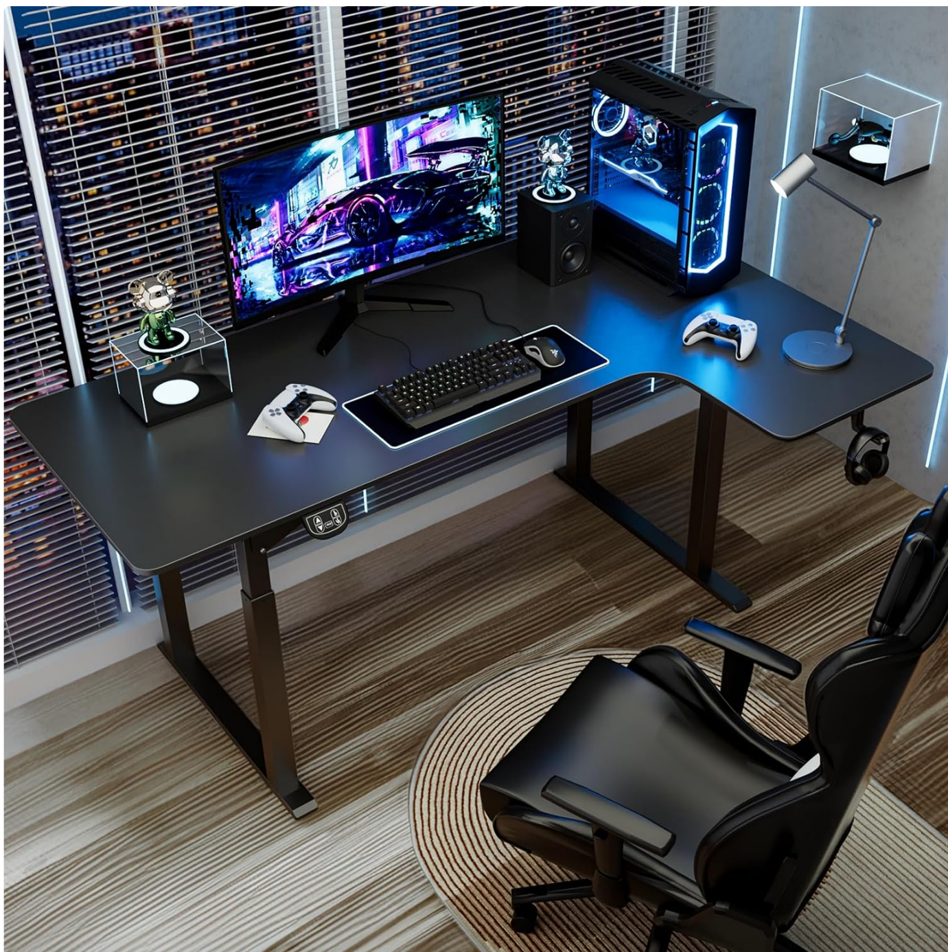
The spacious L-shaped design accommodates various setups, including gaming stations.