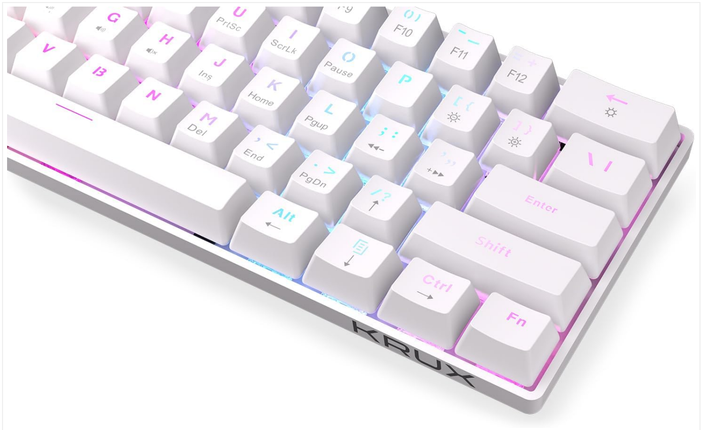
Figure 4.1: Close-up view of the KRUX Qara 60% keyboard keys, illustrating the RGB backlighting and secondary functions printed on the keycaps.