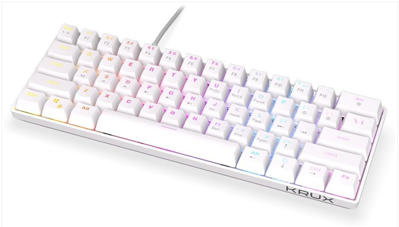
Figure 2.2: Angled view of the KRUX Qara 60% White Mechanical Keyboard, highlighting the white keycaps and the subtle RGB backlighting along the bottom edge.