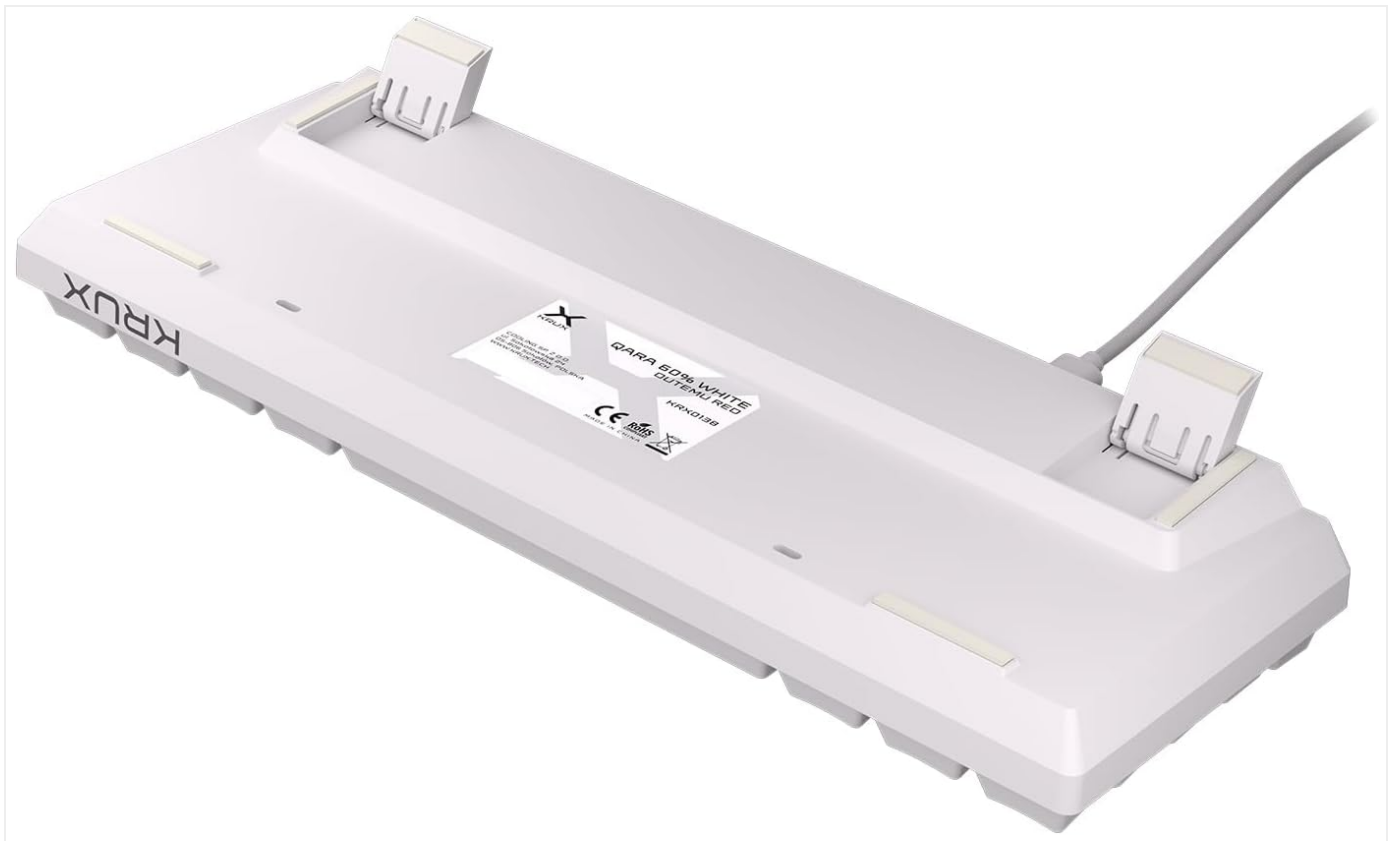
Figure 2.3: Rear view of the KRUX Qara 60% White Mechanical Keyboard, showing the product label with model number KRX0138 and adjustable feet.