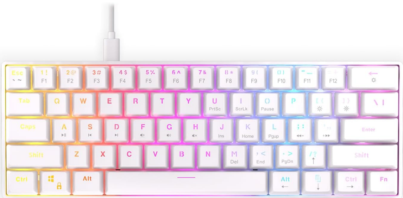
Figure 2.1: Top-down view of the KRUX Qara 60% White Mechanical Keyboard, showcasing its compact 60% layout and keycap arrangement.