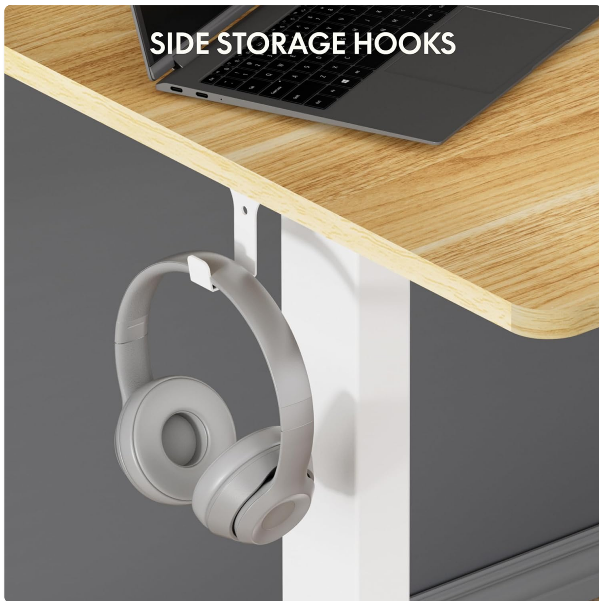
Figure 5: Convenient side storage hooks for accessories.