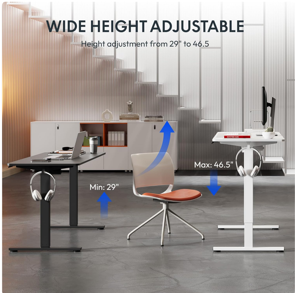
Figure 4: Desk height adjustment range from 29" to 46.5".