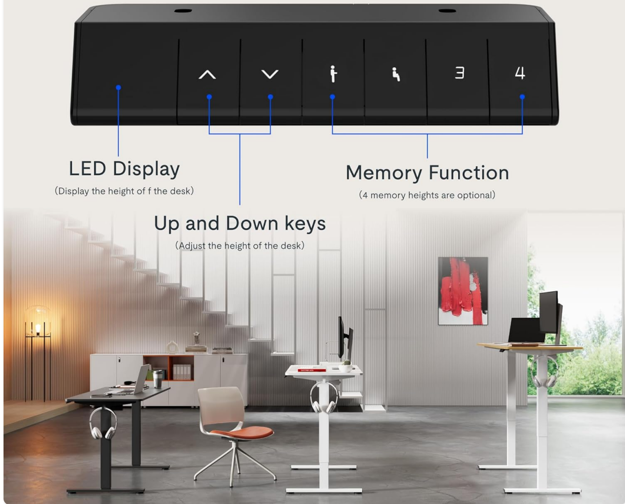
Figure 3: Multi-function keypad for desk operation.