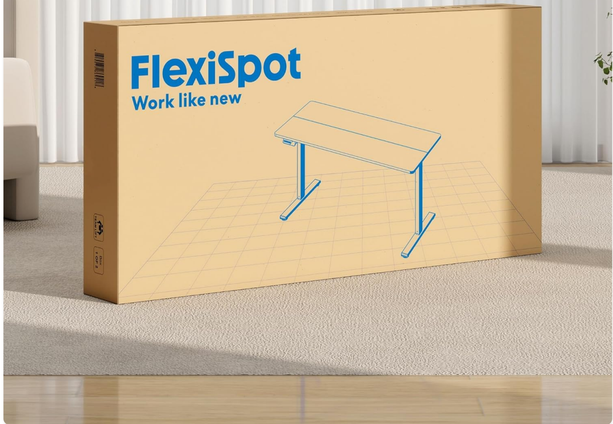
Figure 1: Product packaging indicating all components are included in one package.