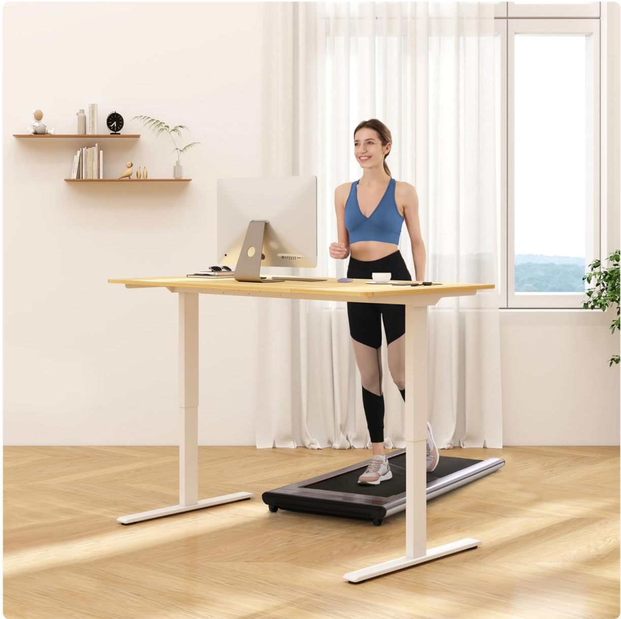
Figure 2: Fully assembled FLEXISPOT Standing Desk ready for use.