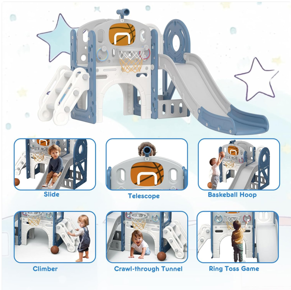
Image 5.1: A visual guide to the various play areas, including the slide, telescope, basketball hoop, climber, crawl-through tunnel, and ring toss game.