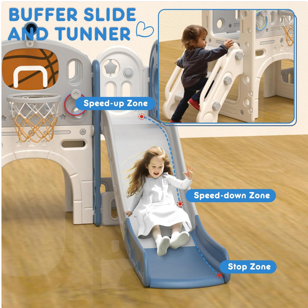
Image 4.1: Illustration of the slide's acceleration, deceleration, and stop zones, along with a child safely ascending the climber stairs.