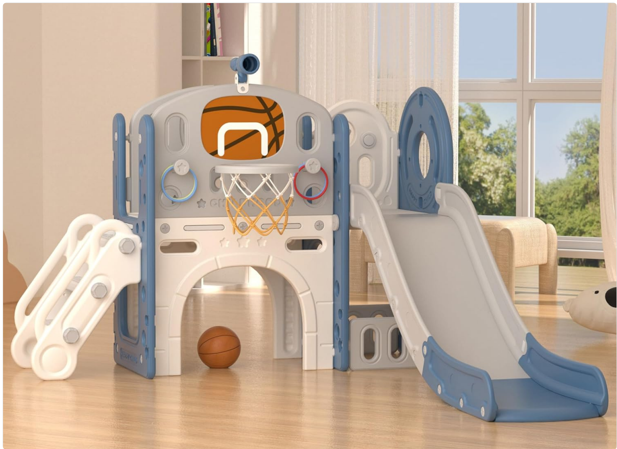
Image 1.1: The XJD 8-in-1 Toddler Slide Set, showcasing its various play elements in a home environment.