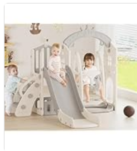
Image 4.2: Close-up view highlighting the engineered zones of the slide for a controlled and safe descent.