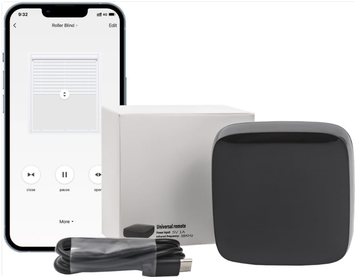
Figure 1: Sortfle AC520-02 RF Hub and accessories.