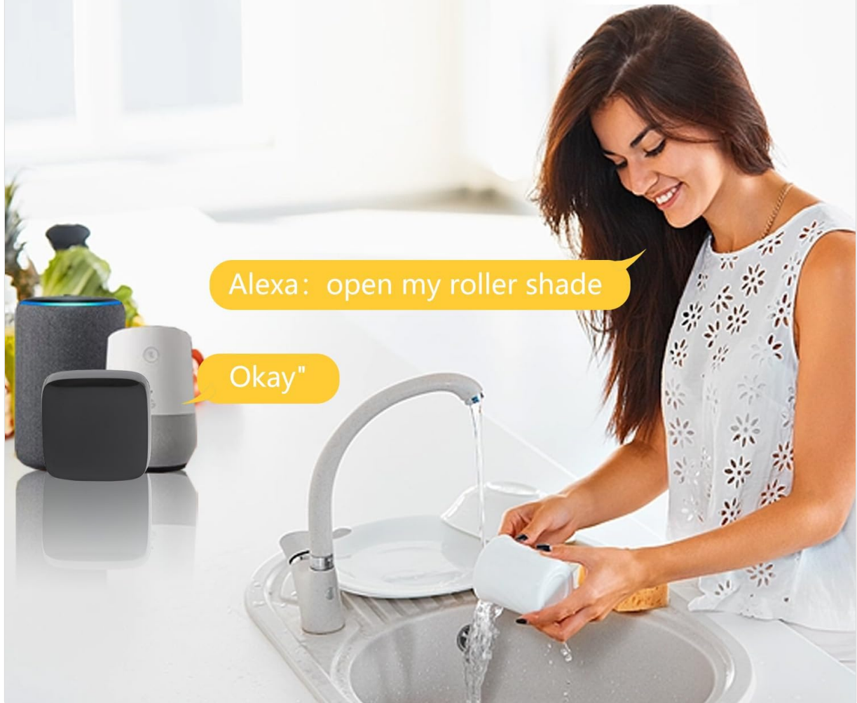
Figure 4: Easy Voice Control with smart assistants.