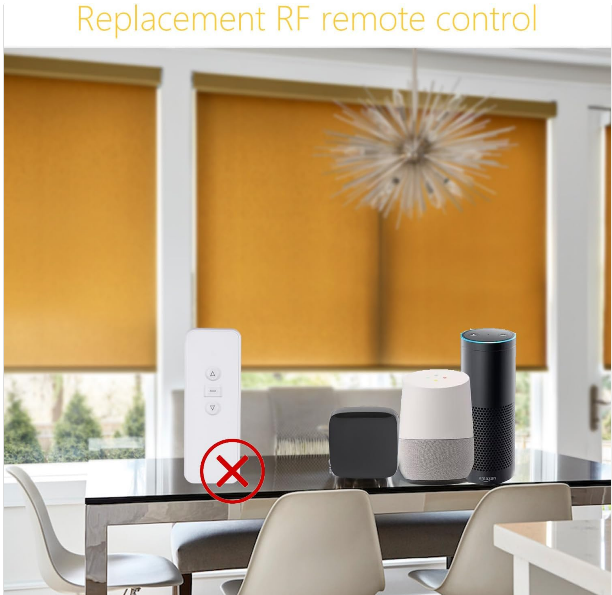
Figure 5: The RF Hub replaces traditional RF remote controls for smart integration.

Note: If your remote control is a different model, it may not be compatible. Please verify compatibility before purchase or contact customer support for assistance.