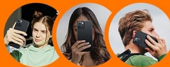
Figure 2: The case is designed to be ultra-thin, adding minimal bulk to your iPhone 15.