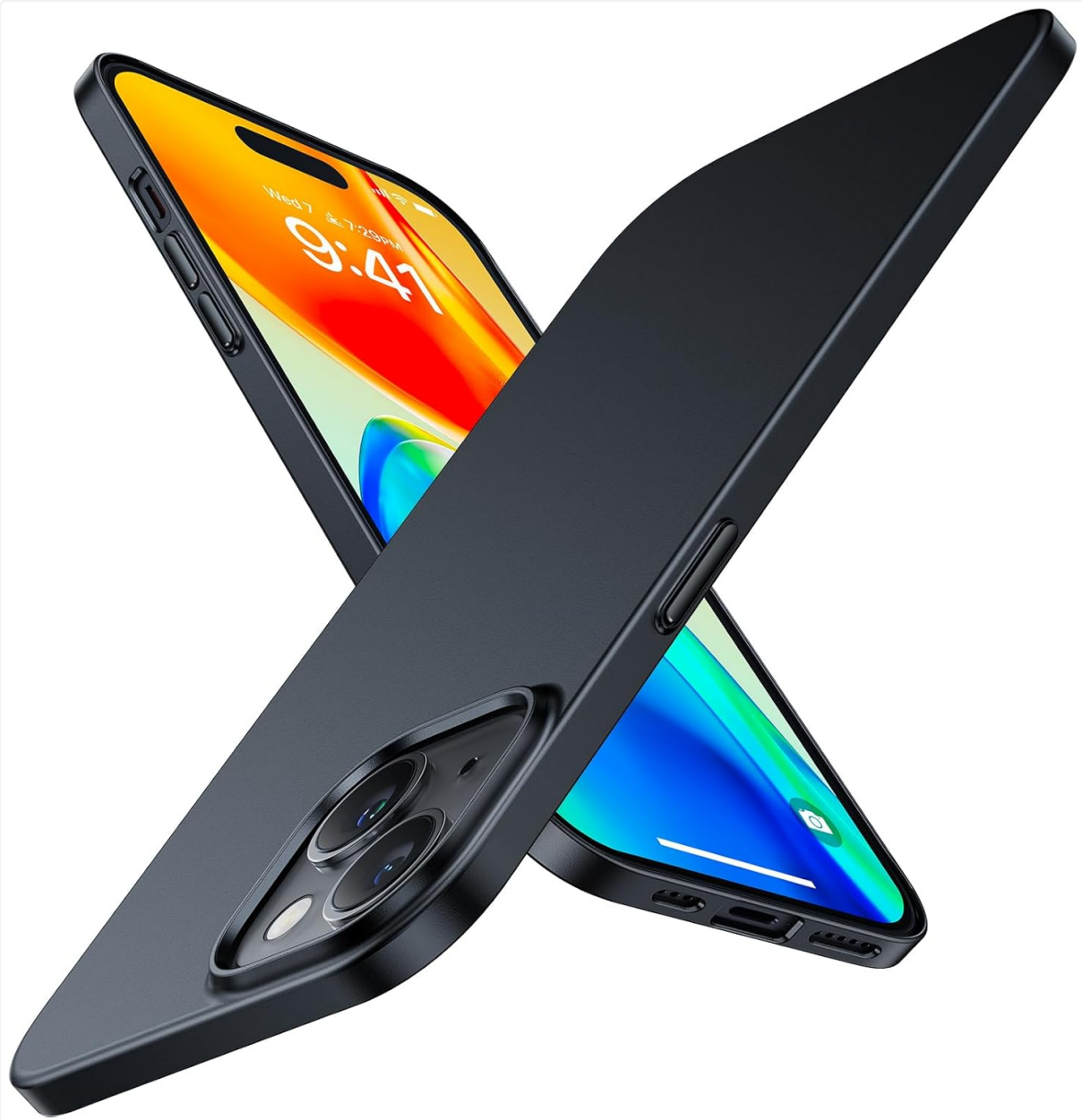
Figure 1: TORRAS Slim Fit Phone Case for iPhone 15.