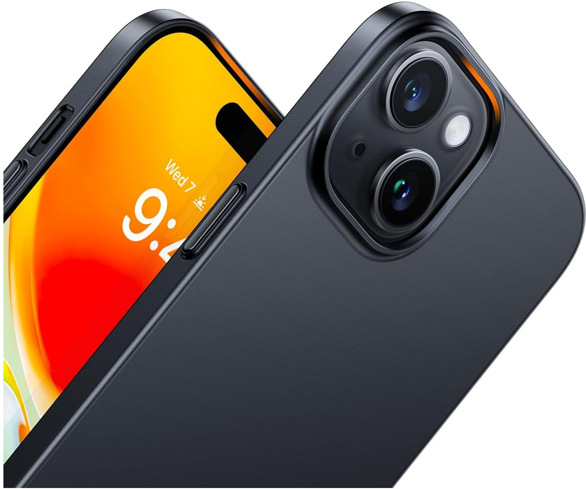
Figure 4: Detail of the raised edges protecting the screen and camera.

Your browser does not support the video tag.