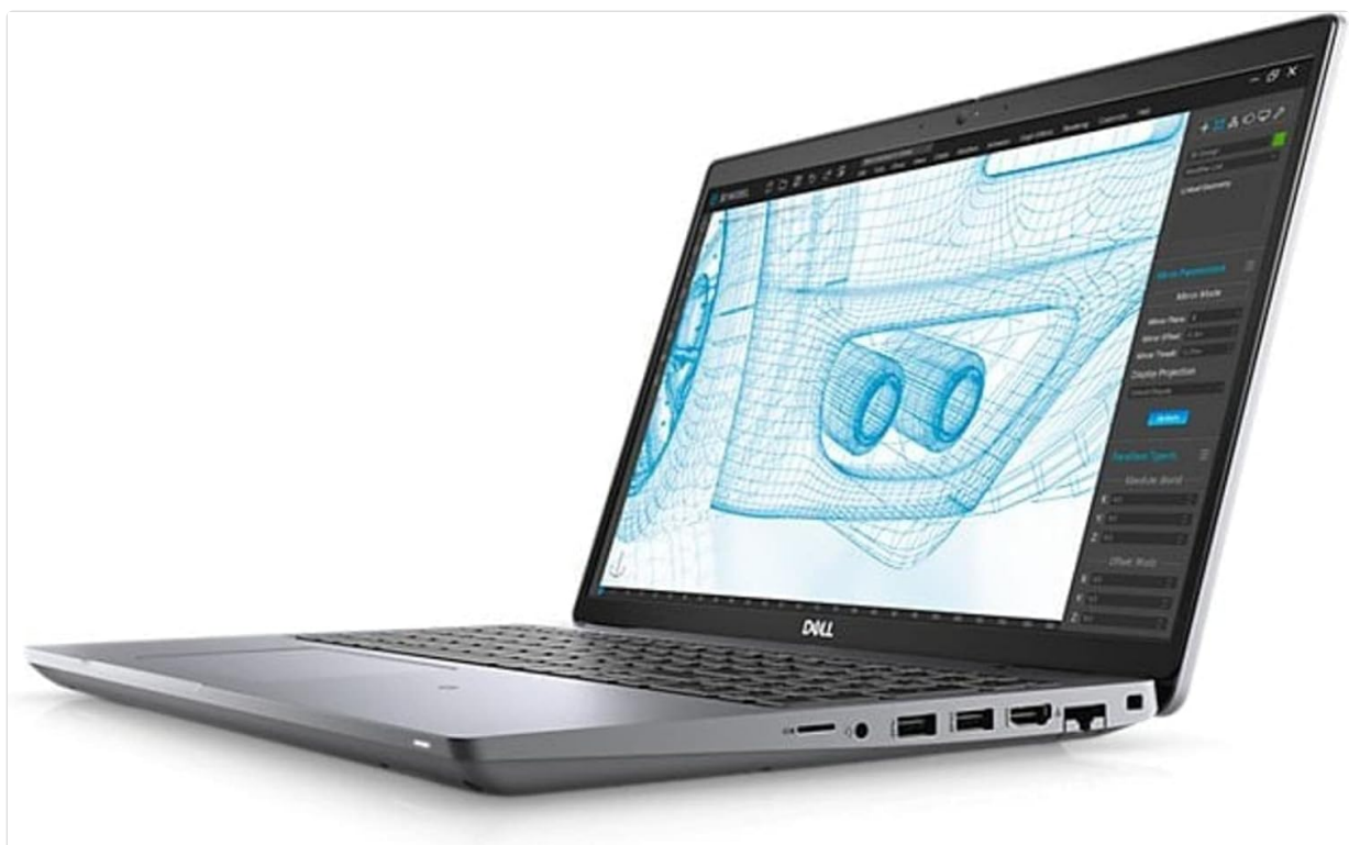
Image: Laptop Displaying CAD Software