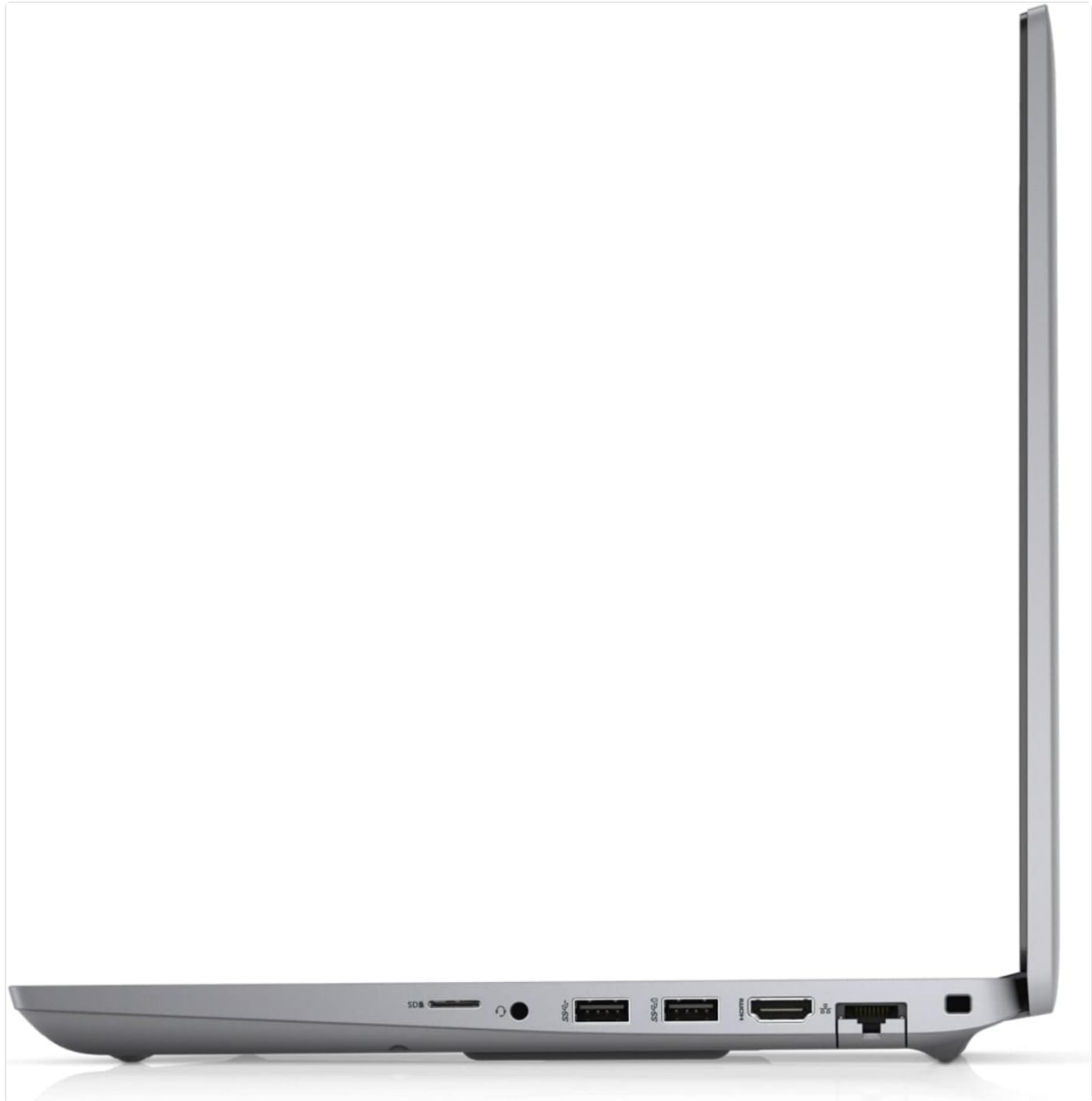
Image: Left Side Ports

The Dell Precision 3561 features various ports for connectivity. Familiarize yourself with their locations for connecting peripherals.