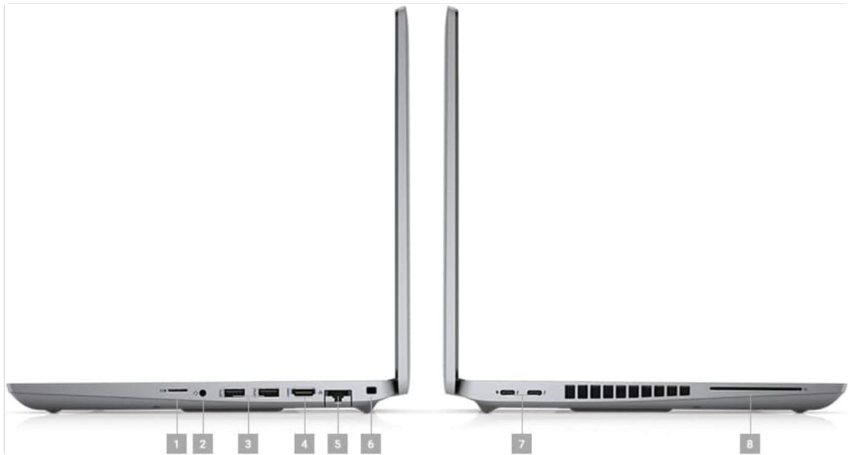
Image: Right Side Ports

This image shows the right side of the Dell Precision 3561 laptop. Key ports visible here include two Thunderbolt 4 USB-C ports with power-in capabilities, and a smart card reader slot (if configured).