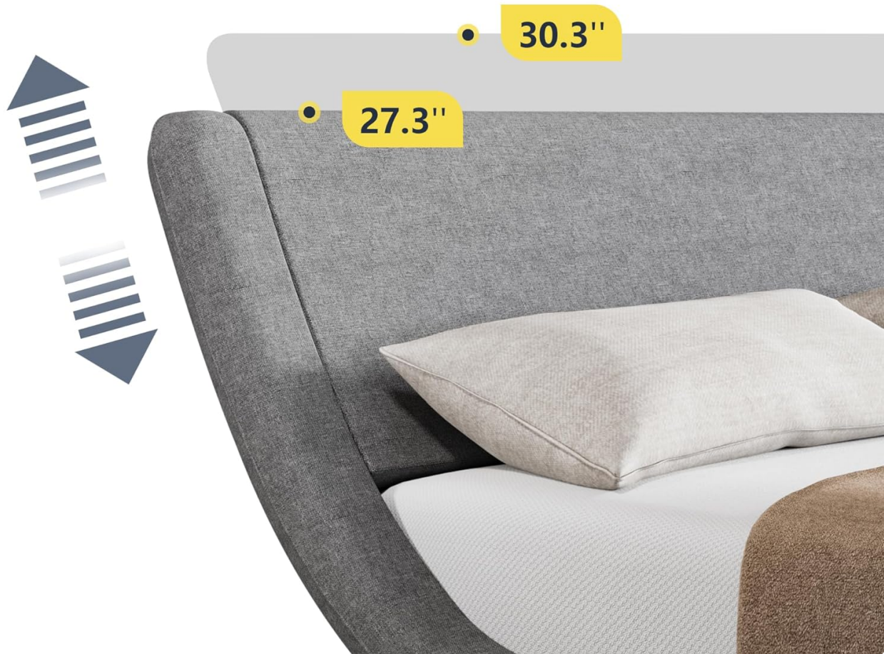
Image: Close-up view of the adjustable headboard, indicating height options between 27.3 inches and 30.3 inches to accommodate different mattress thicknesses.