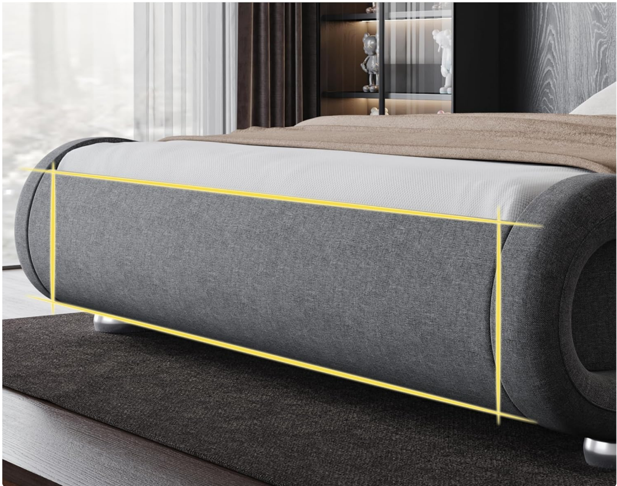
Image: Highlighted section of the bed frame demonstrating the thick, safety-upholstered edges for enhanced protection.