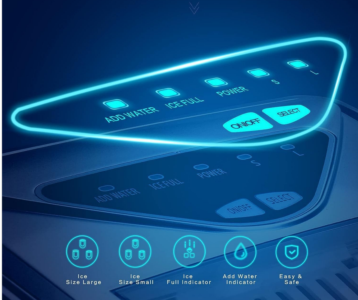
Figure 2.1: Touch-sensitive control panel for operating the ice maker.