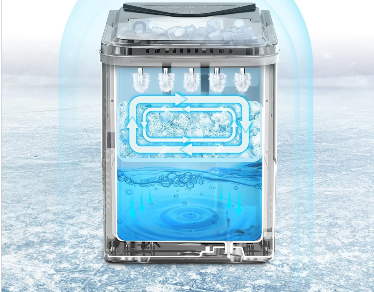
Figure 3.1: Automatic self-cleaning in progress.

Press ON/OFF button for 5 seconds to enter self-cleaning progress