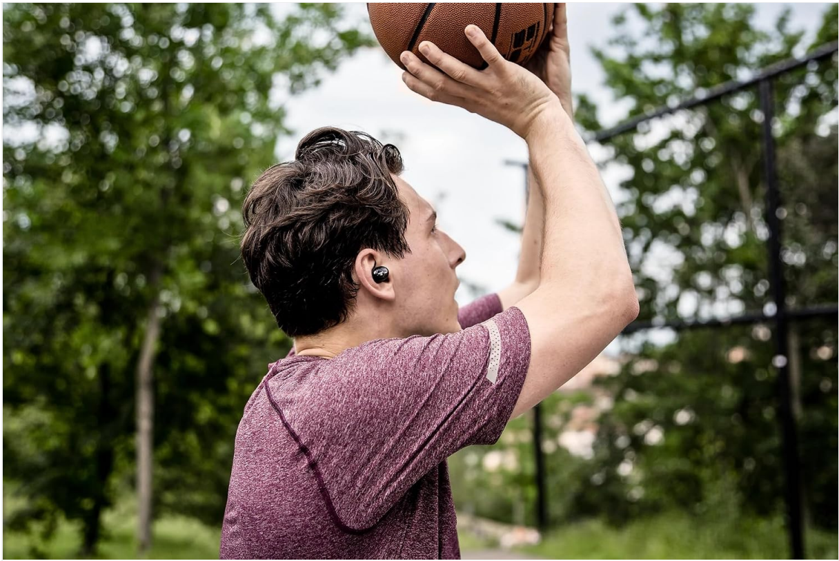
Image: A person wearing the Philips SHB2515WT earbuds while engaged in a basketball activity, demonstrating their secure fit during movement.