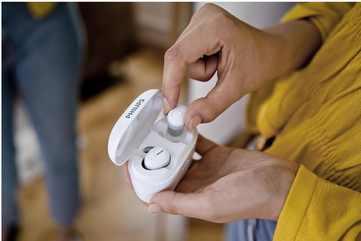
Image: A person's hands carefully placing one of the Philips SHB2515WT earbuds into its designated slot within the charging case.