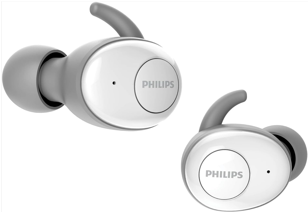
Image: The Philips SHB2515WT wireless in-ear earbuds, showing their compact design and integrated ear wings for a secure fit.