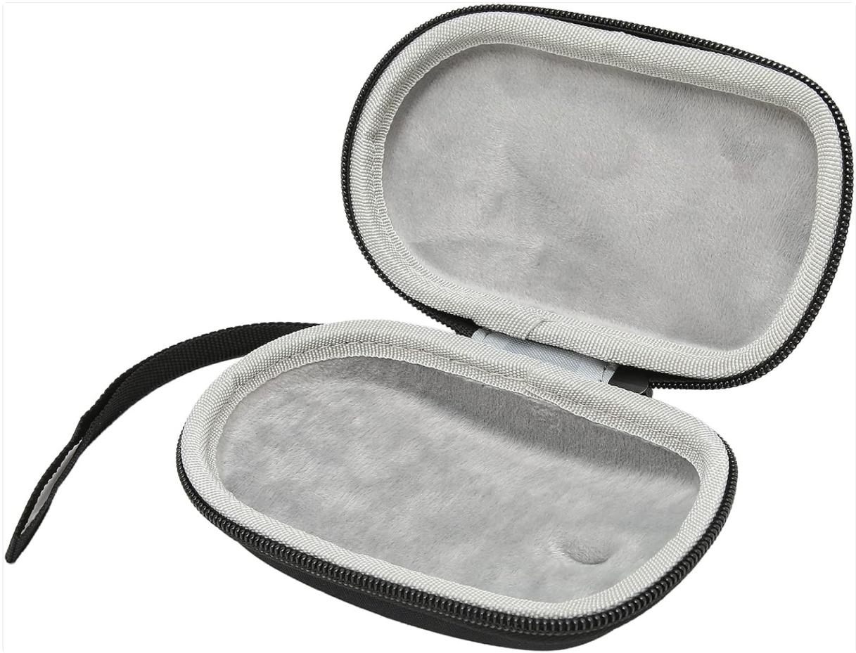
Image: The interior of the Zopsc mouse case, showing the soft lining and the recessed area designed to hold a mouse securely.