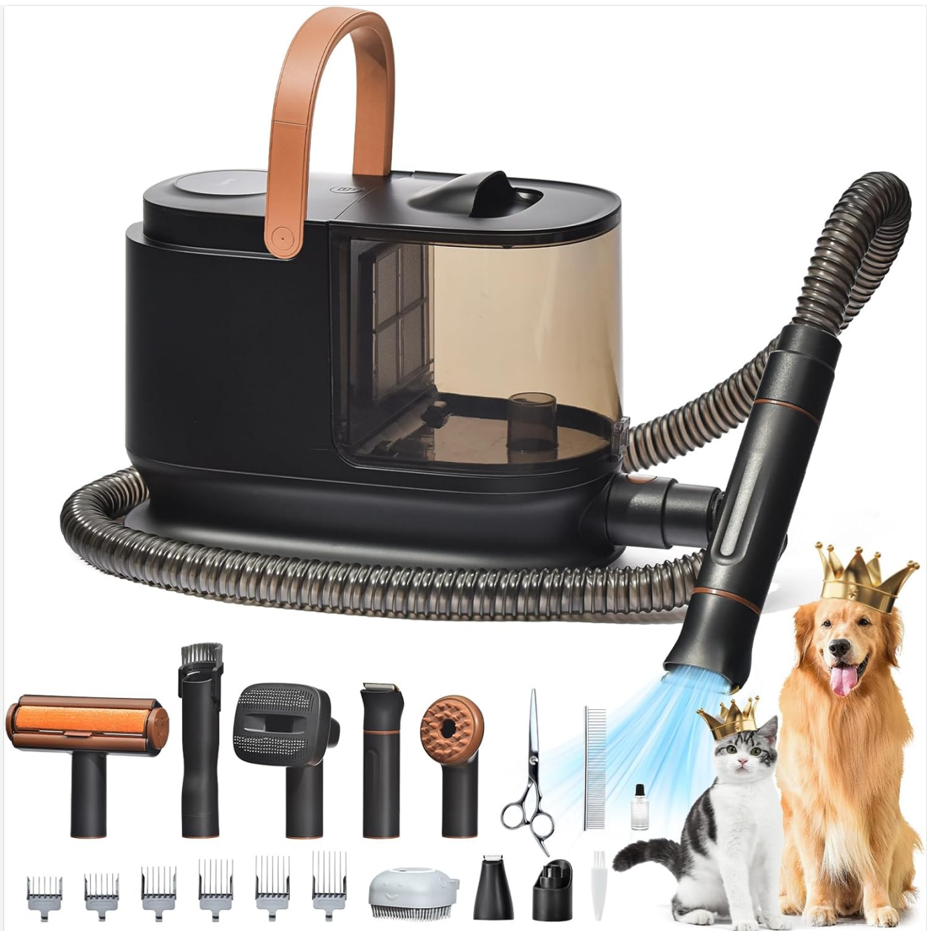
Image 1.1: Overview of the Bunfly Dog Hair Vacuum Grooming Kit and its included accessories.