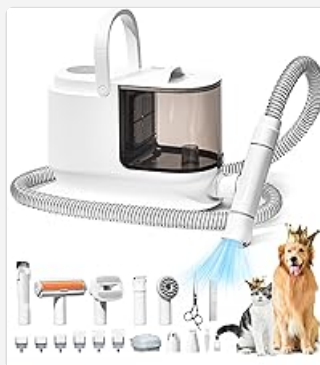
Image 4.4: The crevice tool in brush head mode for effective cleaning of tight spaces.