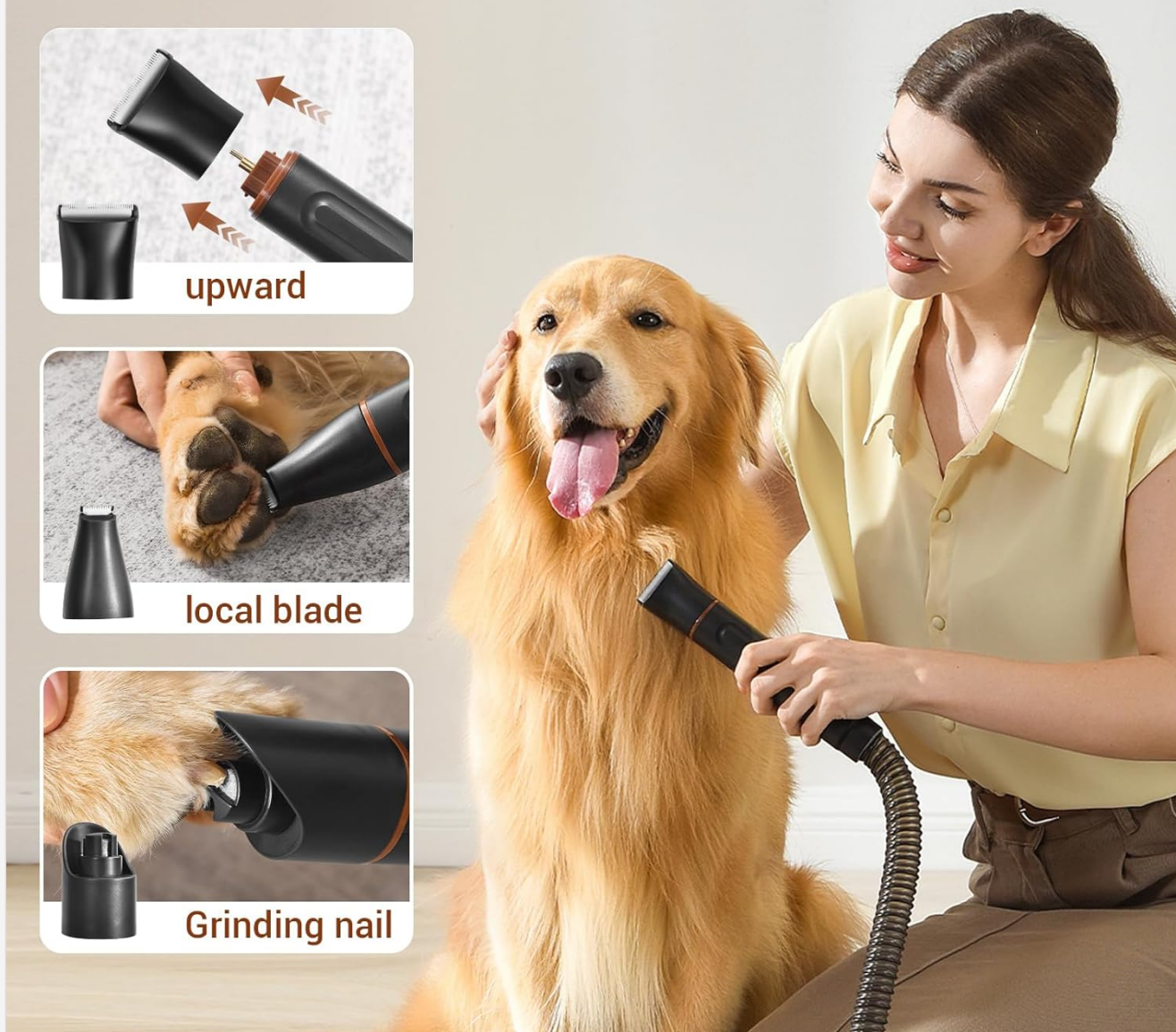
Image 4.2: Demonstrating the replaceable accessory heads for specialized grooming tasks.