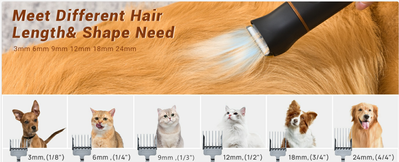
Image 1.2: Detailed view of the 16-in-1 multi-functional pet grooming tools.