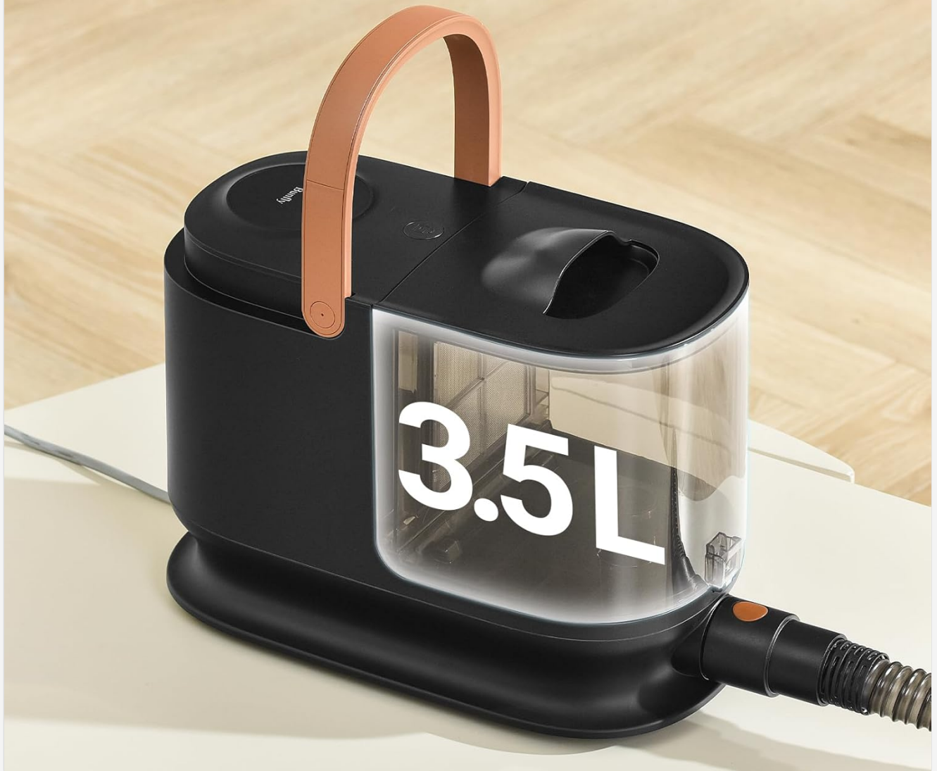
Image 5.1: The 3.5L large-capacity dust cup minimizes emptying frequency.

Wind repeatedly circulate to compress hair, 3.5L Large-capacity Collecting Bin for One-time & No-touch Emptying