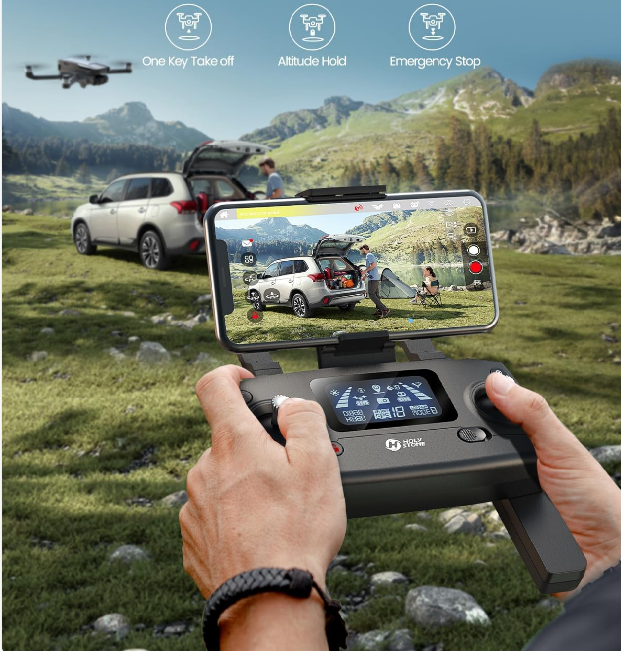
Figure 3.3: The remote controller with a smartphone mounted, illustrating the user-friendly interface for beginners.