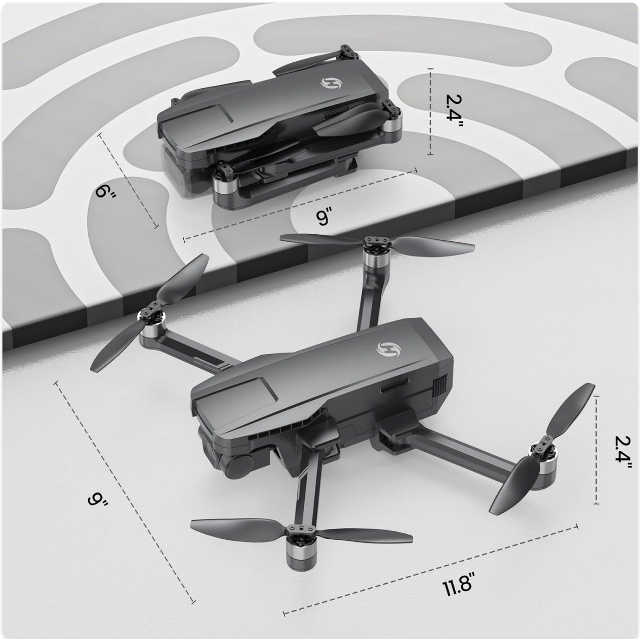
Figure 3.1: The Holy Stone HS720G drone in its unfolded state, ready for flight, showing its compact folded size and extended flight dimensions.