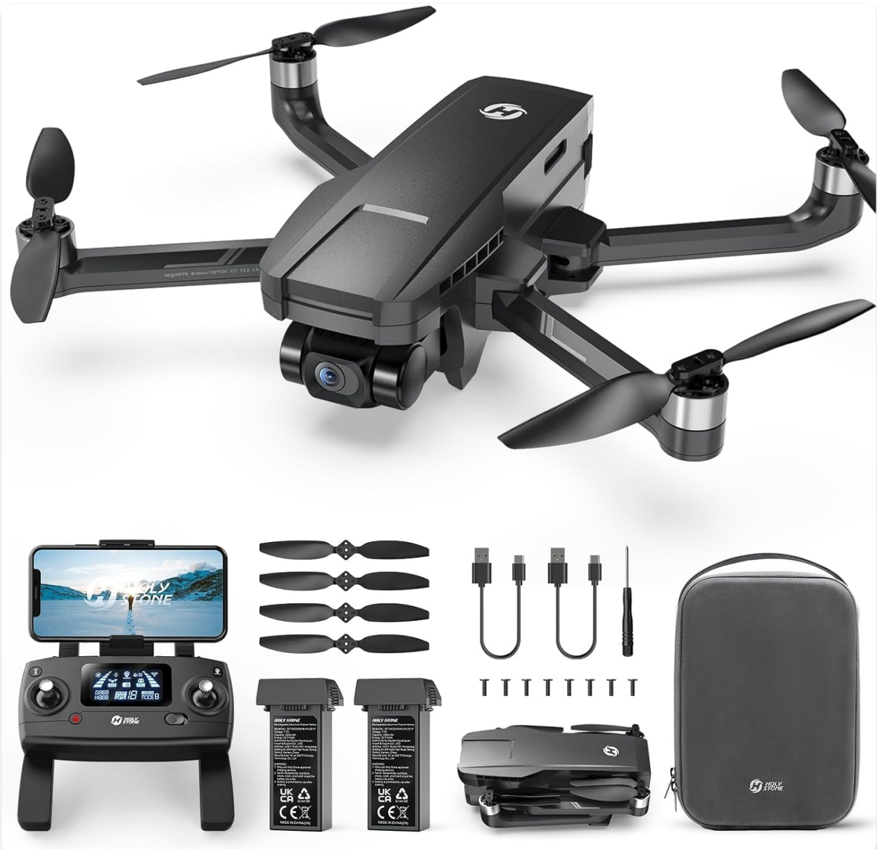
Figure 2.1: Holy Stone HS720G Drone and its complete set of accessories, including the remote controller, batteries, and spare parts.