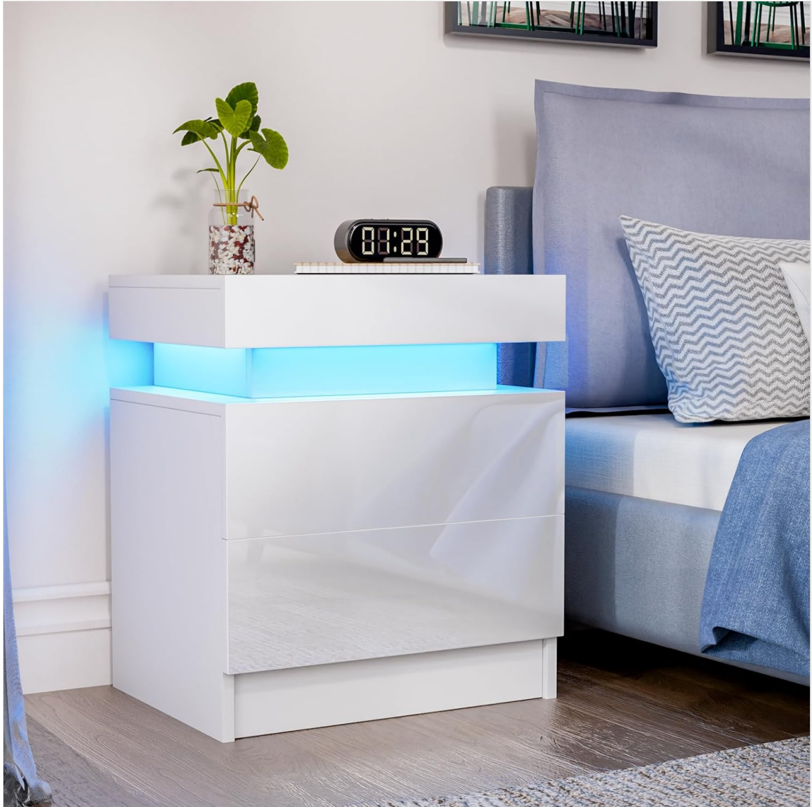
Image: The two drawers of the nightstand, demonstrating their storage capacity.

Important: Refer to the detailed diagrams in your physical instruction manual for specific part identification and screw placement.