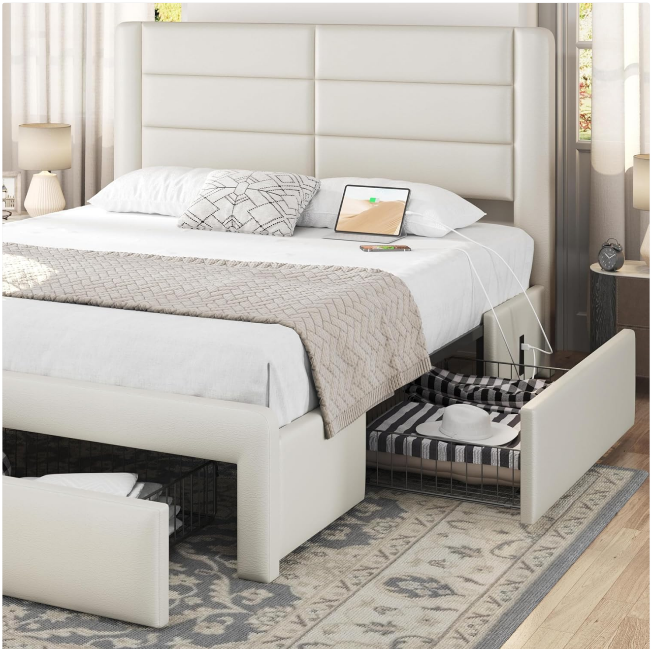
Image: The bed frame with its three storage drawers extended, showcasing the ample space available for bedding and other items.