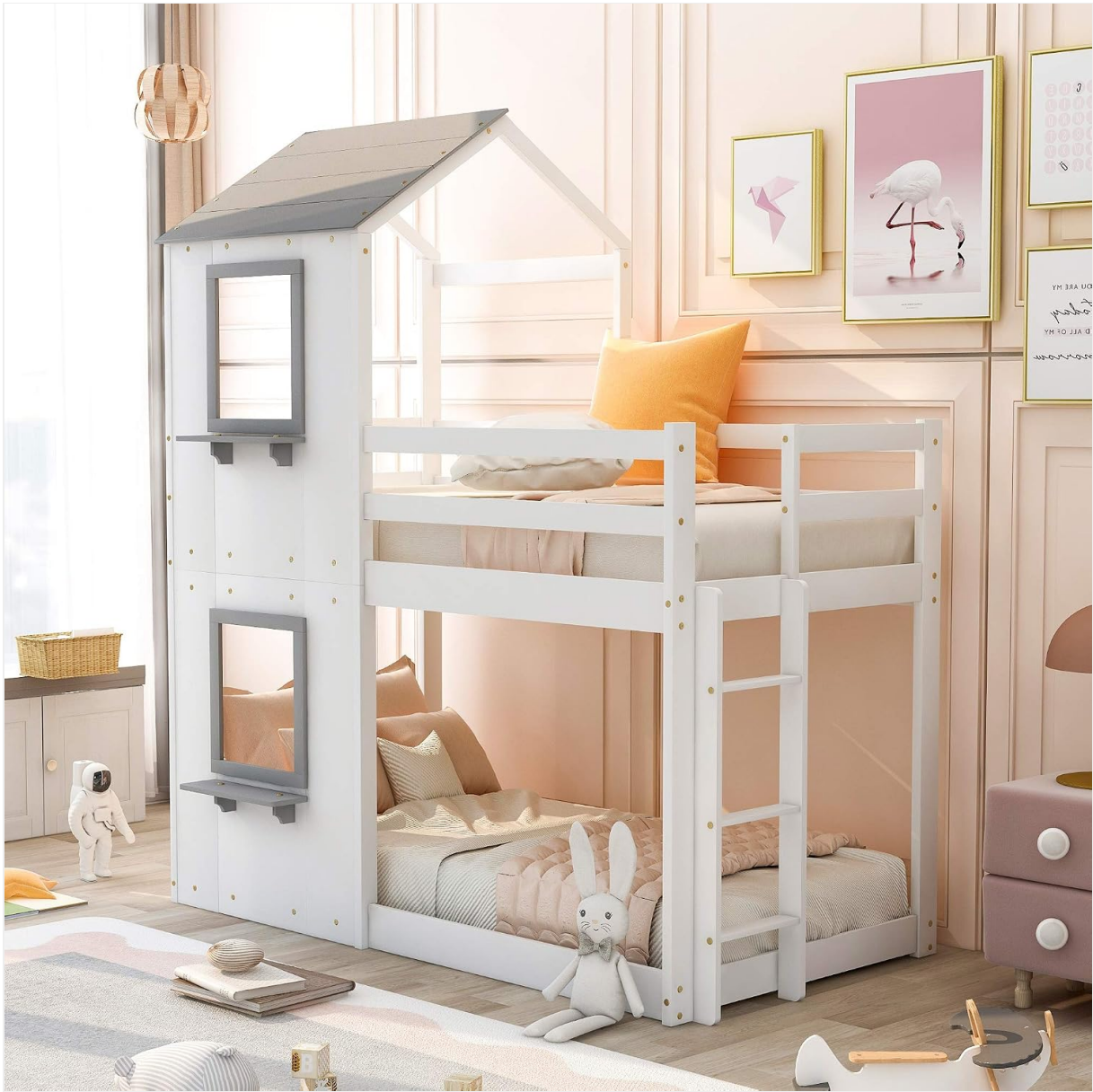
Image: The Bellemave Twin Over Twin House Bunk Bed, white finish, shown in a bedroom setting. It features a house-shaped structure with a roof and window cutouts on the left side, and a standard bunk bed frame on the right with a ladder.