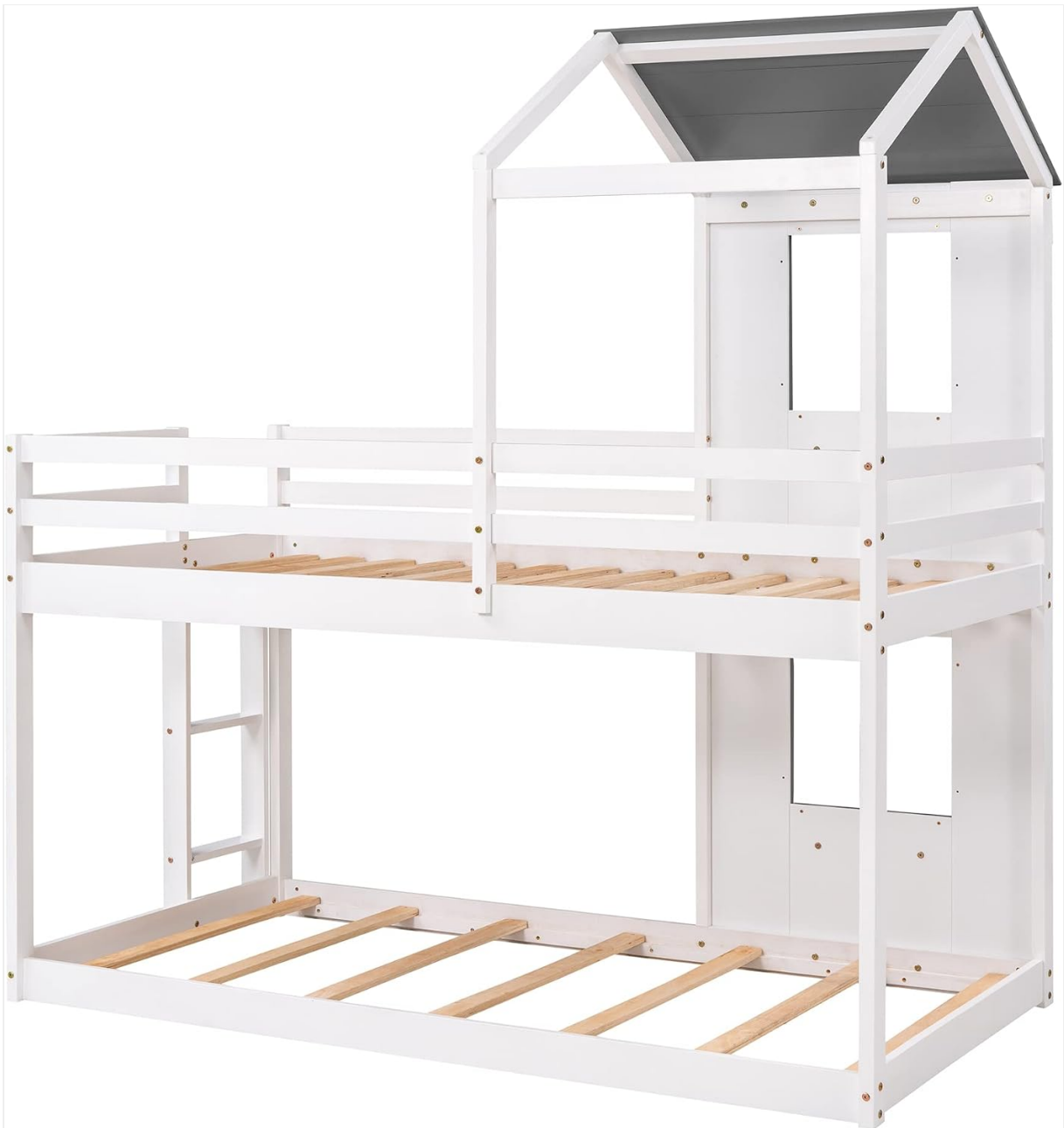
Image: A rear-angled view of the Bellemave Twin Over Twin House Bunk Bed, highlighting the integrated ladder on the right side and the slatted bed bases for both the upper and lower bunks. The house structure is visible on the left.