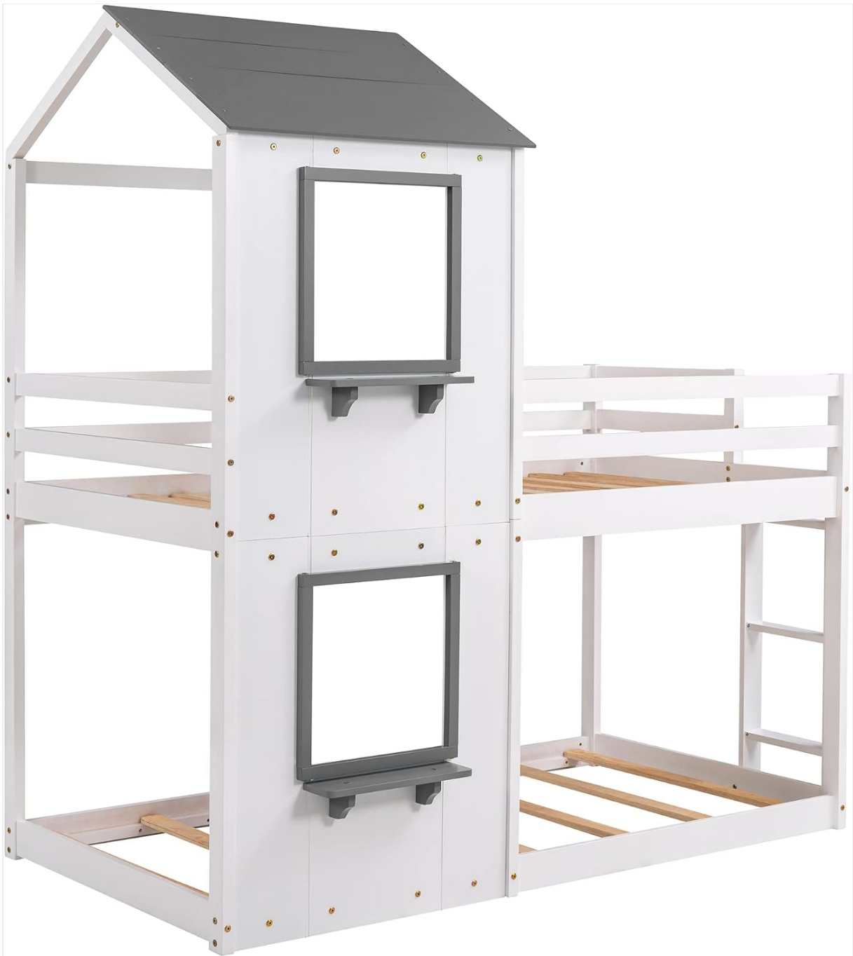
Image: A front-angled view of the Bellemave Twin Over Twin House Bunk Bed, showcasing the two bunks and the house-shaped side panel with two window cutouts. The guardrails on the upper bunk are clearly visible.