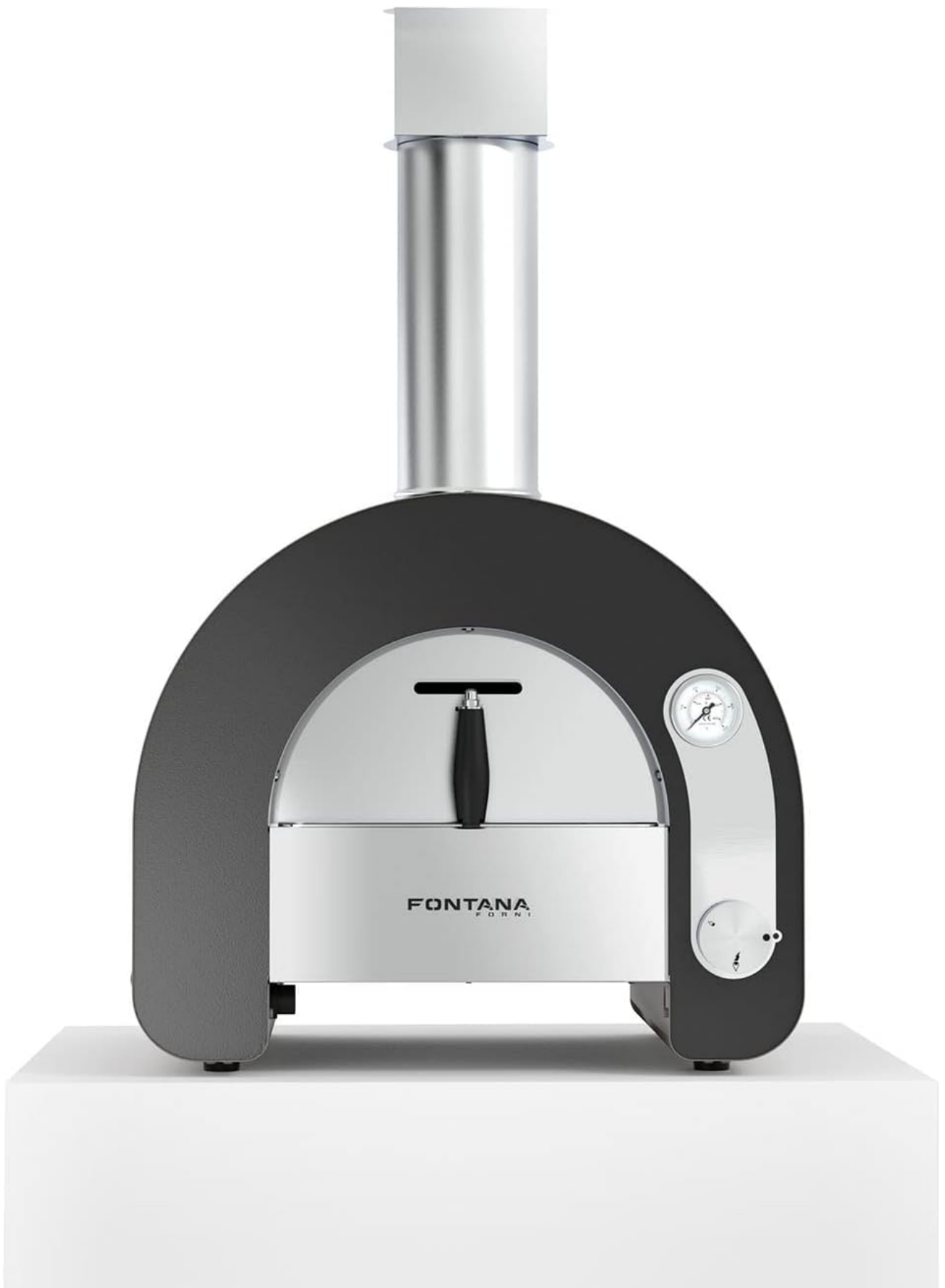
Figure 1: The Fontana Forni Maestro 40 Outdoor Pizza Oven.