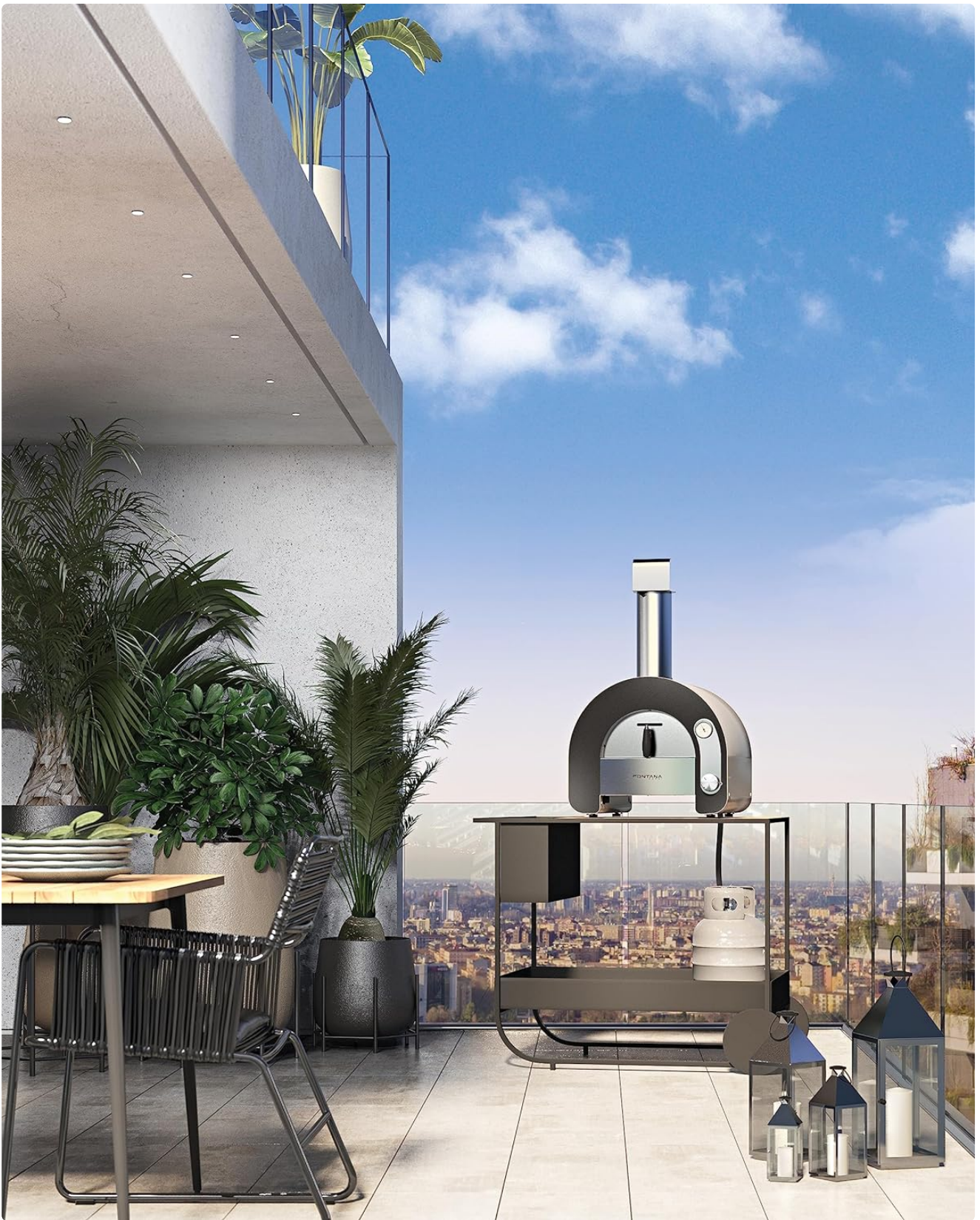
Figure 2: Proper outdoor placement of the Maestro 40 oven.