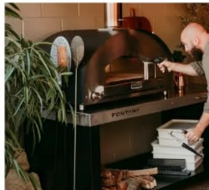
Figure 3: The Maestro 40 features rock wool insulation for efficient heat retention and a safe-to-touch exterior.