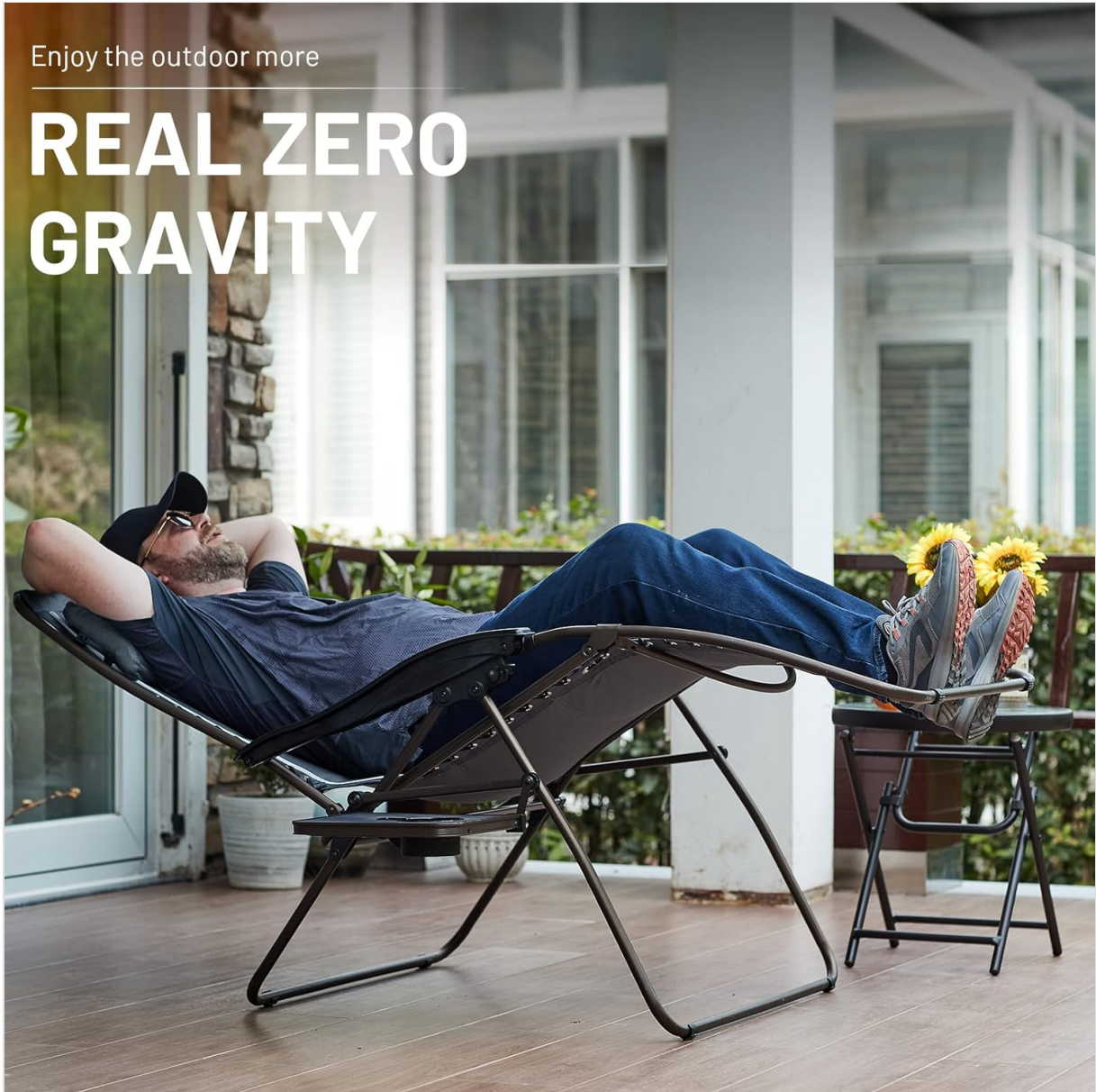
Image 5: A person demonstrating the reclining feature of the zero gravity chair, enjoying outdoor relaxation.