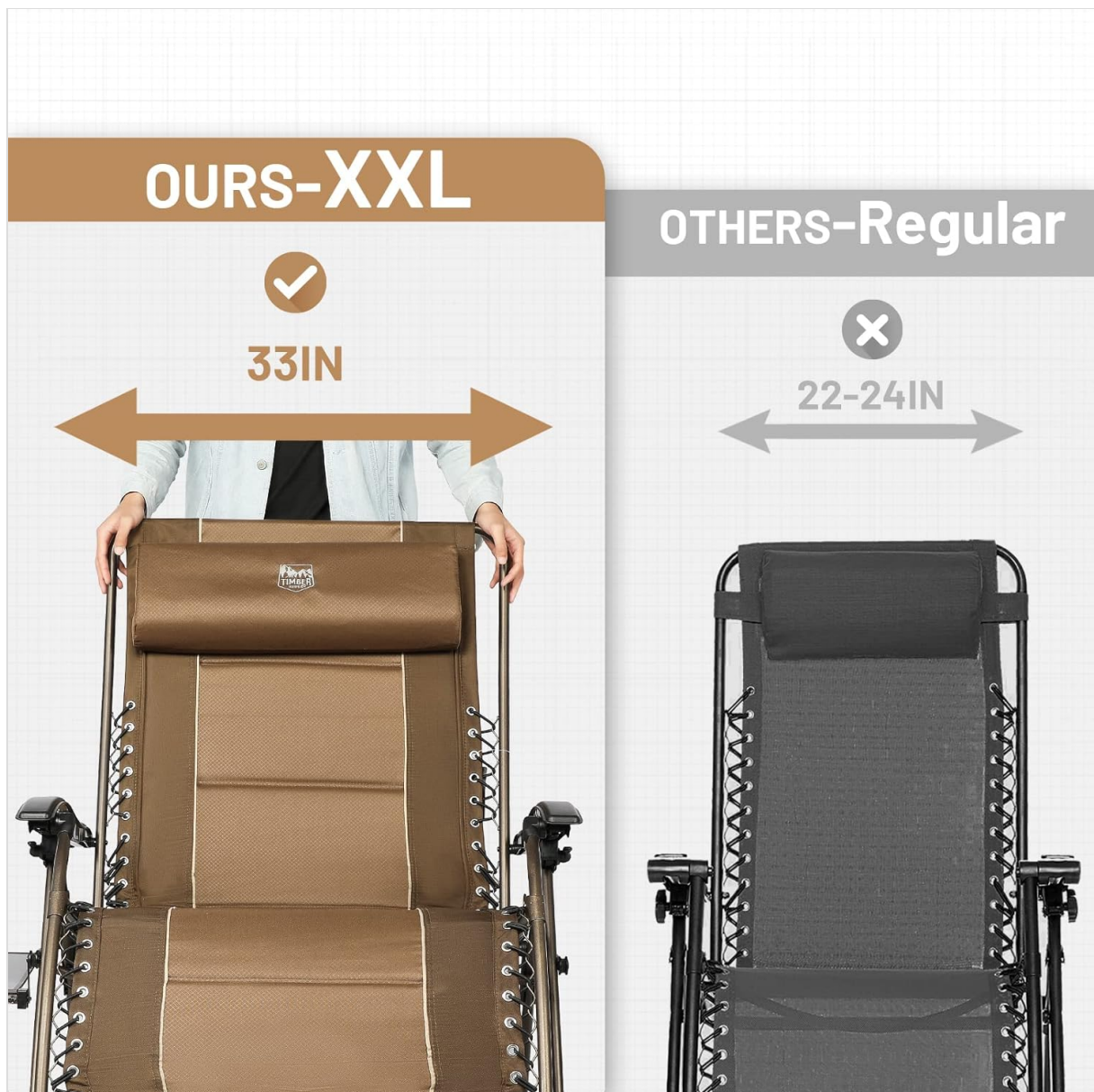
Image 4: Comparison highlighting the 33-inch width of the XXL chair versus regular chairs (22-24 inches).