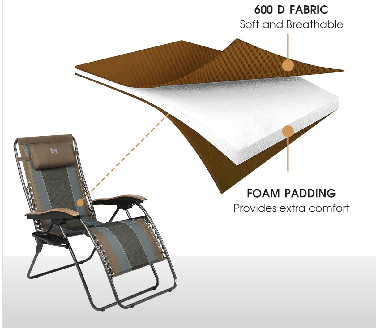
Image 3: Diagram illustrating the comfortable construction with 600D fabric and foam padding for extra comfort.