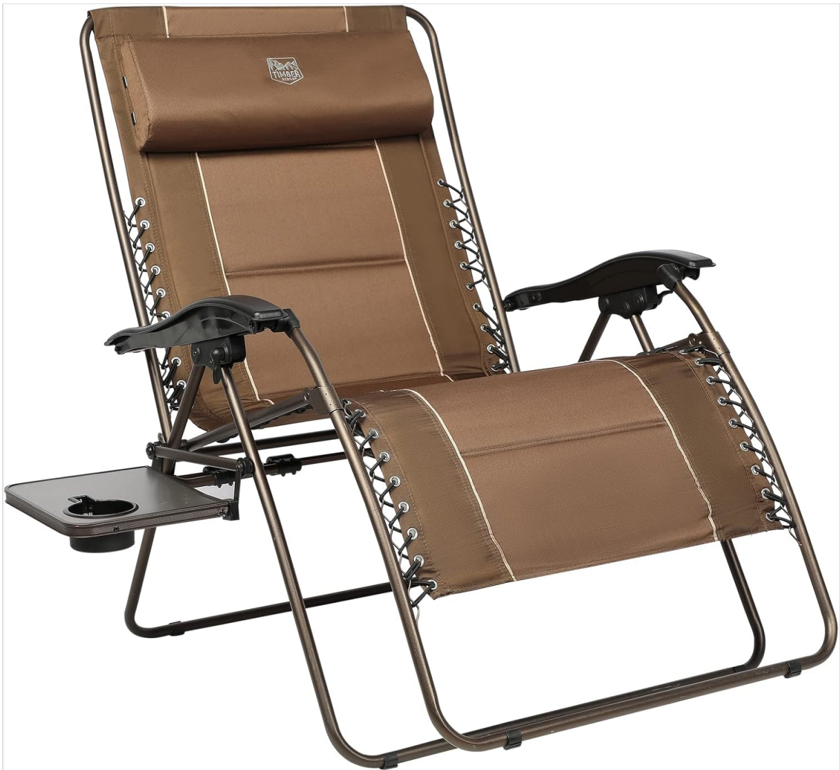
Image 7: The TIMBER RIDGE XXL Lounge Chair with its retractable side tray and built-in cup holder.