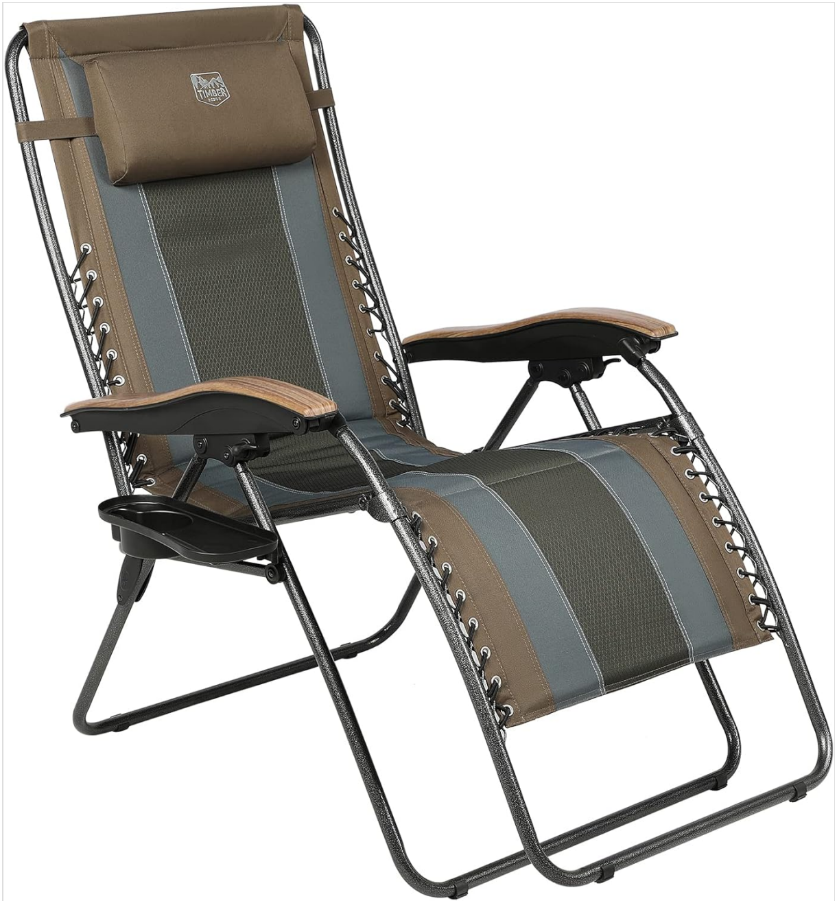
Image 6: The TIMBER RIDGE Patio Chair shown with its convenient side tray extended, featuring a cup holder.