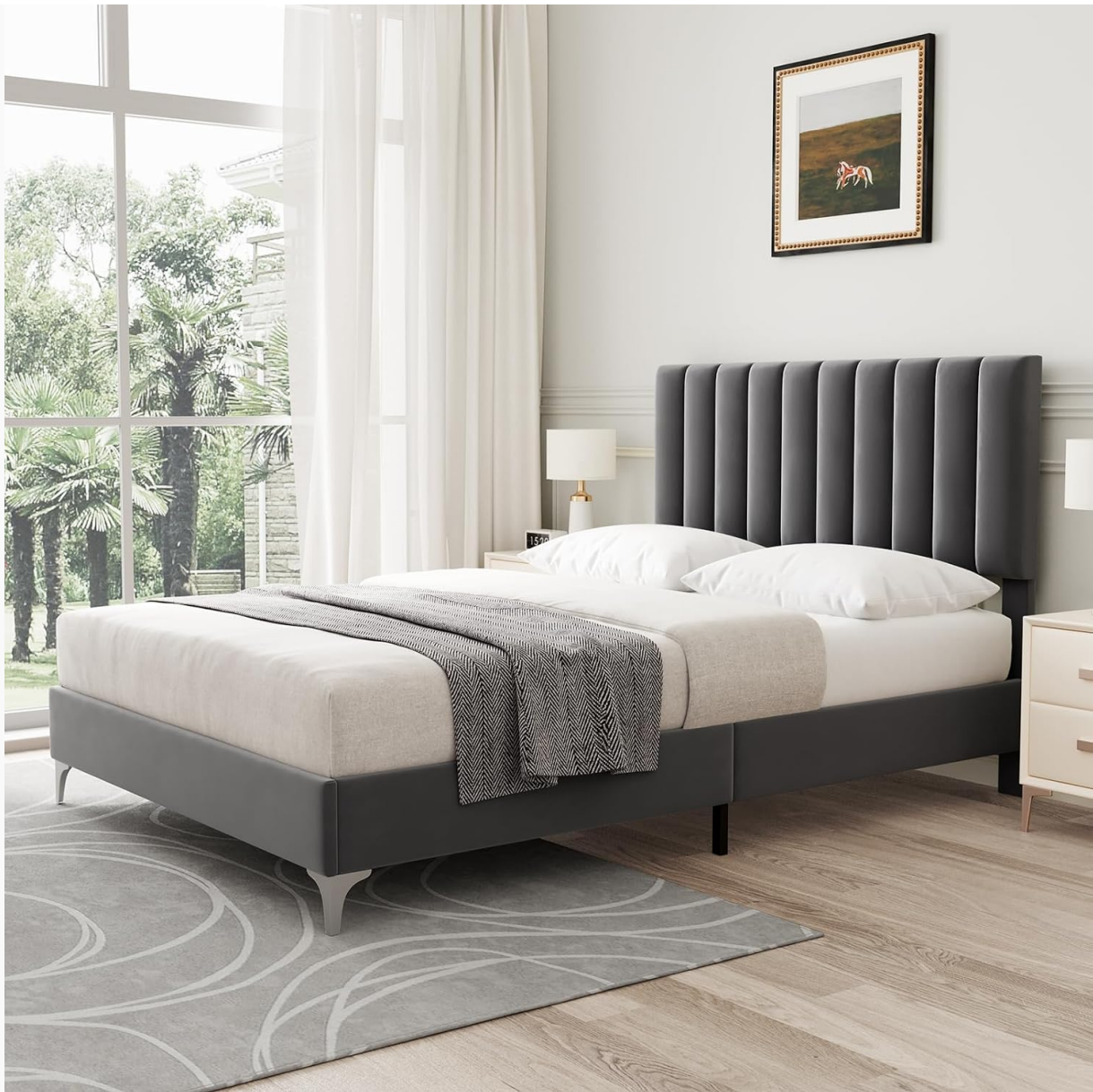
Image 1.1: Fully assembled Amyove Queen Size Bed Frame in a bedroom setting.