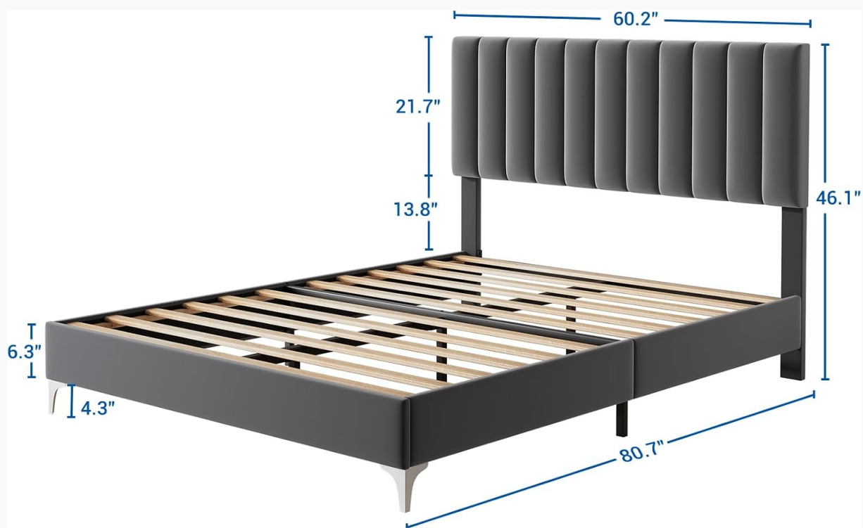
Image 4.1: Diagram illustrating the dimensions of the bed frame components.