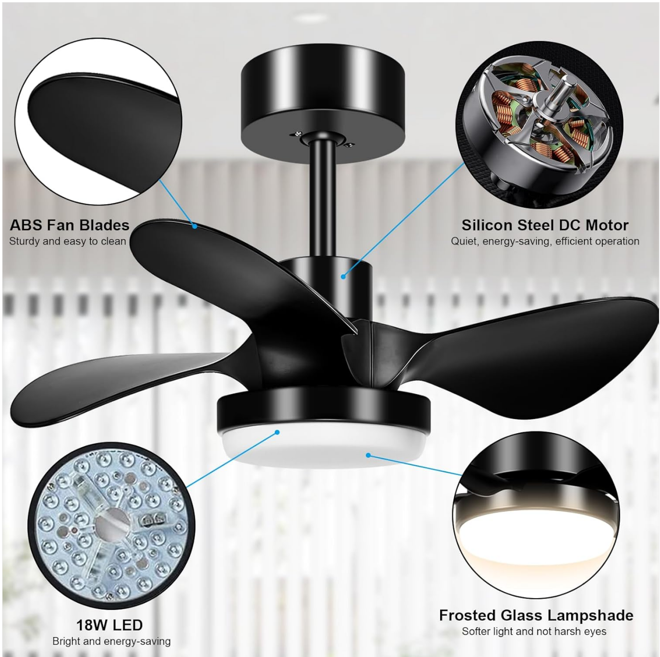
Image 3.1: Key components of the Mefine F299 Ceiling Fan, highlighting the quality materials and design.