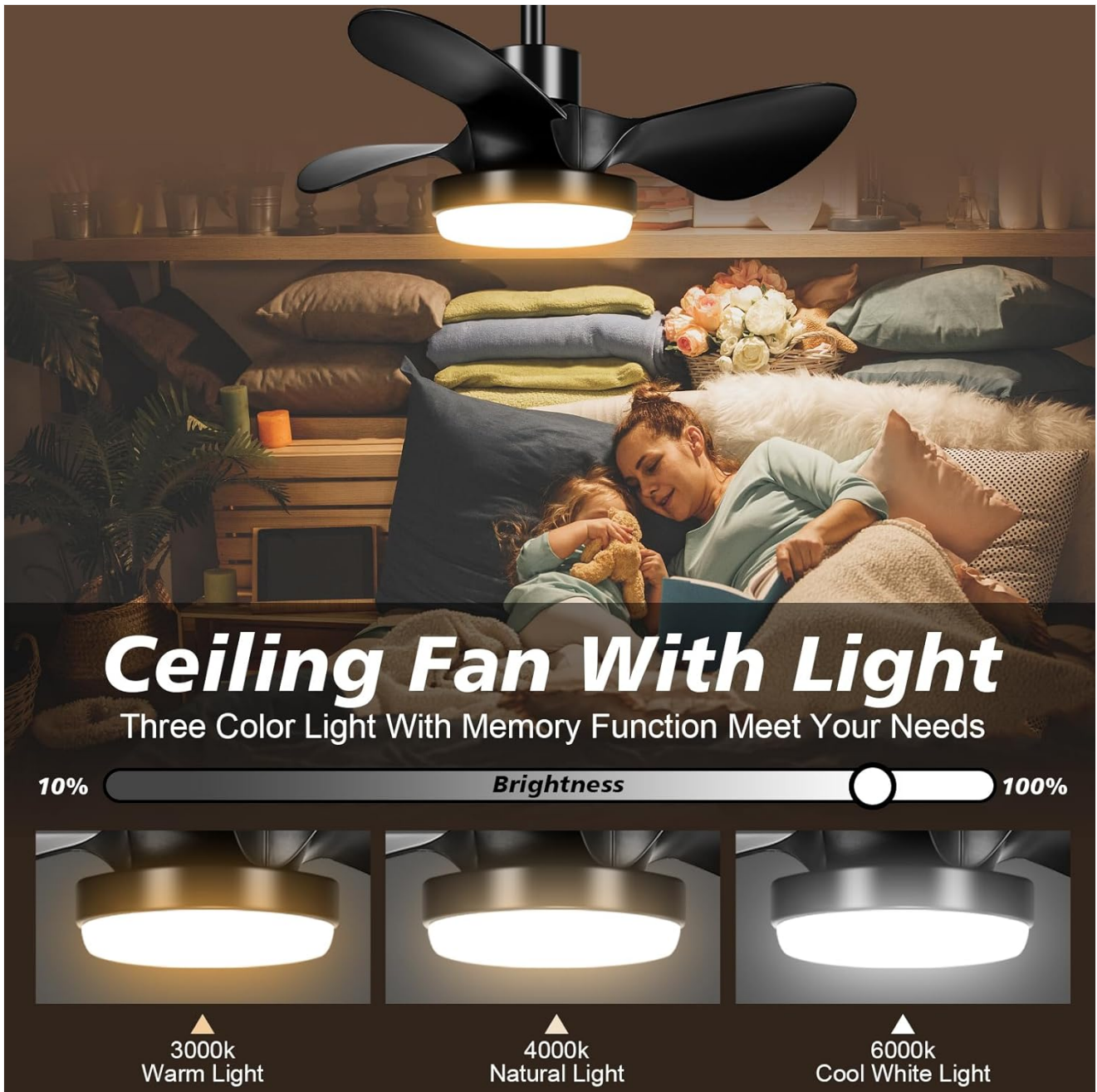
Image 5.3: The adjustable light features of the Mefine F299 Ceiling Fan.