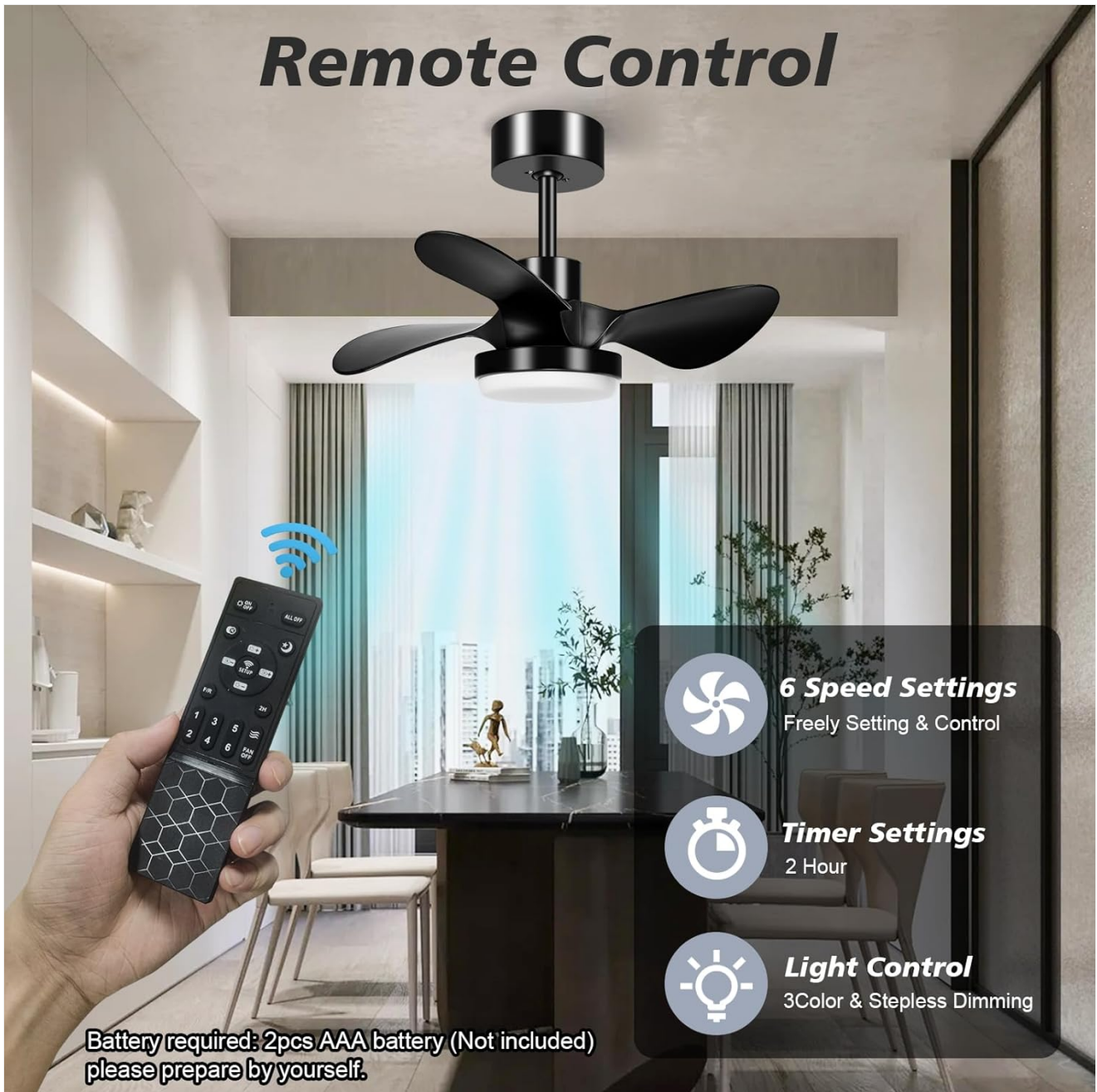
Image 5.1: The remote control for the Mefine F299 Ceiling Fan, illustrating its various functions.