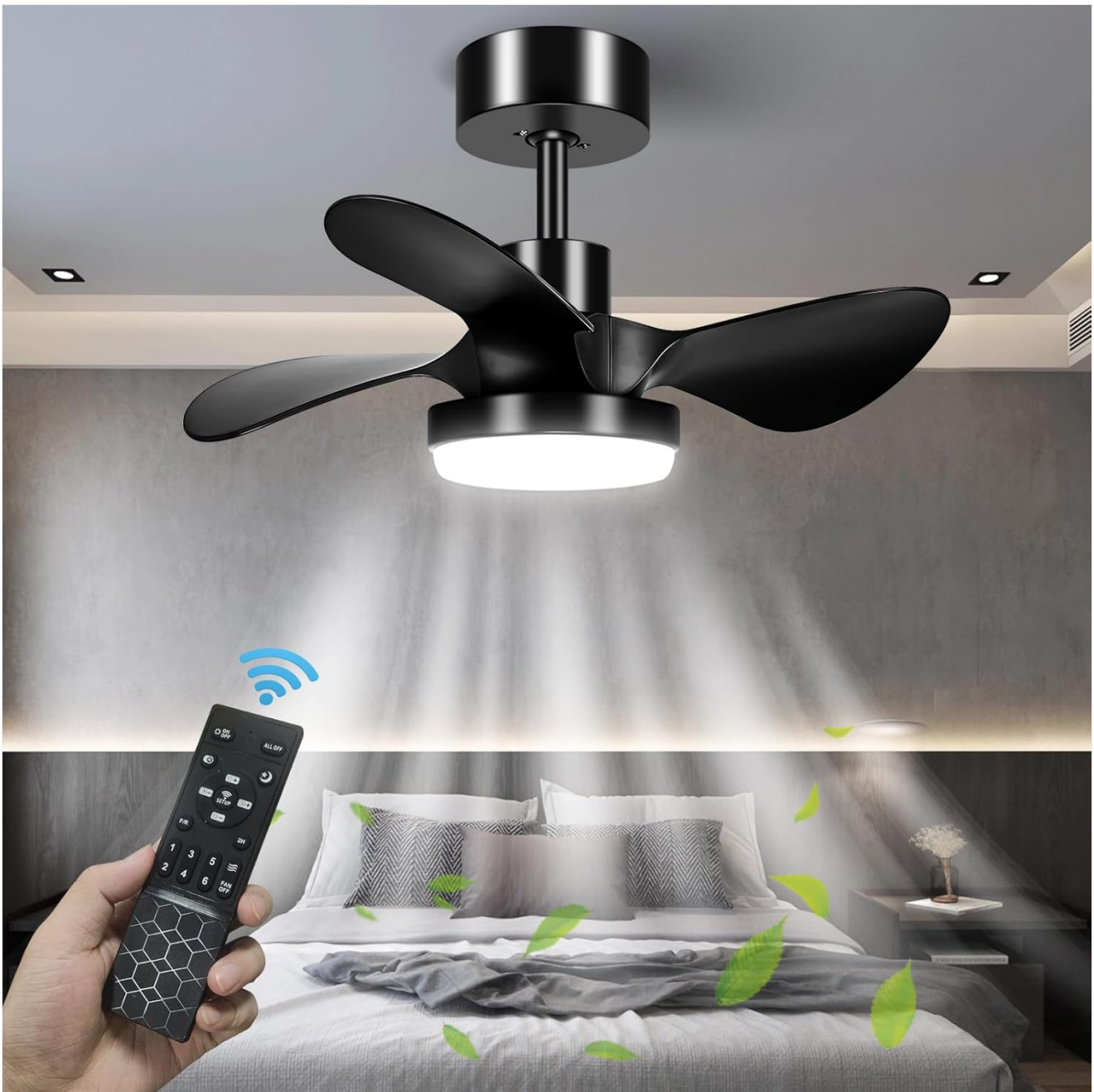
Image 1.1: The Mefine F299 Ceiling Fan with LED Light in a bedroom setting, demonstrating its cooling effect and remote control functionality.