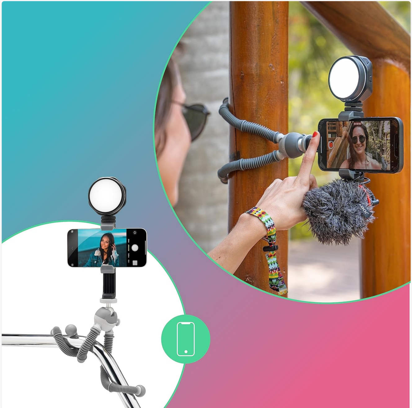
Image 4.1: The flexible tripod wrapped around a pole for stable mounting.