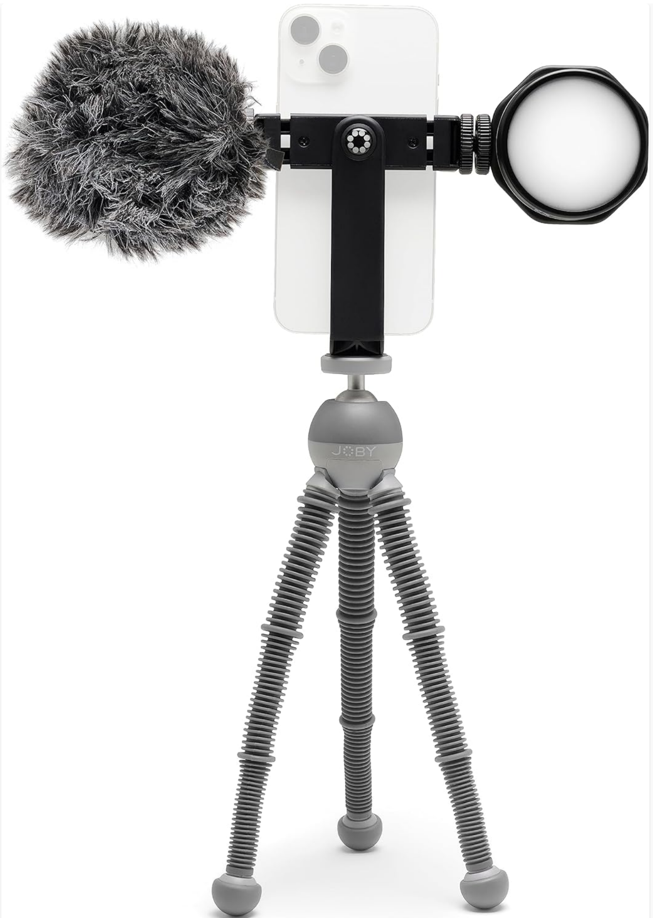
Image 1.1: The JOBY Beamo Reel Creator Kit fully assembled with a smartphone, microphone, and LED light.