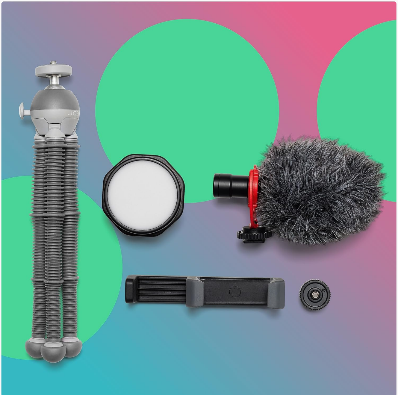
Image 2.1: Individual components of the JOBY Beamo Reel Creator Kit.