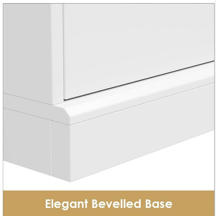
Image: Close-up view of the distinctive cut-out handle, quality ball-bearing slide, and elegant bevelled base, highlighting key construction features.