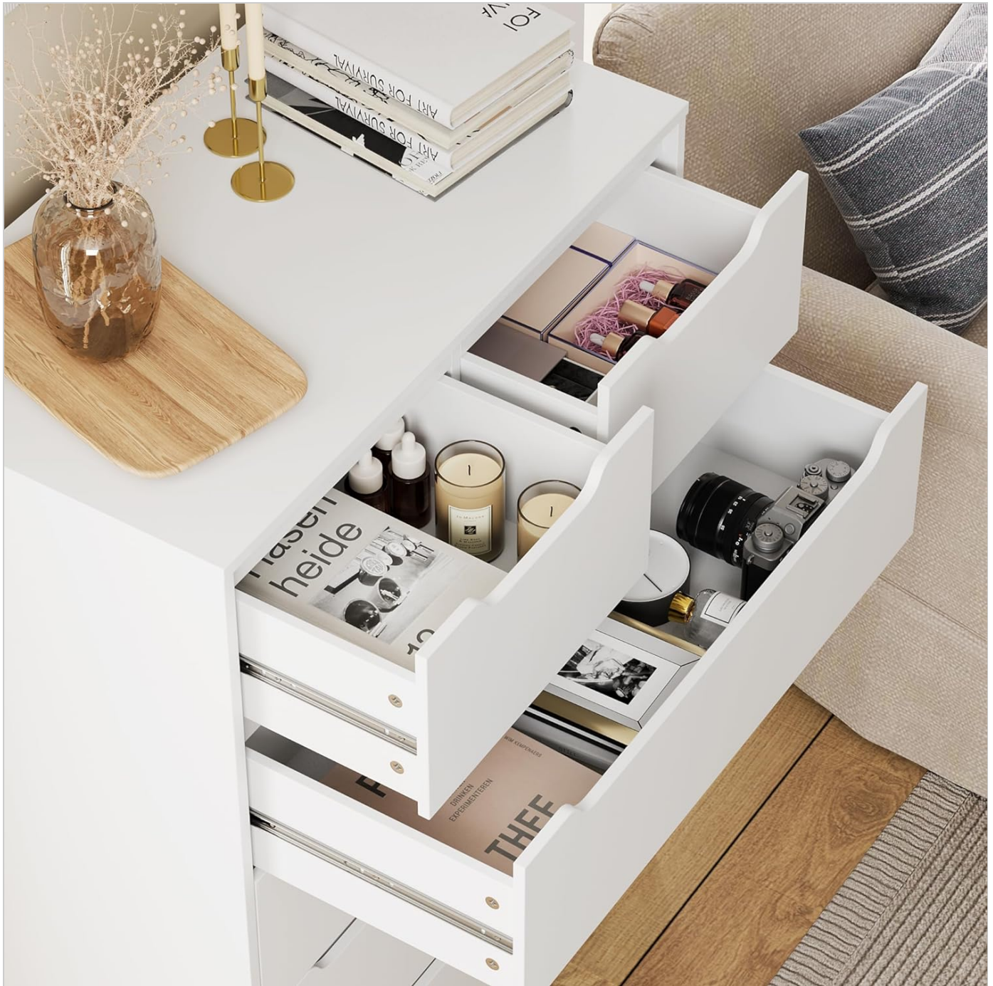
Image: An open drawer revealing its storage capacity, suitable for various items like clothes, accessories, or household goods.

drawer for cleaning or maintenance, pull it out as far as possible, then locate the small safety buckles on the drawer slides. Press one buckle down and lift the other buckle up simultaneously, then pull the drawer out with force.