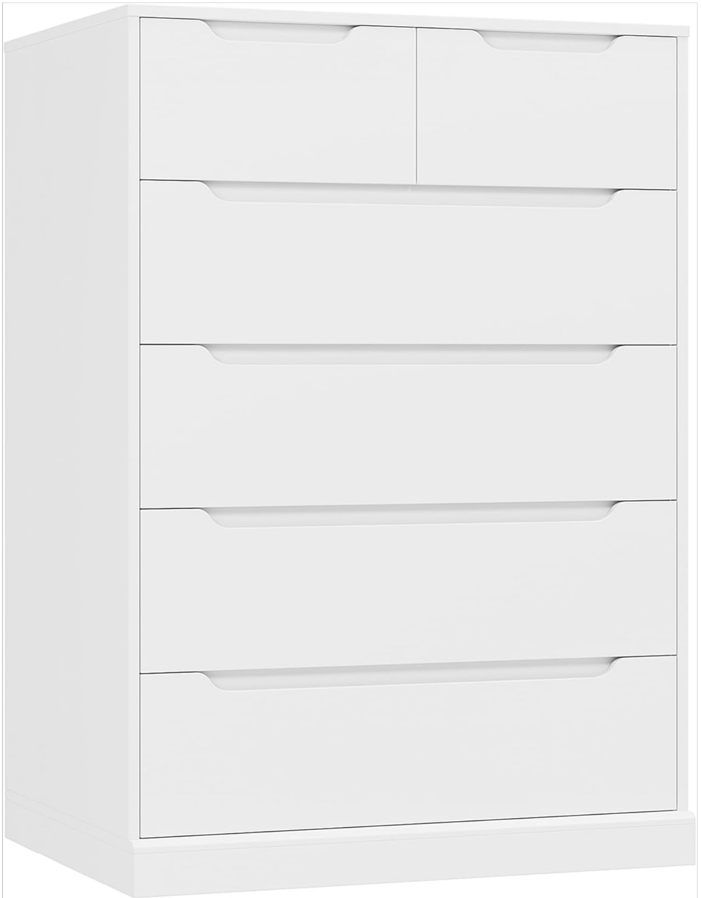
Image: The fully assembled HOSTACK Modern 6 Drawer Dresser in Classic White, showcasing its sleek design and six drawers.