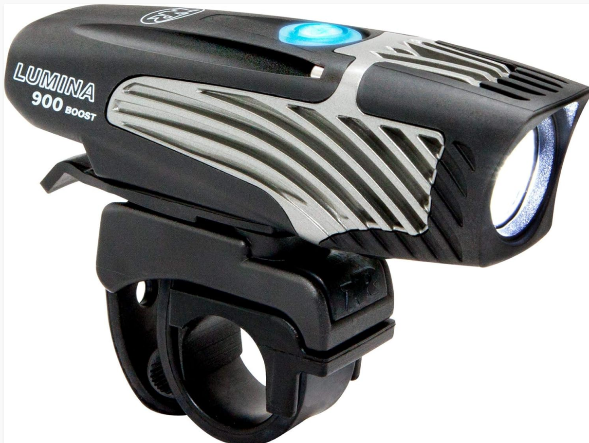
Image: The NiteRider Lumina 900 Boost LED Bike Light, showcasing its compact design and front-facing LED.

The NiteRider Lumina 900 Boost is a high-performance, USB rechargeable LED bike light designed for mountain biking, road cycling, and commuting. It features powerful illumination, water resistance, and multiple lighting modes to enhance visibility and safety during your rides.