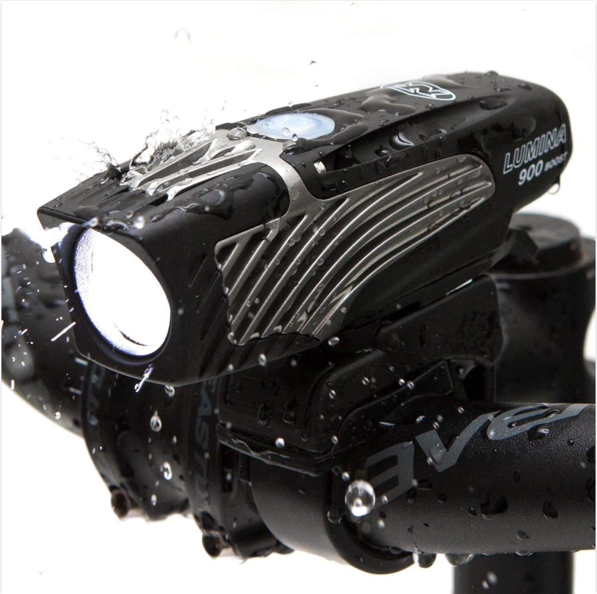
Image: The NiteRider Lumina 900 Boost with water splashing over it, illustrating its water-resistant design.

The Lumina 900 Boost is IP64 rated for water and dust resistance, utilizing gasket sealing. This design allows it to withstand diverse riding conditions and environments. Always ensure the charging port flap is properly sealed.