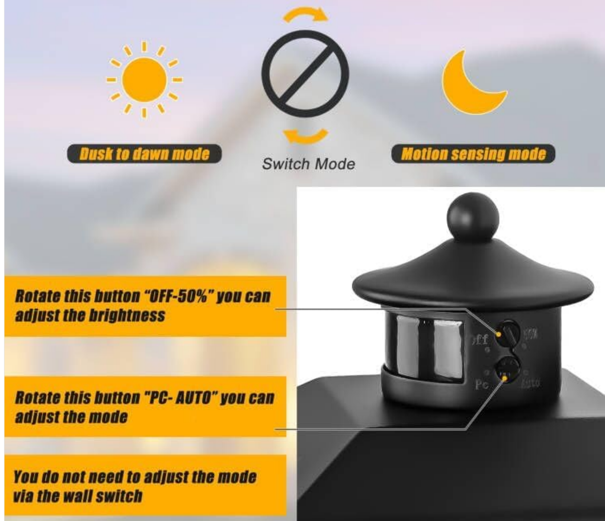
Image: A detailed view of the light's top-mounted dial, illustrating the controls for brightness adjustment and mode selection.