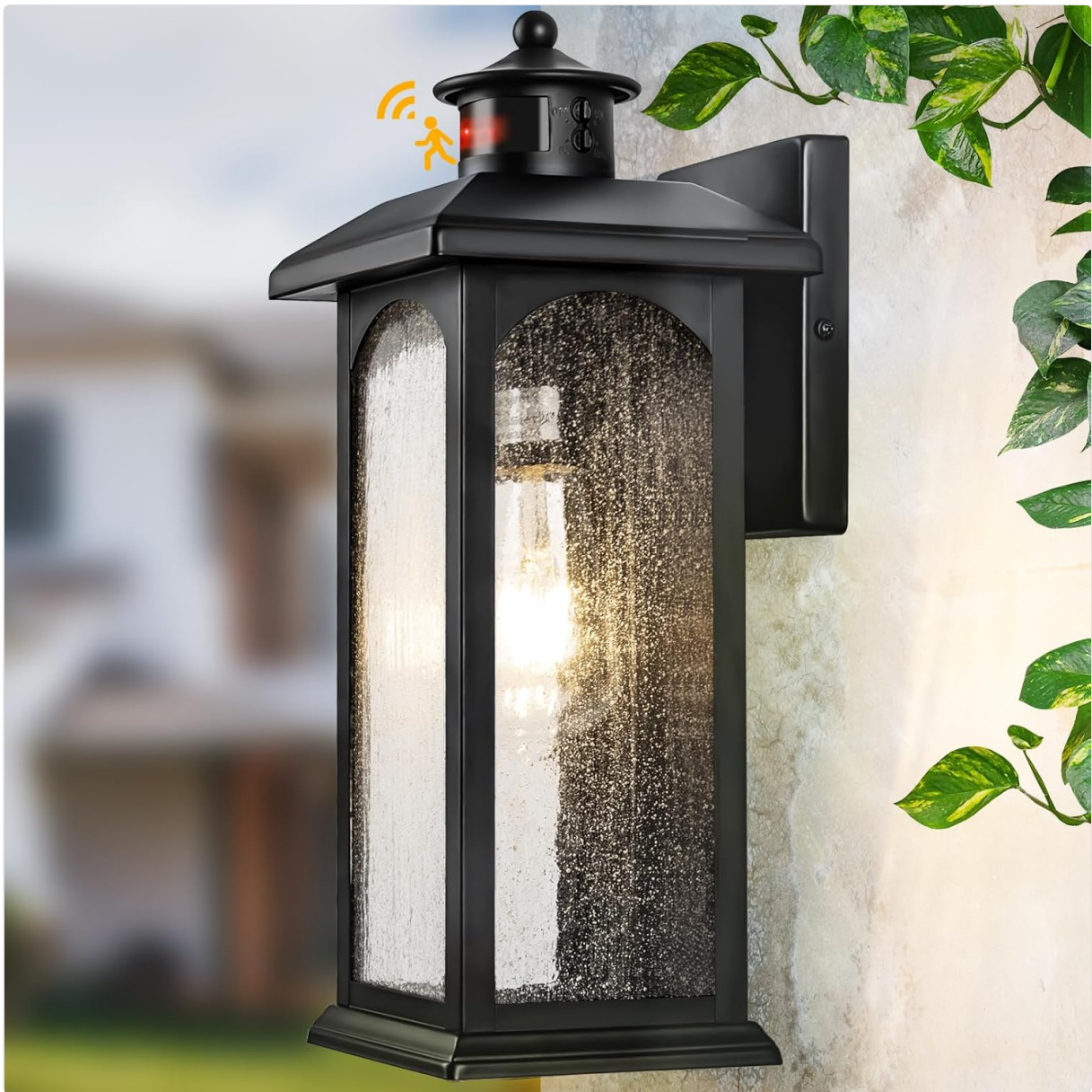
Image: The Brilvibera Motion Sensor Porch Light, showcasing its large size and modern design, installed on an exterior wall.