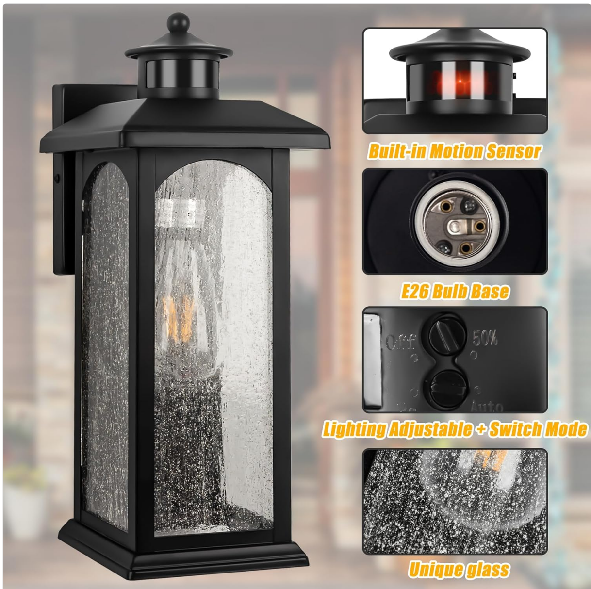
Image: Detailed view of the light fixture, pointing out the built-in motion sensor, E26 bulb base, adjustable lighting dial, and unique glass design.