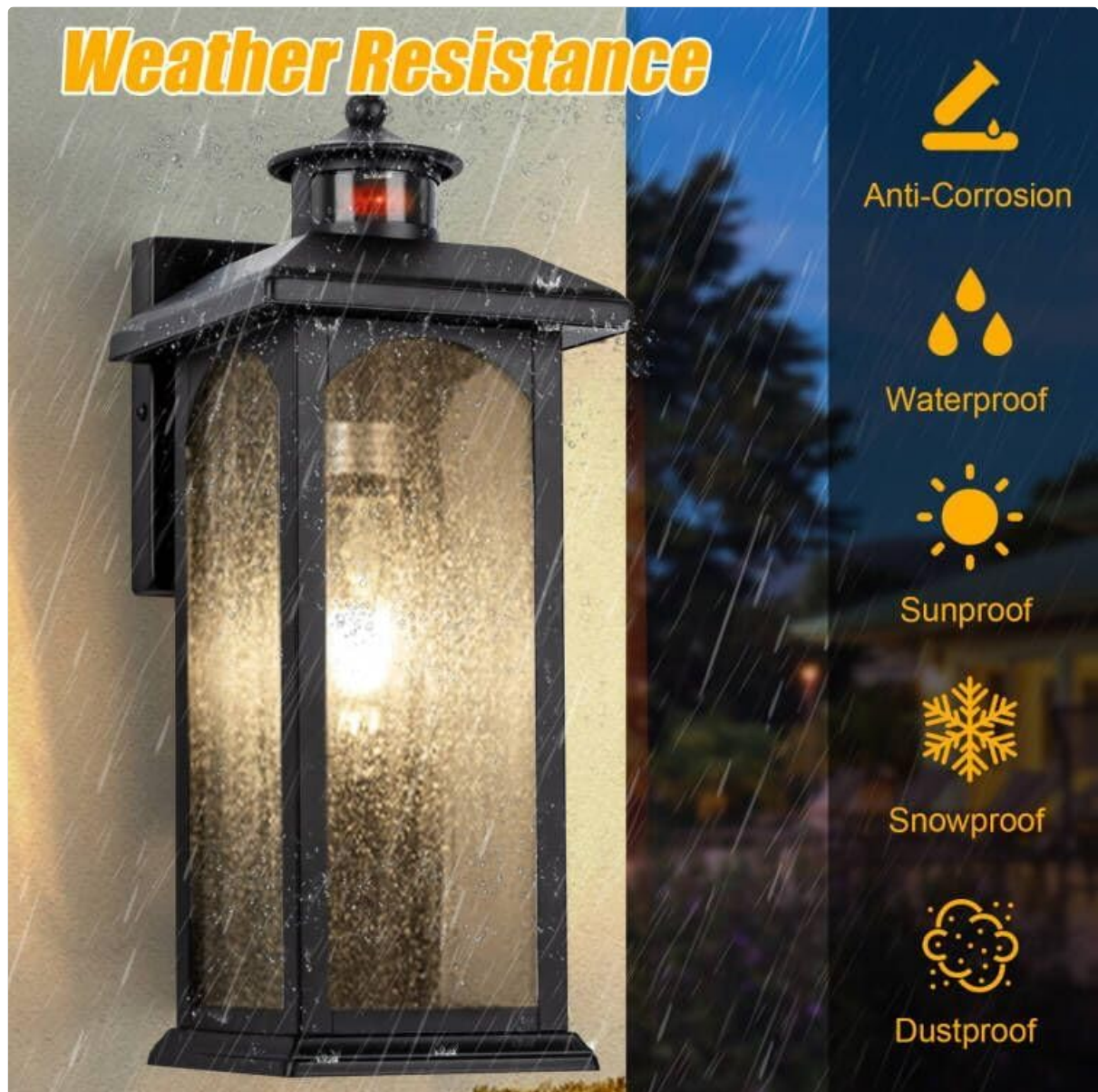
Image: Visual representation of the light's weather resistance, highlighting its anti-corrosion, waterproof, sunproof, snowproof, and dustproof properties.