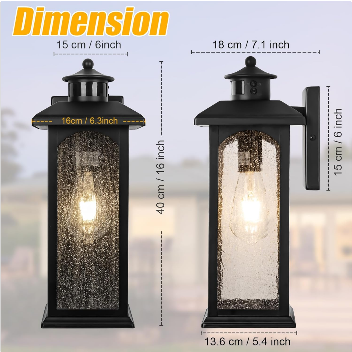
Image: A diagram illustrating the physical dimensions of the light fixture, including its width and height.