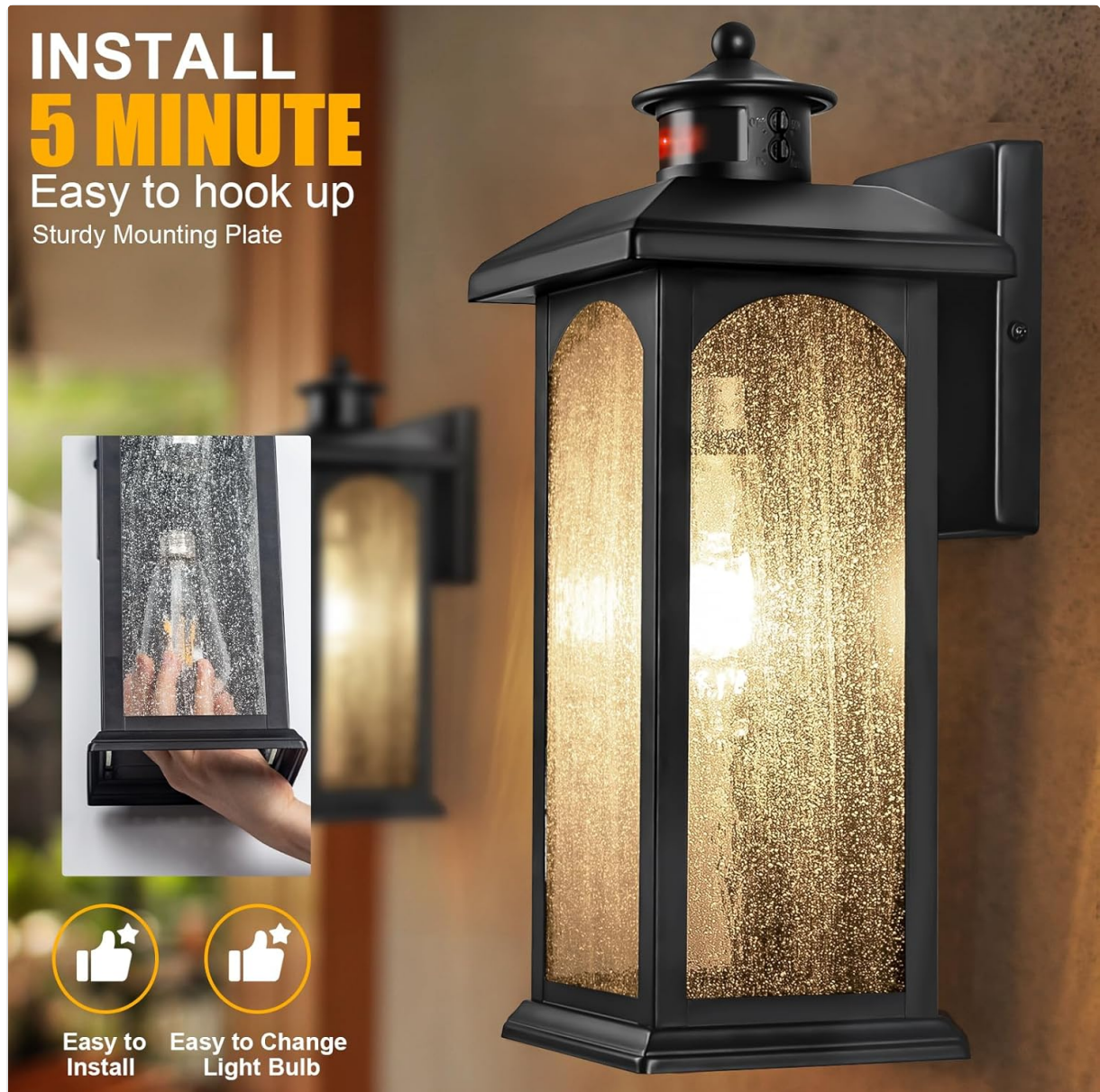
Image: A visual guide indicating the ease of installation, suggesting a 5-minute setup time with a sturdy mounting plate.

6. Restore Power: Turn on power at the circuit breaker.