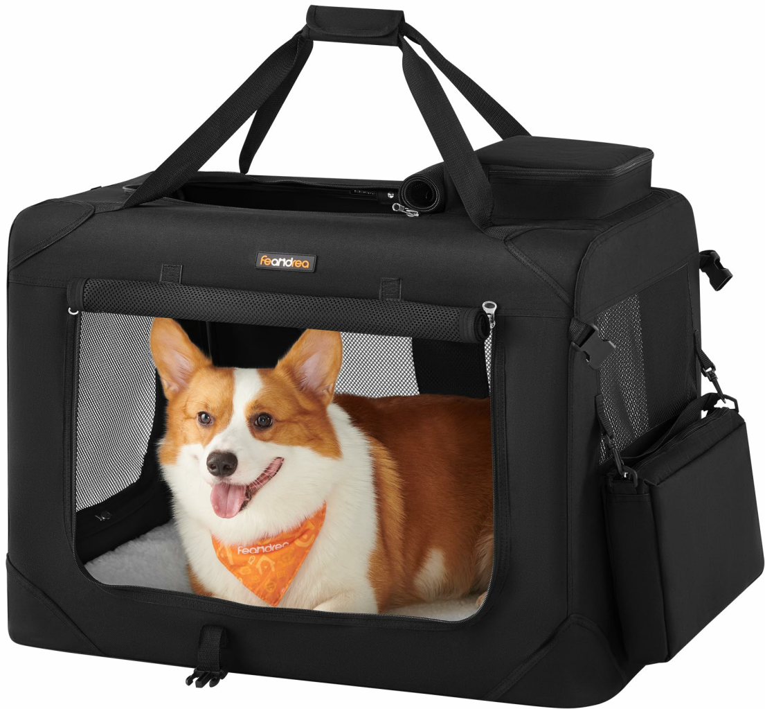
Image: The Feandrea Collapsible Soft Dog Crate, showcasing its design and a dog comfortably inside.