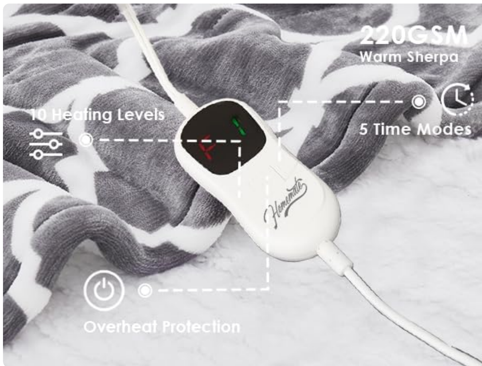
Close-up of the detachable controller cord connecting to the Homemate Heated Blanket.