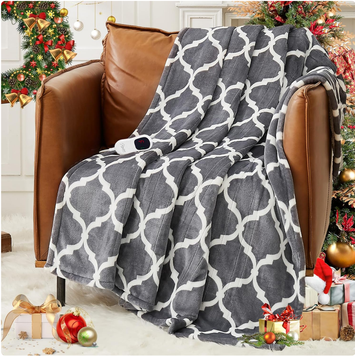
The Homemate Heated Blanket Electric Throw, featuring a grey geometric pattern, draped over a chair in a cozy setting.