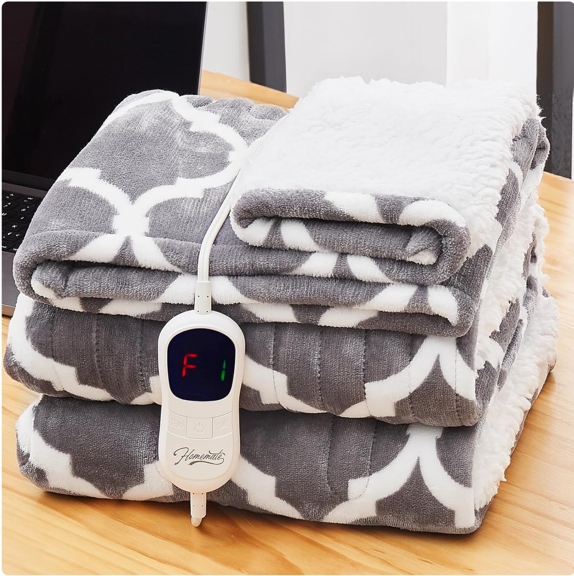
Detailed view of the Homemate blanket controller, showing the digital display for heat levels and timer settings, along with temperature and time control buttons.