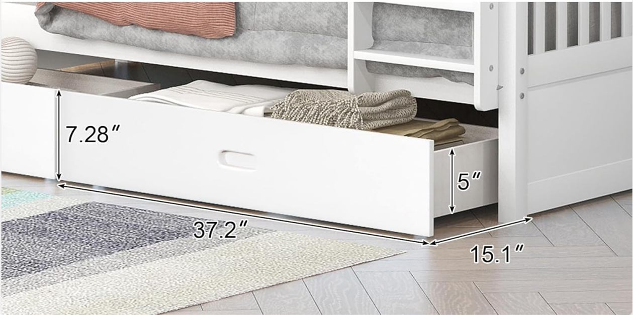
Image 3: Close-up view of the large capacity storage drawers under the Merax bunk bed. This image illustrates the depth and accessibility of the drawers for storage.