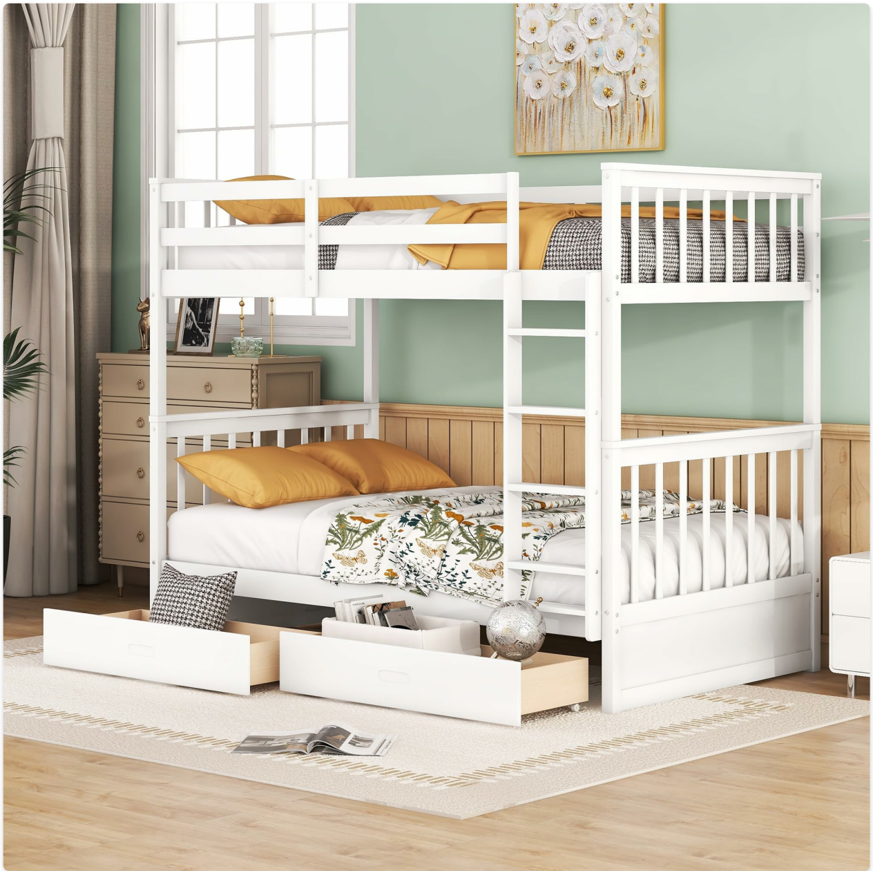
Image 1: Assembled Merax Twin Over Twin Bunk Bed with Drawers. This image shows the complete bunk bed unit in a room setting, highlighting its design and integrated drawers.