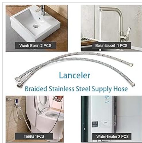
Image: Examples of faucet supply line applications, including wash basins, toilets, and water heaters.