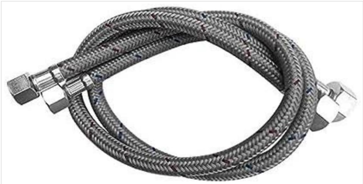
Image: RKF 23.6 Inch Faucet Supply Line, showing the braided stainless steel construction and connection ends.

This instruction manual provides important information for the safe and effective installation, operation, and maintenance of your RKF 23.6 Inch Faucet Supply Line, Model H02. Please read this manual thoroughly before installation and retain it for future reference.