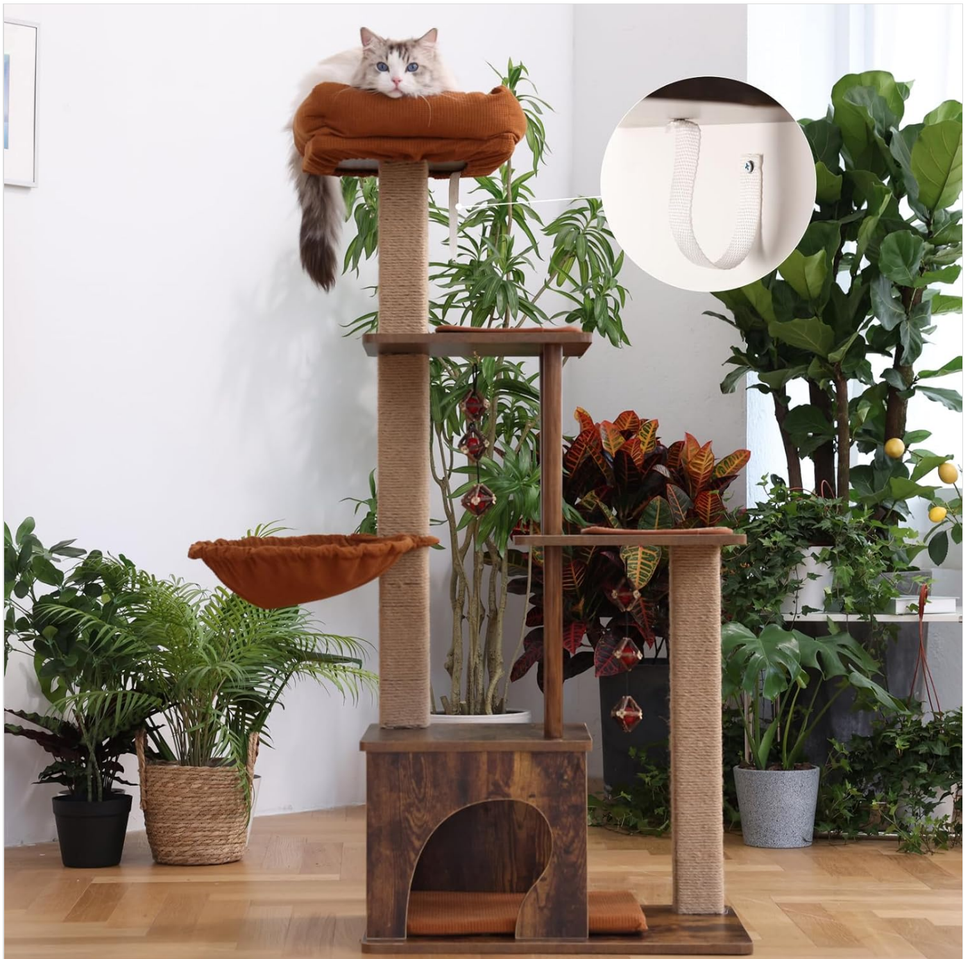
Image: The FUKUMARU Cat Tree positioned against a wall, highlighting the anti-tipping strap securely fastened to the wall for enhanced stability. This demonstrates a critical safety feature.