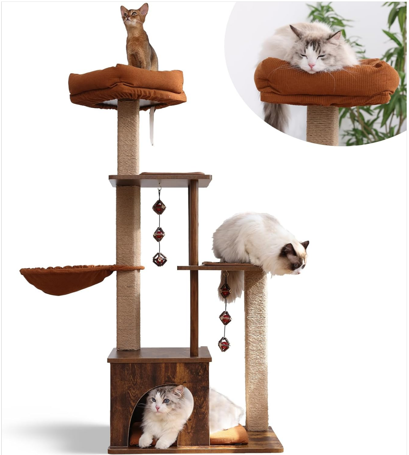
Image: The FUKUMARU Cat Tree Model AT05, showcasing its multi-level design, scratching posts, hammock, and cat condo, with several cats enjoying the structure. This provides an overview of the assembled product.