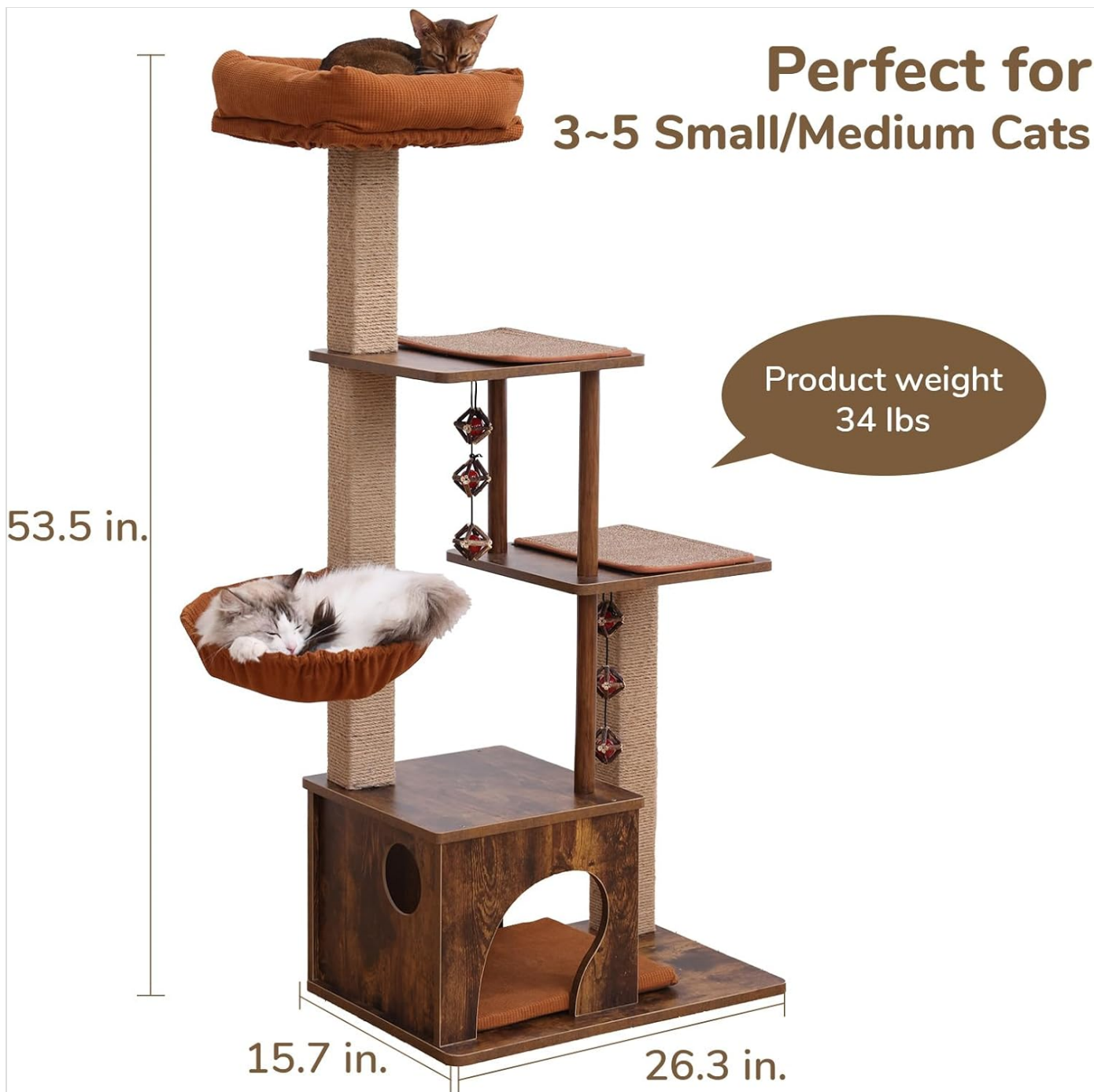
Image: A cat comfortably nestled in the soft, brown hammock of the cat tree, demonstrating its use as a lounging spot.