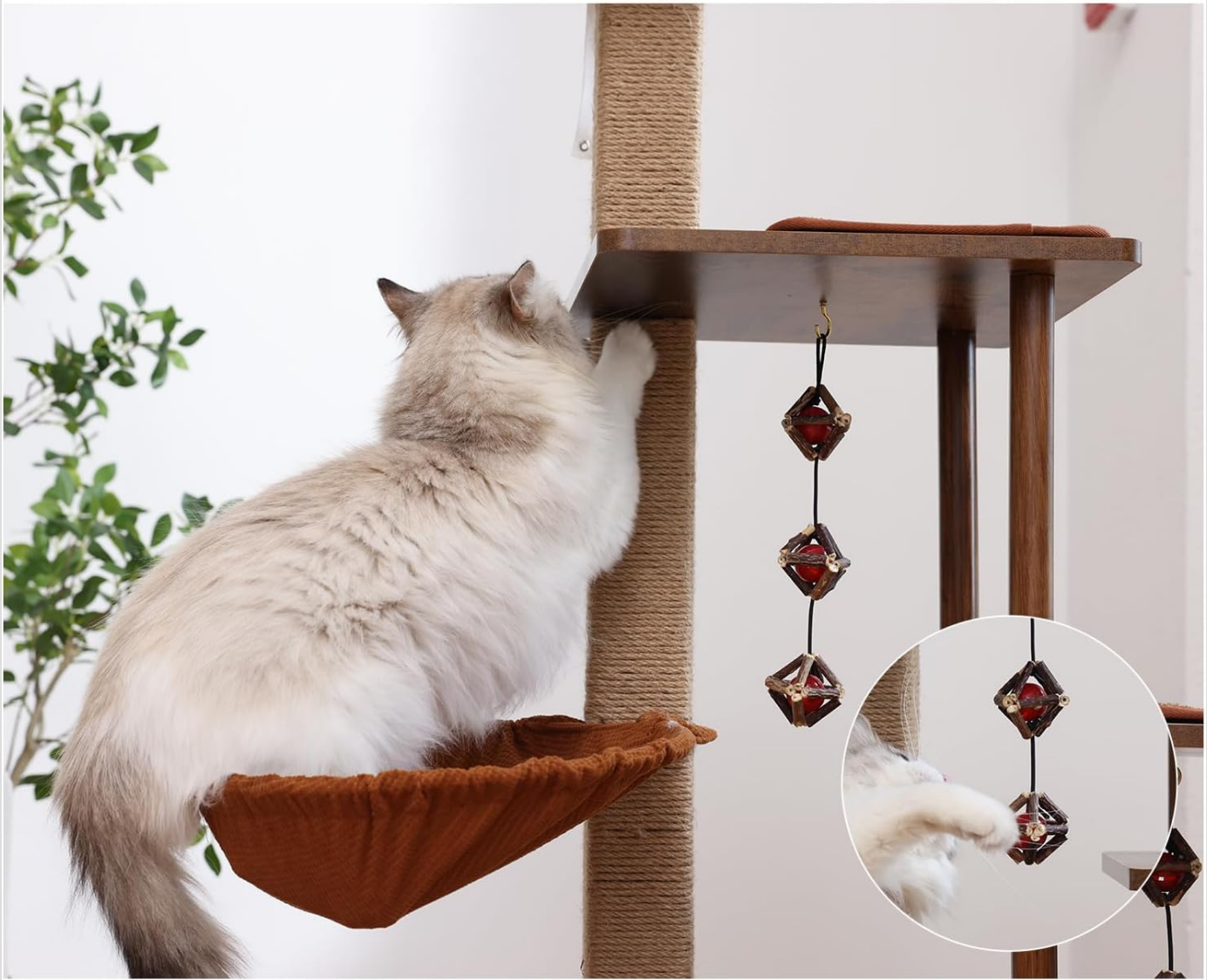
Image: A cat engaging with one of the thick jute scratching posts, highlighting the durability and purpose of the scratching surfaces.

Four 80*80 mm jute square columns, sturdy and durable