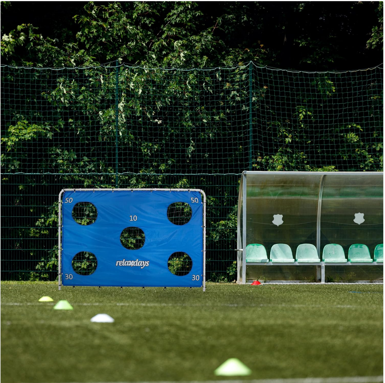
Image: The Relaxdays football goal, featuring its blue target wall, positioned on a green artificial turf field, indicating its suitability for training sessions.