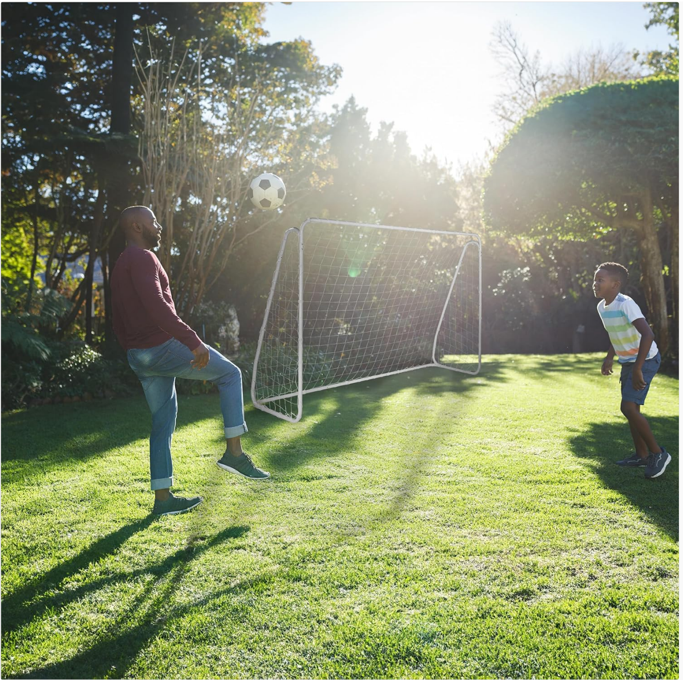
Image: A father and son enjoying a game of football in a sunny garden, with the Relaxdays football goal set up in the background, ready for play.