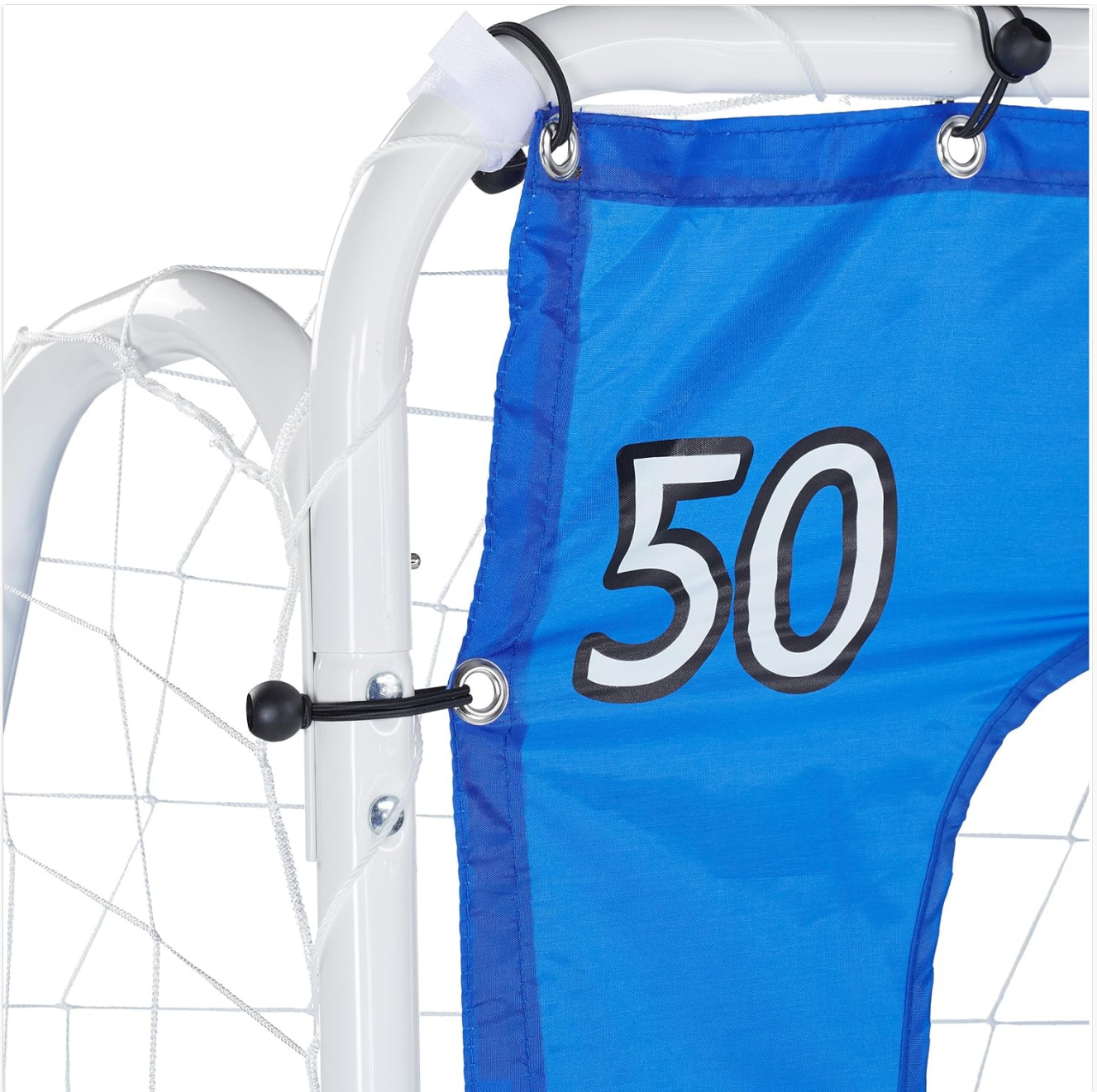
Image: Detailed view of how the target wall is secured to the goal frame using elastic loops and hooks, ensuring a snug fit for target practice.