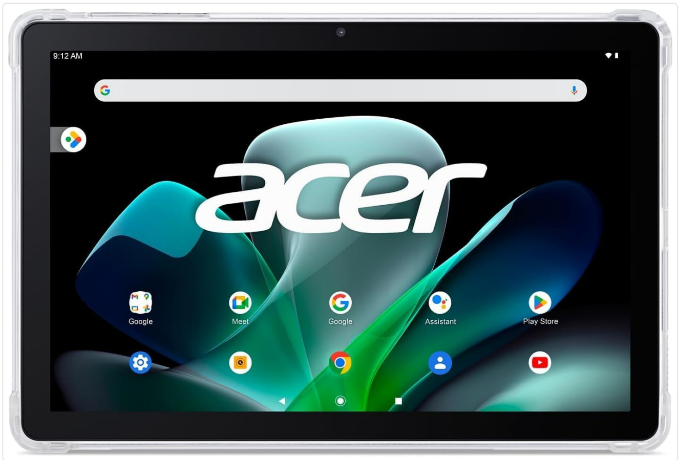
The Acer Iconia Tab M10 with its included transparent bumper case.