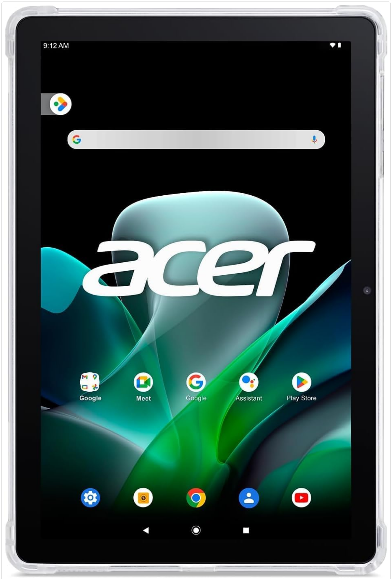
The Acer Iconia Tab M10 ready for use with its protective bumper case.