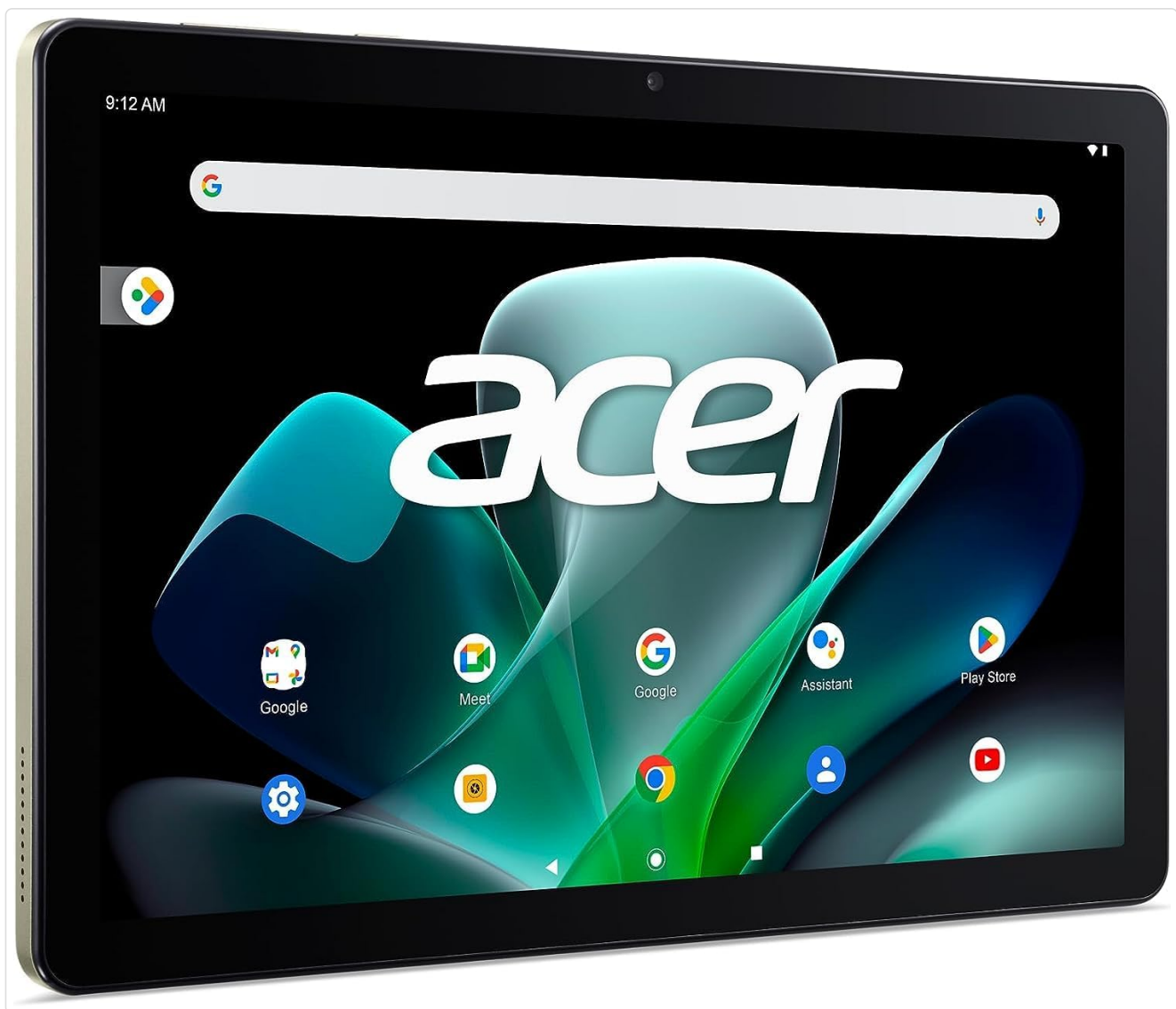
The home screen of the Acer Ionia Tab M10, showing typical Android interface elements.