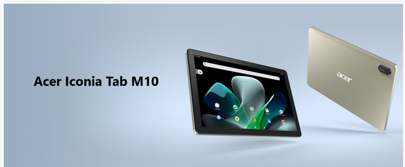
Overview of the Acer Iconia Tab M10 tablet.

The Acer Iconia Tab M10 is a versatile tablet designed for entertainment, productivity, and family use. Featuring a large 10.1-inch WUXGA (1920 x 1200) display, it offers a vibrant visual experience for watching movies, reading, or playing games. Its thin and lightweight design, combined with a long battery life, makes it an ideal companion for both home and on-the-go use. This manual provides essential information for setting up, operating, maintaining, and troubleshooting your device.