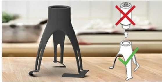
Image: The three-legged design of the stirring unit, which is removable for cleaning.