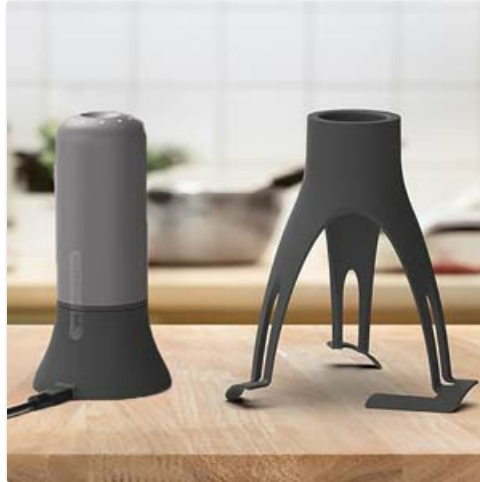
Image: The main stirring unit placed on its USB charging cradle.