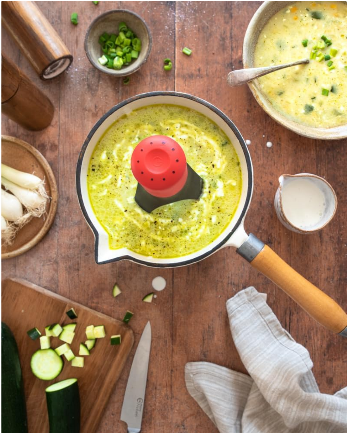
Image: Close-up of the Uutensil Stirr Plus actively stirring a mixture in a small pot.