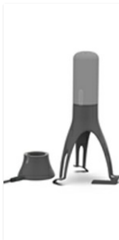
Image: The main stirring unit detached from the removable nylon stirring legs.