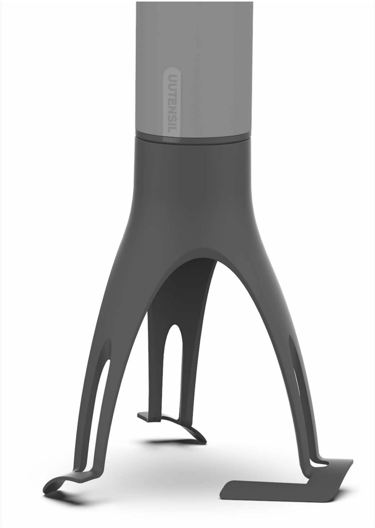
Image: The Utensil Stirr Plus in operation, stirring contents within a pot on a stovetop.