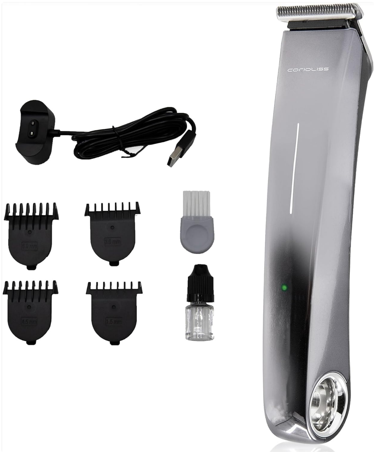
Image: The Corioliss Trimmer 265 shown with its charging cable, cleaning brush, oil, and four guide combs.