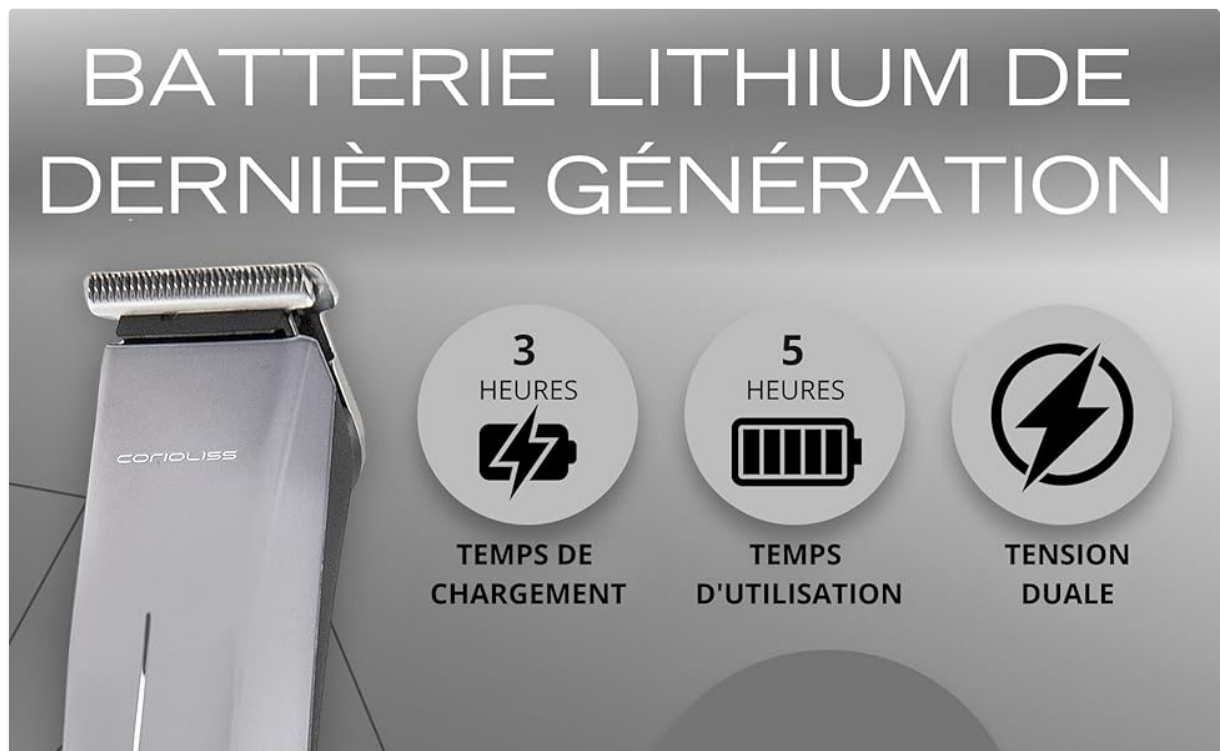
Image: Diagram illustrating the Corioliss Trimmer 265's 3-hour charging time and 5-hour usage time, highlighting its lithium battery and dual voltage capability.