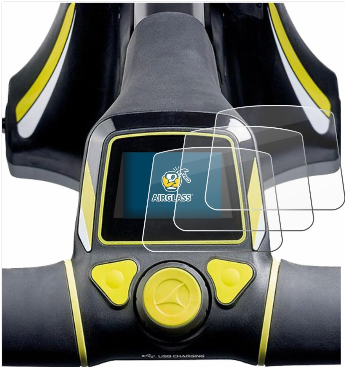
Image: Screen protectors positioned on the Motocaddy M3 Pro Electric Trolley display.