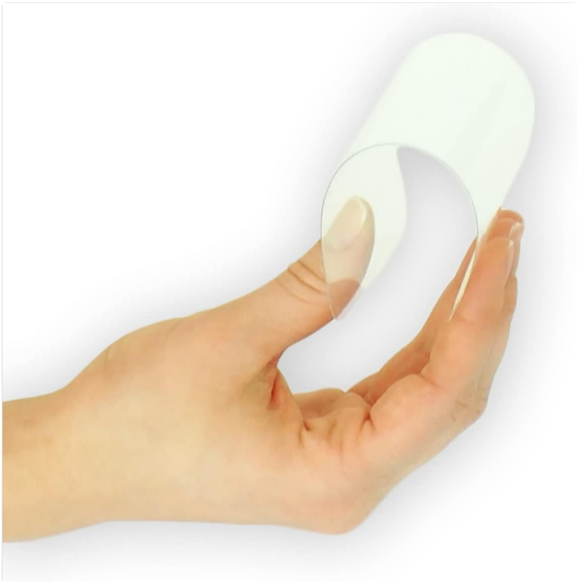
Image: The flexibility of the AirGlass screen protector.