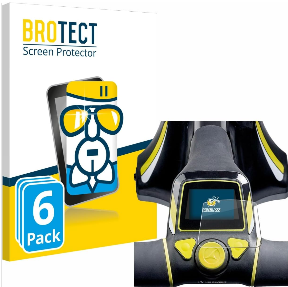
Image: BROTECT AirGlass Screen Protector packaging and the protector applied to a Motocaddy M3 Pro Electric Trolley screen.