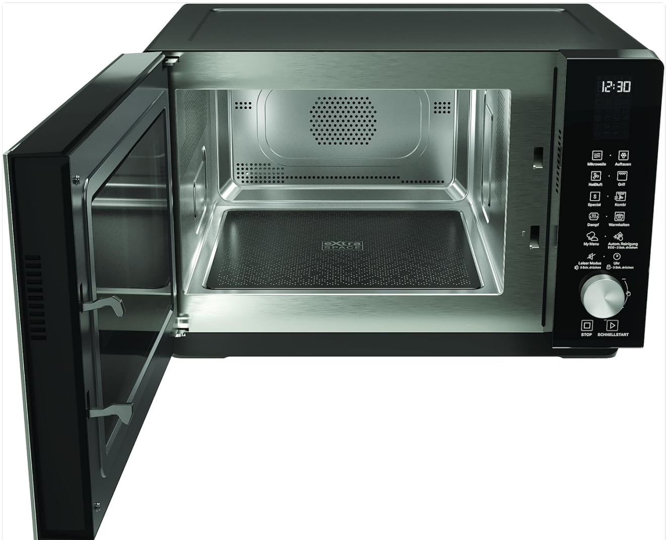
Figure 1: Front view of the Bauknecht MF 255 B microwave oven with the door open, highlighting the spacious interior and control