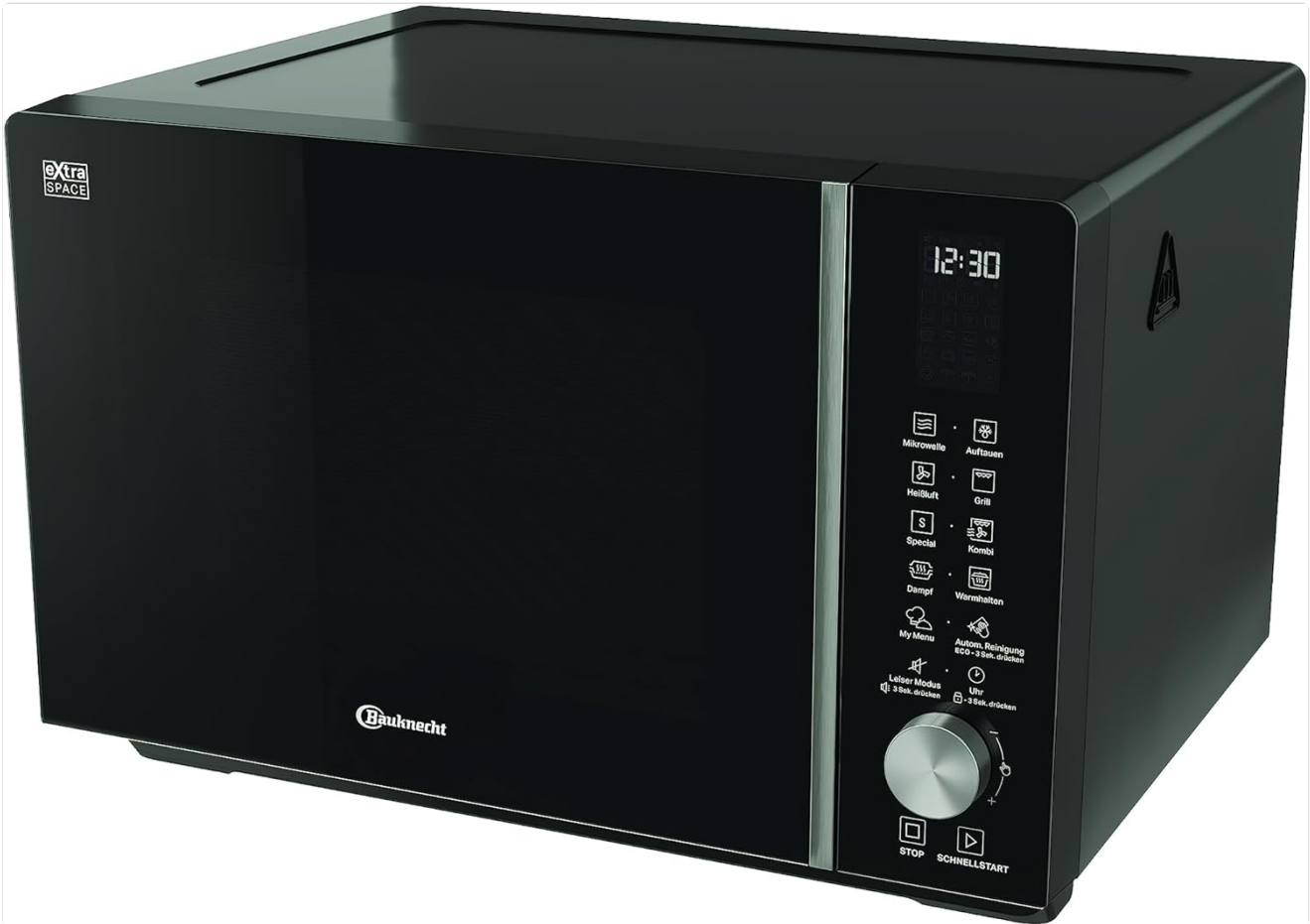
Figure 2: Closed view of the Bauknecht MF 255 B microwave oven, showcasing its compact design and black finish.